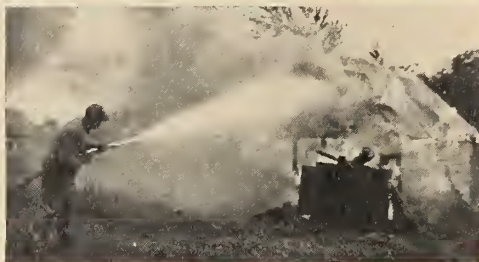
This demonstration of fighting fire with the orchard spray rig is typical of those given in Michigan.

720 British thermal units. The 20 gallons of spray falling effectively on the fire will absorb in one minute the heat from burning 13 pounds of coal. That, in 10 hours, would be the equivalent of burning a winter's supply of six tons of coal or 15 short cords of hardwood—in other words a hot fire.