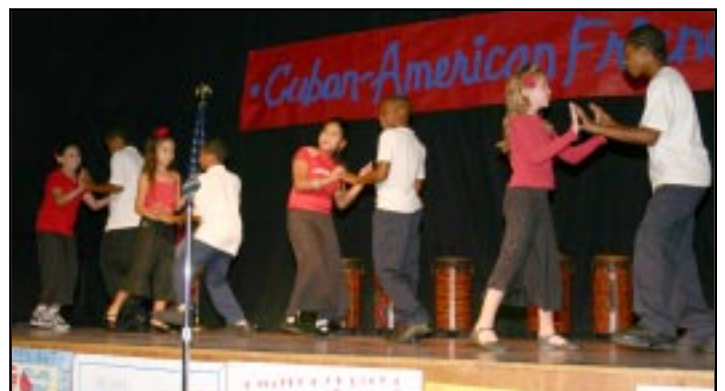
Students provided musical and dance entertainment.