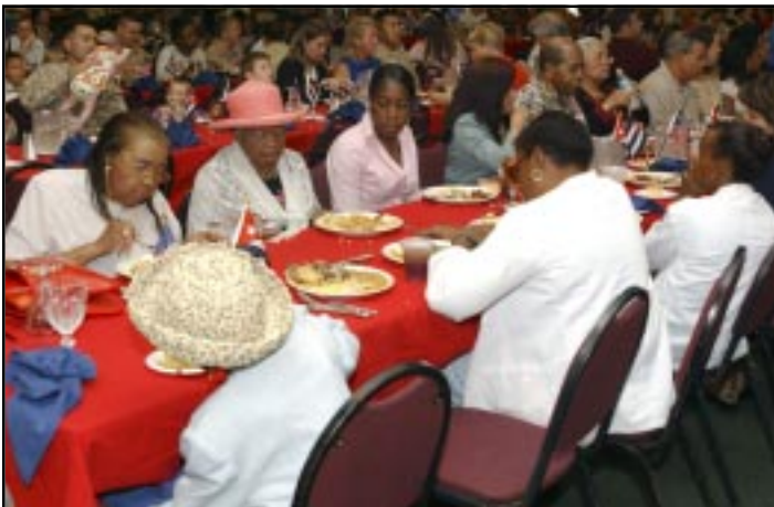
Cuban special category residents were honored guests at the day's activities.