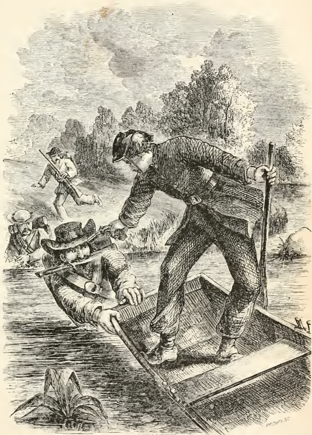
Down the Shenandoah. Page 230.