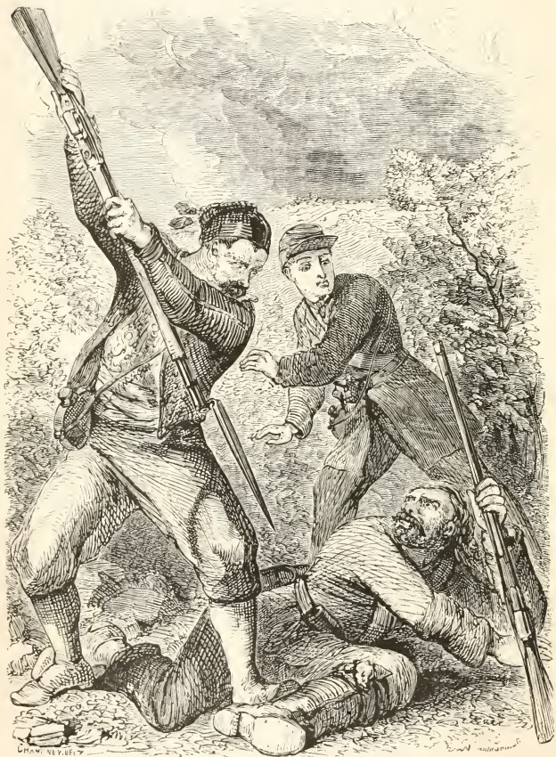
On the Retreat from Bull Run. Page 138.