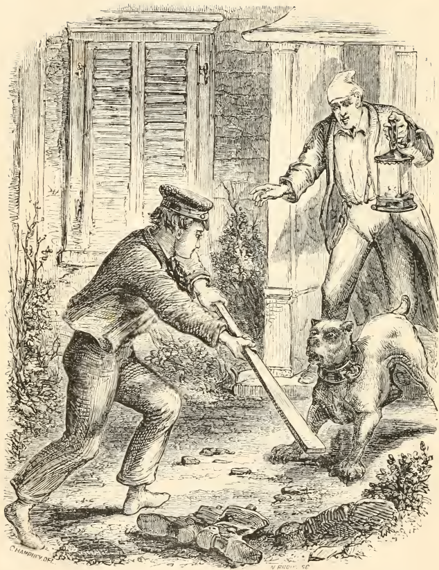
Tom's Battle at Midnight. Page 75.