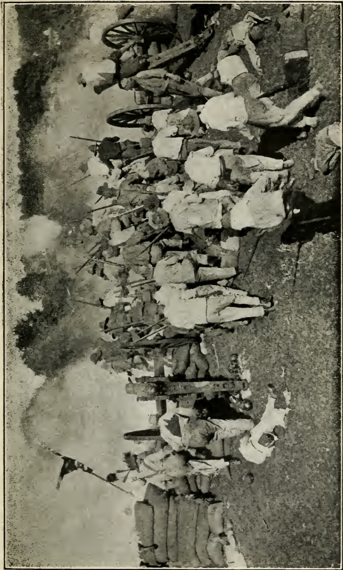
Scene from the Photo-play, "The Crisis."