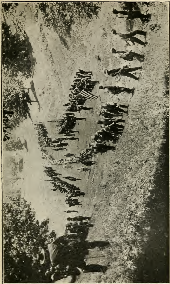
Scene from the Photo-play, "The Crisis."