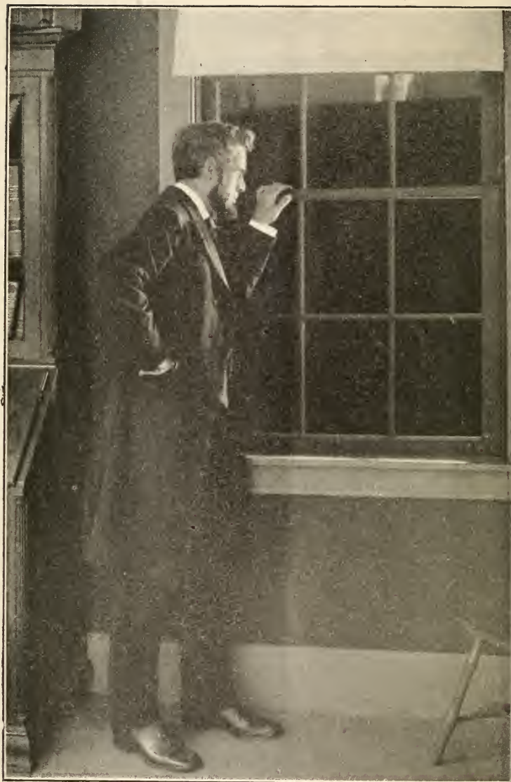
Scene from the Photo-play, "The Crisis."