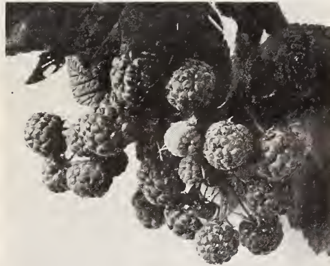
St. Regis Raspberries

PRICES: 70c per 10; $6.00 per 100 EARLY HARVEST. Extra early. Medium sized berries of good quality. ELDORADO. Large, sparkling black fruit. Very sweet.