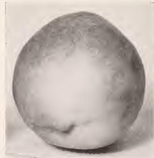
Belle of Georgia Peach

4 to 5 feet, 35c each; $3.00 per 10. 2 to 3 feet, 20c each; $1.50 per 10; $12.50 per 100. MAYFLOWER. Medium size, red skin, firm flesh. Freestone. EARLY ROSE. Early. Fruit fair sized, highly colored. Cling.