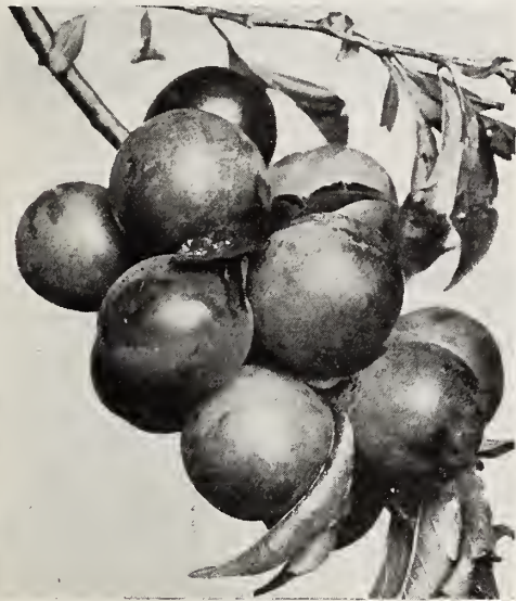
Red June Plums