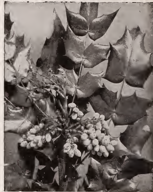
Mahonia or Hollygrape

PITTIOSPORUM, TOBIRA. A popular shrub for Southern planting. Compact habit of growth, dark green leaves clustered at the ends of the branches. Yellowish-white flowers in early Spring. Valuable for foundation planting. Price, $1.25 each. PYRACANTHA LALANDI. Dwarf growing shrub, slender branches. Foliage dark green, white flowers borne in clusters followed by orange colored berries. Price, $1.25 each.