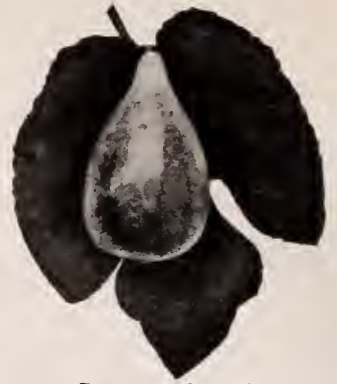
Brown Turkey Fig

4 to 5 feet, 60c each; $5.00 per 10. HICKS. Most popular of all. Fruit black, sweet and well flavored.