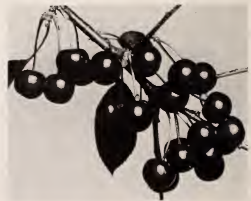
Early Richmond Cherries

3 to 5 feet, 50c each; $4.50 per 10. 2 to 3 feet, 40c each; $3.50 per 10; $30.00 per 100. GOVERNOR WOOD (Sweet). Medium size, pale yellow with pink flush. EARLY RICHMOND (Sour). Medium size, bright red. Ripens last of May. LARGE MONTMORENCY (Sour). Larger than Early Richmond and ripens about ten days later. Bright red. BLACK TARTARIAN (Sweet). Fruit large, black, heart-shaped.