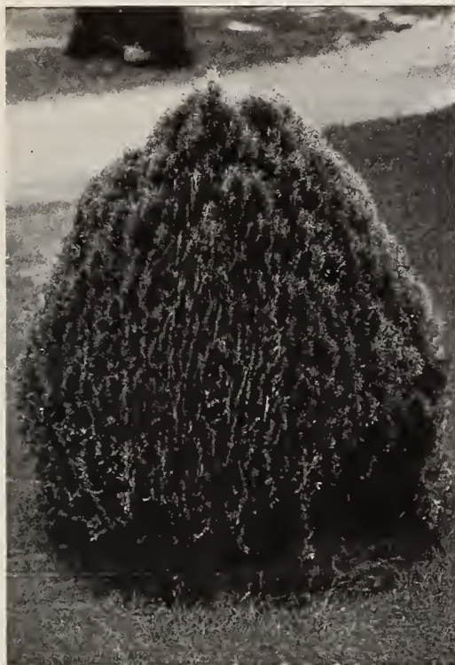
Dwarf Golden Arbor-Vitae