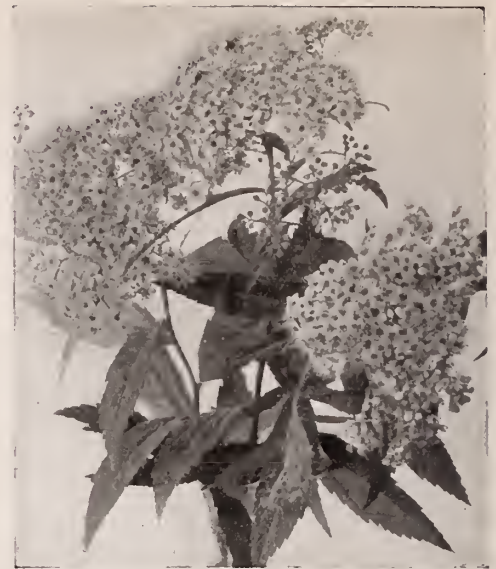
Spirea A. W.