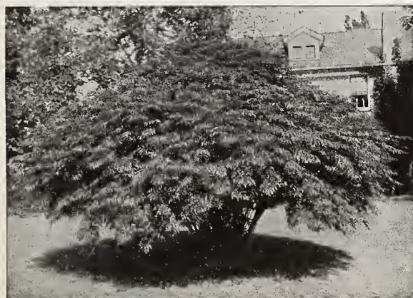
Texas Umbrella Tree

WEeping MULBERRY. Small tree of drooping habit of growth. Long, graceful branches curving to the ground. Fine for specimen planting. Price, Two-year heads, $1.75 each.