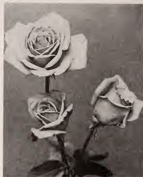
Pink Radiance Roses

REV. F. PAGE ROBERTS. Large, glorious rose of golden yellow stained outside with red; extra long buds of copper-red. SUNBURST. Beautiful orange-copper shaded to deepest golden; good bloomer. ETOILE DE FRANCE. Large, brilliant velvety, clear dark red; center vivid cerise. FRANCIS SCOTT KEY. Large, full, deep red, well formed, handsome variety. GENERAL JACQUEMINOT. Large, shapely buds of velvety appearance, shining crimson. GRUSS AN TEPLITZ. Bright crimson with fiery red center; semi-double. HADLEY. Deep, velvety crimson, double, fragrant. HIS MAJESTY. Dark crimson, shaded deep vermilion towards edge, large. NATIONAL EMBLEM. Deep crimson, overlaid with velvety crimson; full, double. RED RADIANCE. Bright, clear shade of pure red; excellent bloomer. SENSATION. Long pointed bud, flower very double; scarlet-crimson deepened overall by glossy maroon. Fragrant flowers in profusion. ANTOINE RIVOIRE. Full and double in flower, creamy white, delicately flushed pink.