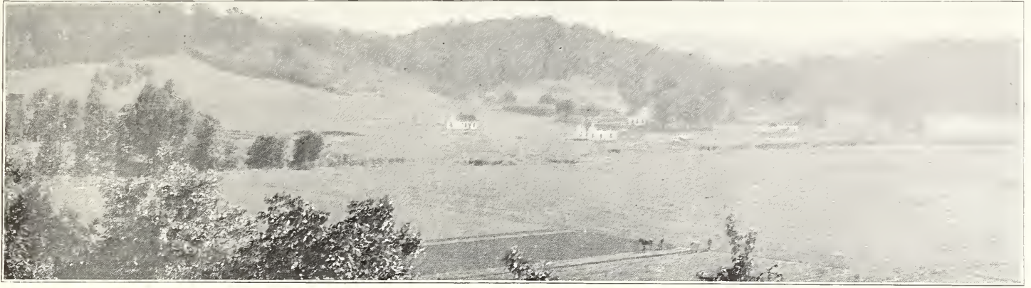
Two views of Dutch Creek Valley (The Nile of America's Egypt) and Thomasville where the world's famous fruit producing Strawberry Plants are grown