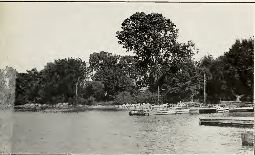
THE SITE OF THE PERRY MEMORIAL.

missioner Nelson A. Miles and First Vice-President-General Henry Watterson, with the Secretary-General of the Inter-State Board as Secretary.