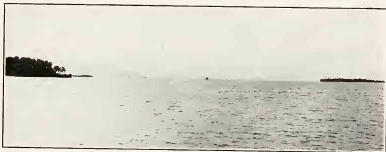
Looking toward the Scene of the Battle of Lake Erie from the Site of the Perry Memorial.

The brief but glorious story of the conflict that ensued is known to every schoolboy. The Americans had the advantage in the number of their vessels; the British, in the number and carrying power of their guns and a slight numerical superiority of seamen and officers. The "Lawrence," Perry's flagship, was soon put out of commission by the long range fire of the enemy, leaving only 18 out of her 101 officers and men not dead or disabled. From this bloody wreck the dauntless Perry removed his flag, in a small boat under heavy fire, to the "Niagara"—the most perilous half-mile dash in the history of naval warfare. Bringing all his remaining fleet in action, the young American commander passed through the line of the enemy with successive broadsides at short range, and in the brief space of thirty minutes compelled the surrender of his entire force.