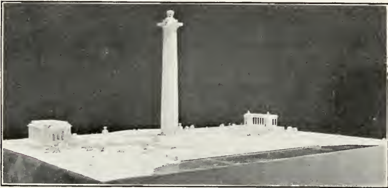
Photograph from a Model of the Perry Memorial by Menconi Brothers of New York.

The centennial fleet, escorting the restored "Niagara," will visit in rotation all the ports of the Great Lakes joining in the series of celebrations during the summer of 1913. The same marine pageants and the same military ceremonies may be produced in each city, accompanied by such local ceremonies and additional attractions as may be determined upon by the different communities. In this manner, where one city for a single celebration might raise a fund of $50,000 or $100,000 for the objects in view, each city uniting with its sister city, as is here indicated, would have the benefit of the spectacles presented by an organization representing an investment of from $200,000 to $400,000.