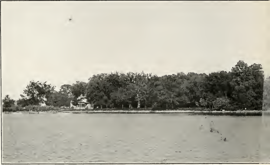
PUT-IN-BAY HARBOR SHORE LINE OF

including 1912, were as follows: Ohio, $83,000; Pennsylvania, $75,000; Wisconsin, $50,000; Rhode Island, $25,000; and Kentucky, $25,000, making a total available from all sources of $508,000.