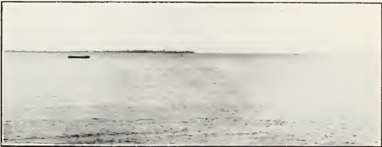
Lake Erie from the Site of the Perry Memorial.

A second consideration, pointing to a centennial observance educational and fraternal in the broadest sense, presented itself in the conclusion of the century of peace between English-speaking peoples that would be practically contemporaneous with the one hundredth anniversary of Perry's Victory; and from the inception of the centennial enterprise the opportunity of a union of British and American interests in the deepest significance of the proposed celebration, and in the dedication of a fitting permanent memorial, has been regarded by the commissioners of the participating states as the most appropriate and desirable object to be achieved by them in connection with the general project.