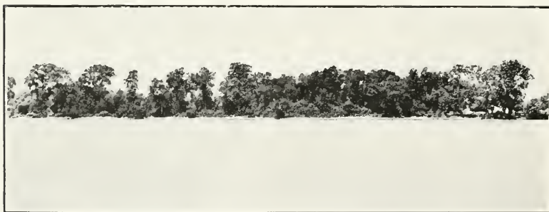
Lake Erie Shore Line of the Site of the Perry Memorial.

The military aspect of the celebration, from an historical standpoint, will take due cognizance of General Harrison's march through Ohio to the Lakes, his encampment on the present site of Fremont, his embarkation on board Perry's fleet, his sojourn at Put-in-Bay, his entrance into Michigan, his liberation of Detroit and his invasion of Canada, culminating in the crowning success of his campaign at the Battle of the Thames. The present physical boundaries of all the states bordering on the Great Lakes