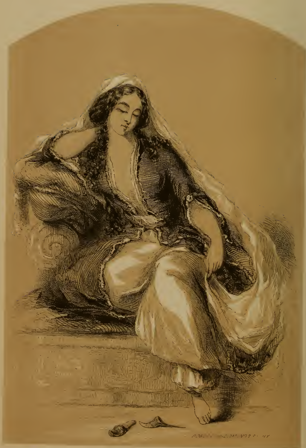
CIRCASSIAN LADY IN ARMENIAN COSTUME