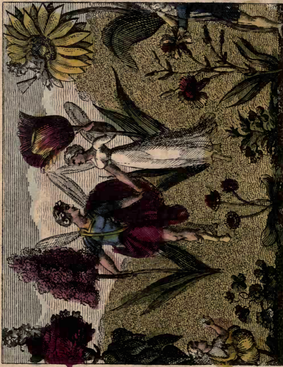
"A Hyacinth, grac'd with an elegant stalk," p. 13.