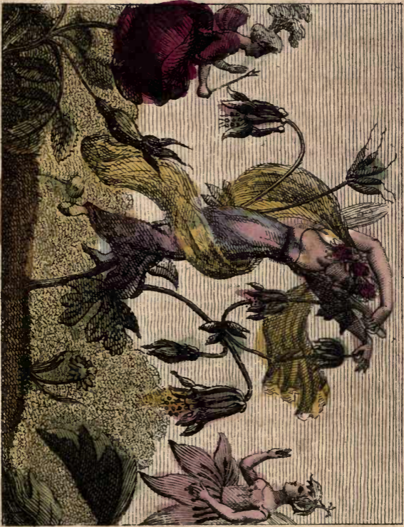
"A Hornpipe, sweet Columbine, danc'd in the air." p. 14.