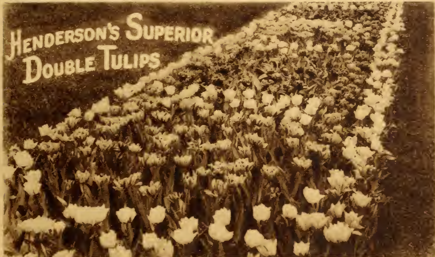
HENDERSON'S SUPERIOR DOUBLE BEDDING TULIPS

Six Bulbs of a Variety at the Dozen Rate, 25 at the Hundred Rate.