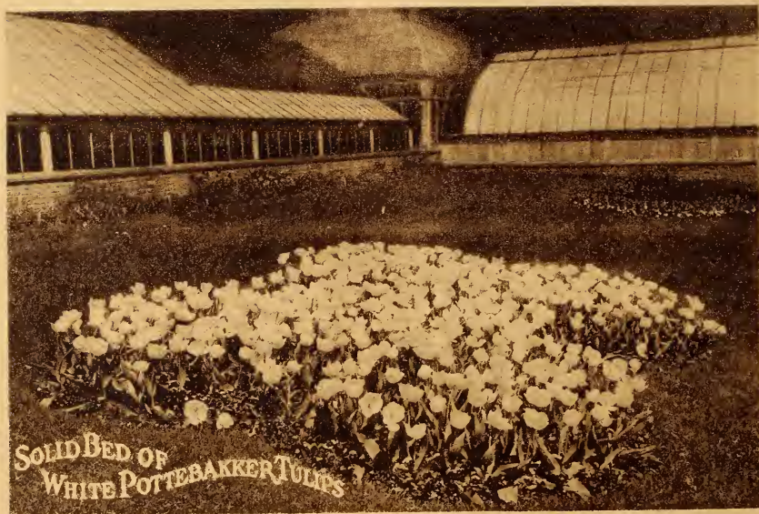
SOLID BED OF WHITE POTTEBAKKER TULIPS

We can supply individual bulbs of any of the sorts described below at one-tenth of the dozen price.