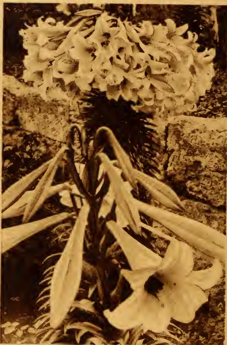
BERMUDA EASTER LILY

Yellow Calla, Elliotiana. ( Ready in November. ) The yellow Calla; large rich, deep golden flowers often 4 to 5 inches across at the mouth; habit of growth and foliage like the old favorite white Calla excepting the leaves of Elliotiana are spotted with white. Dry bulbs, 40c. ea., $4.00 per doz.