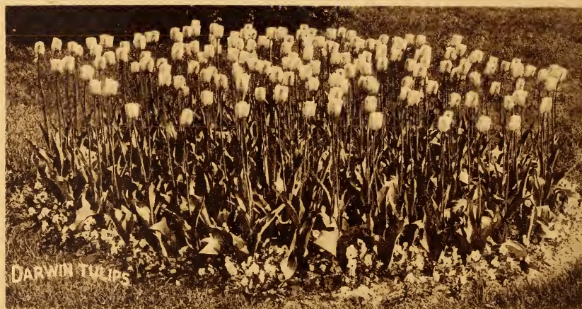
DARWIN TULIPS—ARISTOCRATS OF TULIPDOM

GARDENERS OF EXPERIENCE know that success—even with seeds and bulbs of such high quality as HENDERSON'S—depends largely on weather conditions and proper cultivation, so in accordance with the universal custom of the seed trade PETER HENDERSON & CO. gives no warranty, express or implied, as to description, quality, productiveness, or any other matter of any Seeds, Bulbs, Roots or Plants they send out, and they will not be in any way responsible for the crop.