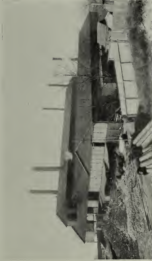
LONDON ROLLING MILLS