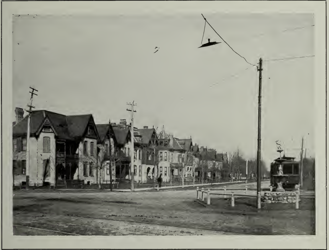
CENTRAL AVENUE, LOOKING EAST