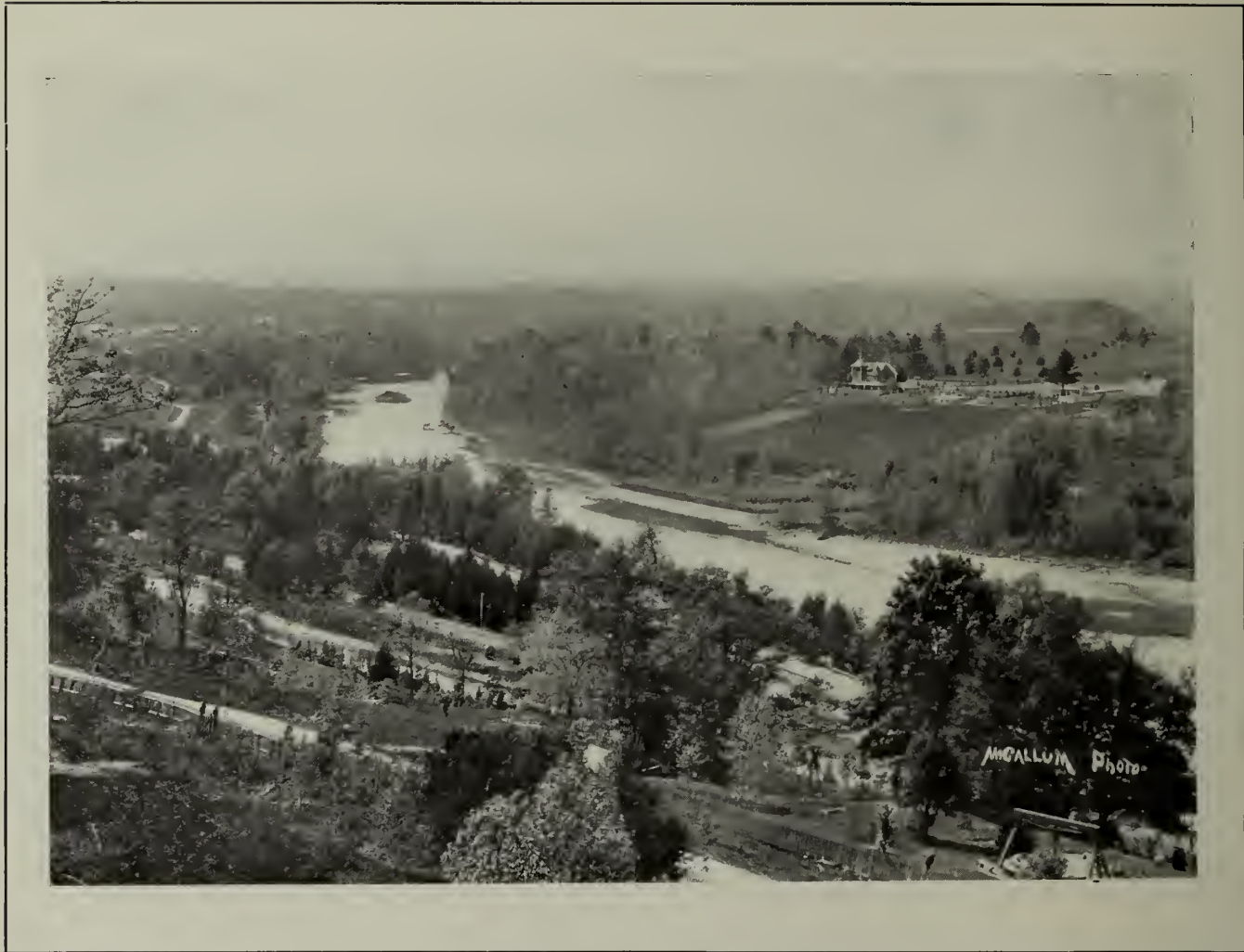
RIVER THAMES AND SPRINGBANK PARK