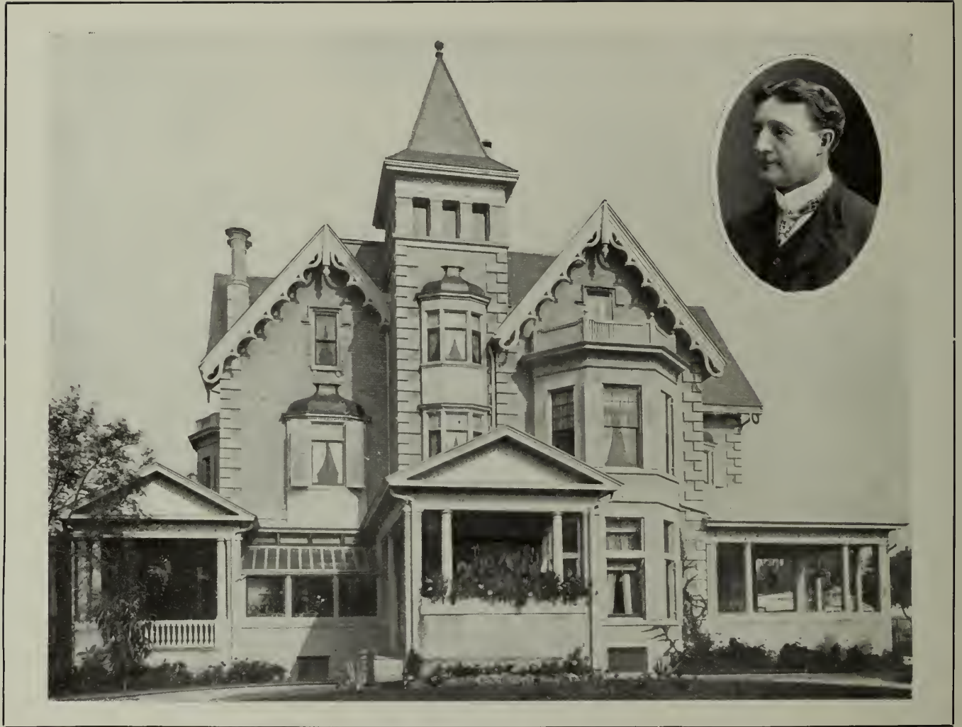
RESIDENCE OF HON. ADAM BECK