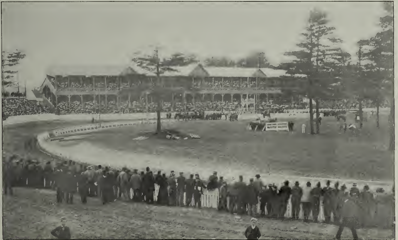
A VIEW OF THE GRAND STAND AND SPEEDING TRACK ONE OF THE DAYS OF THE WESTERN FAIR, LONDON

The first fair in London was held as early as 1833. In 1867 the idea of a Western Fair was first agitated. In 1881 Queen's Park was acquired and new buildings were constructed there to the amount of $70,000. The main building is 200 x 80 feet and cost about $25,000.