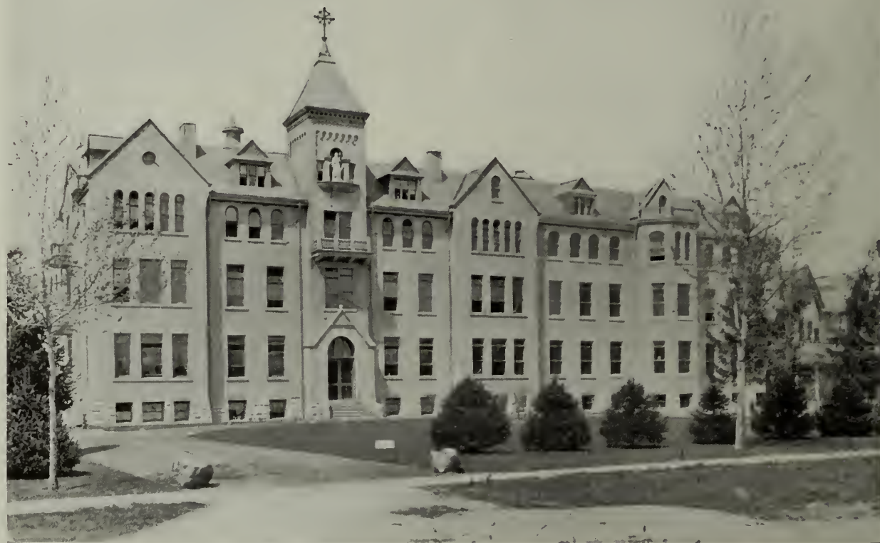
ST. JOSEPH HOSPITAL