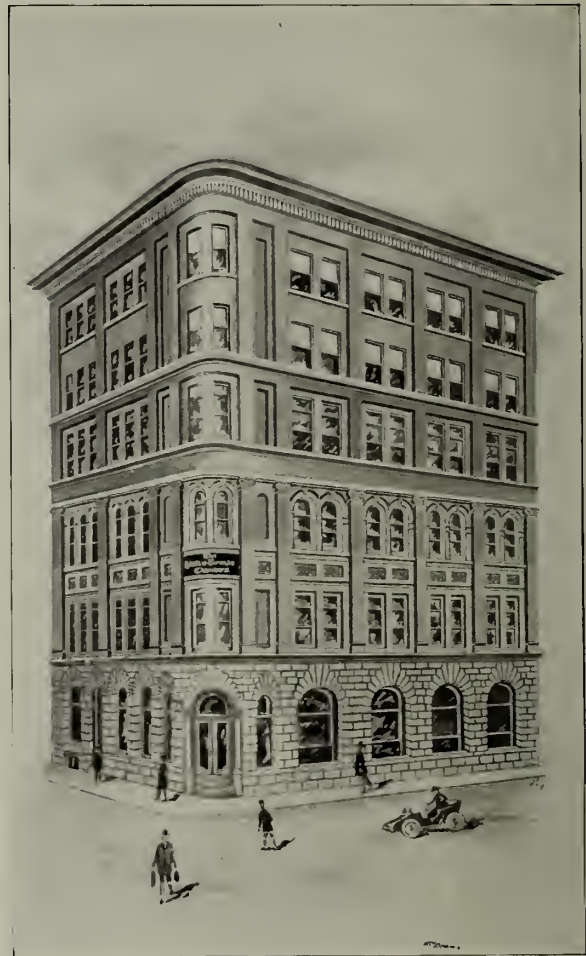
BANK OF TORONTO

St. Andrew's Church was opened in a frame building in 1843, being replaced in 1868 by the present structure. This edifice cost $30,000.