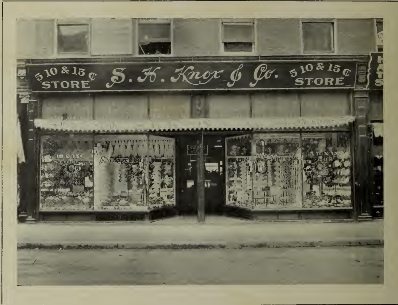
STORE OF S. H. KNOX & CO., LONDON

One of this enterprising syndicate's 69 stores located in the leading cities of the United States and Canada. A very popular resort.