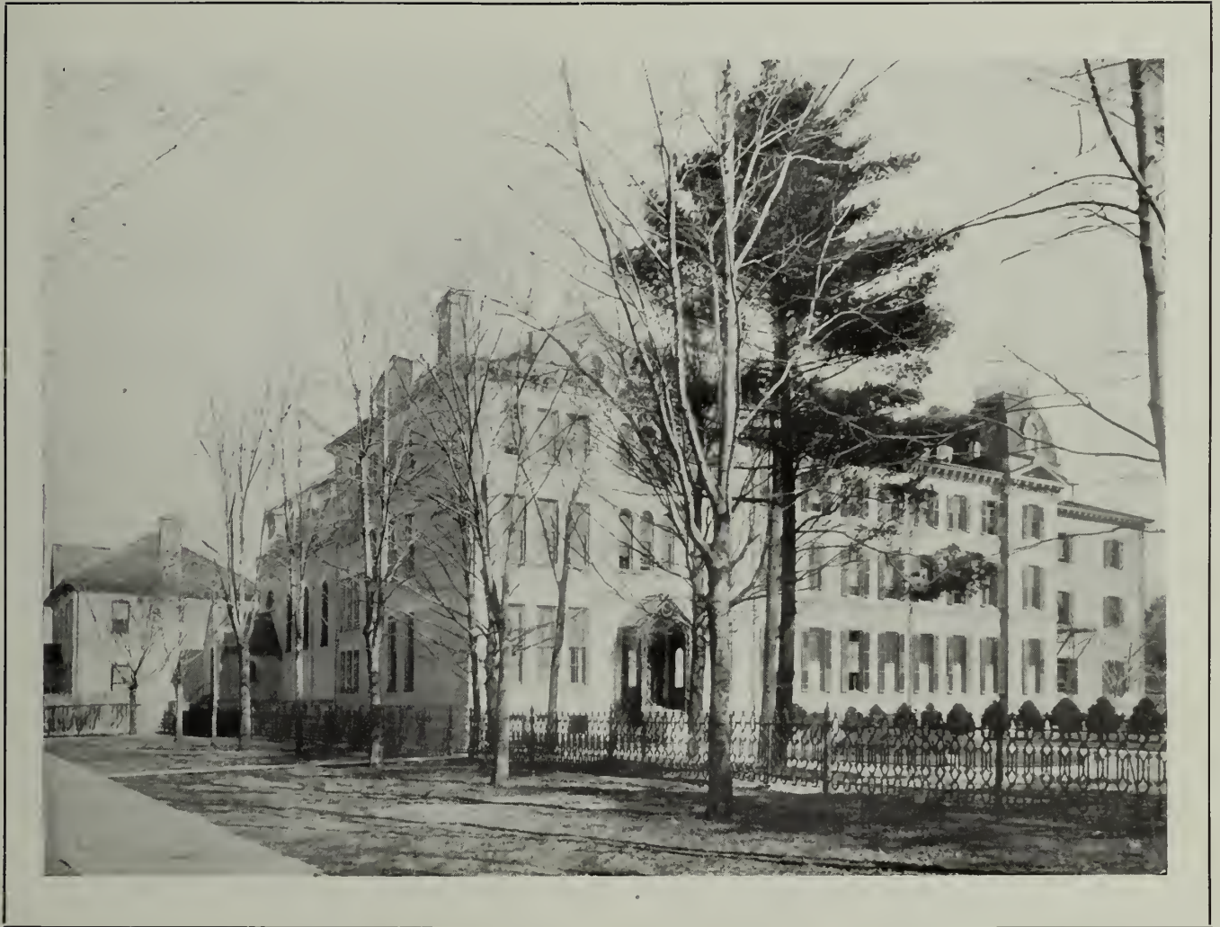
SACRED HEART CONVENT