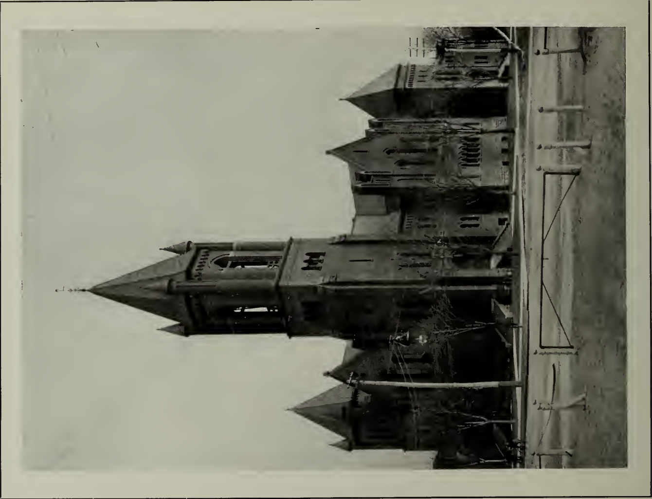
FIRST METHODIST CHURCH