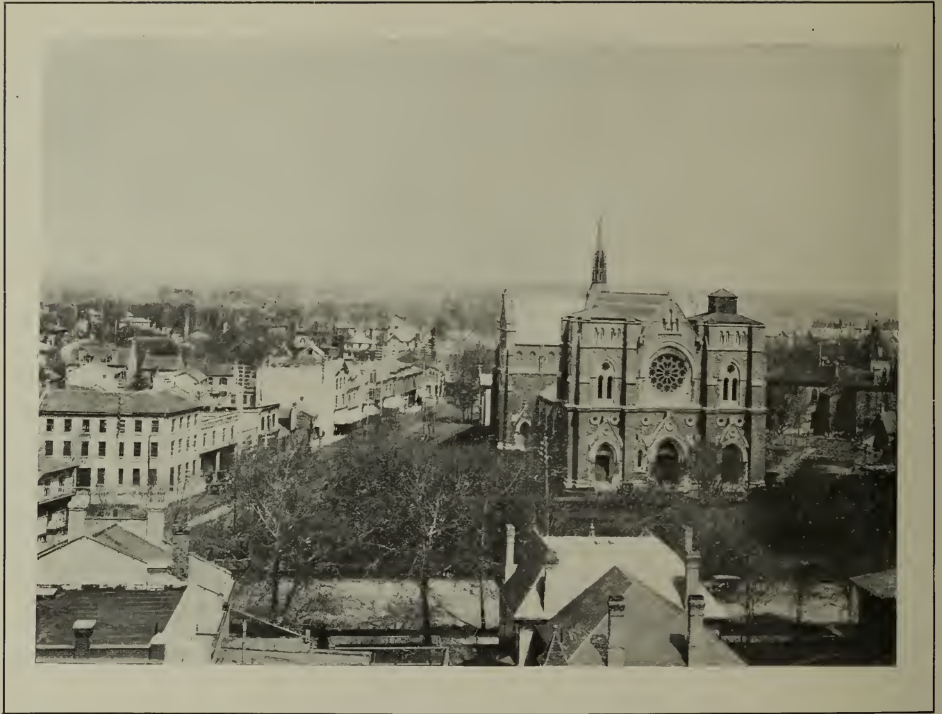
BIRD'S EYE VIEW OF LONDON FROM ST. PAUL'S CATHEDRAL