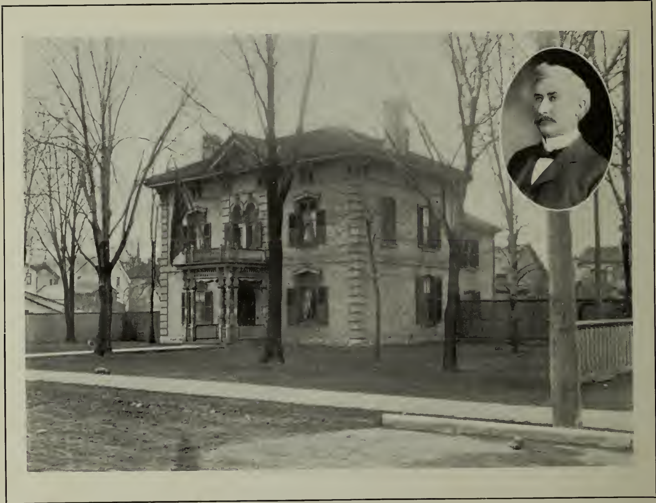
RESIDENCE OF COL. CULVER, U.S. CONSUL