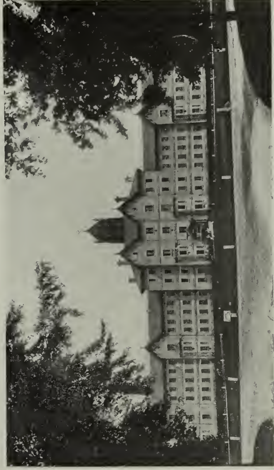
LONDON HOSPITAL, FOR THE INSANE

The Hospital for the Insane occupies 300 acres of land just east of the city. It has accommodation for some 1200 inmates.