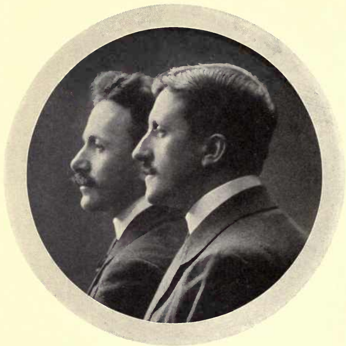
SERAFÍN AND JOAQUÍN ÁLVAREZ QUINTERO