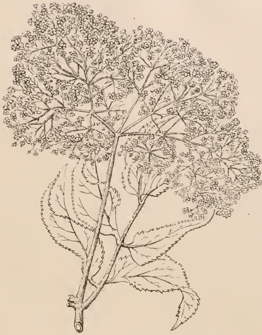
Sambucus glauca Nutt.