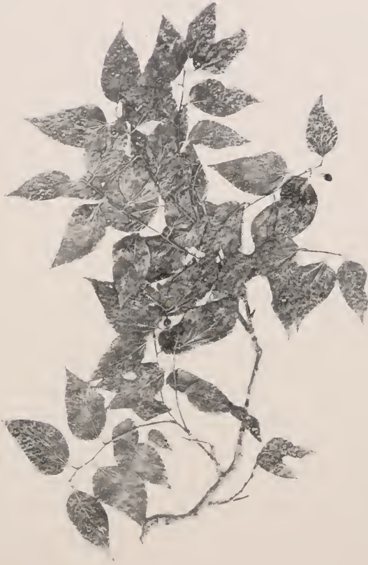
Celtis reticulata Torr.