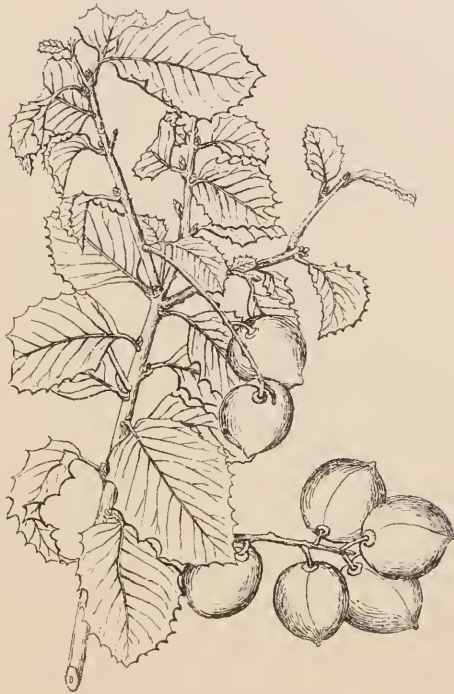
Cerasus ilicifolia Walp.