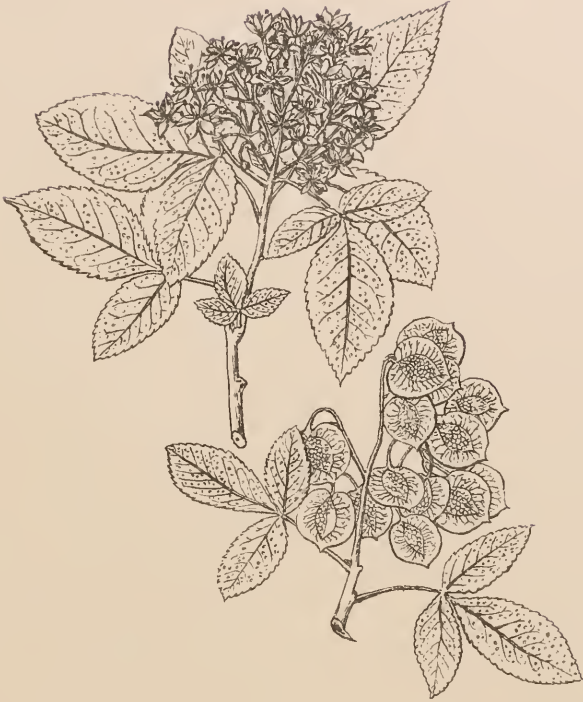
Ptelea crenulata Greene.