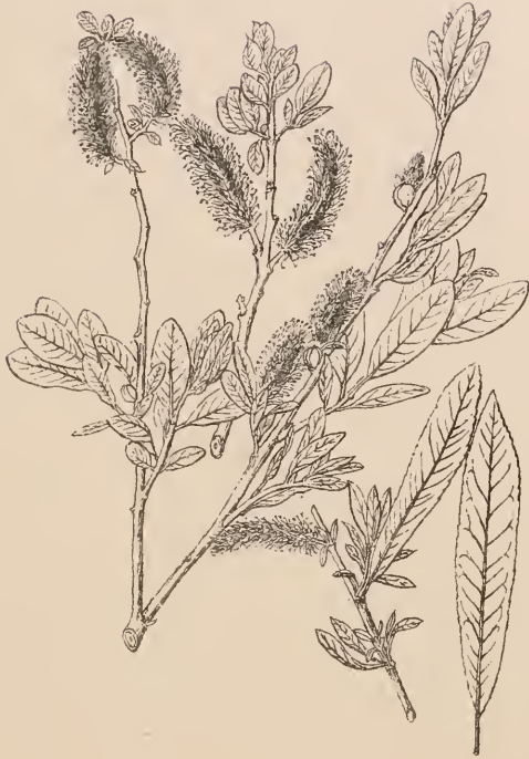
Salix lasiolepis Benth.