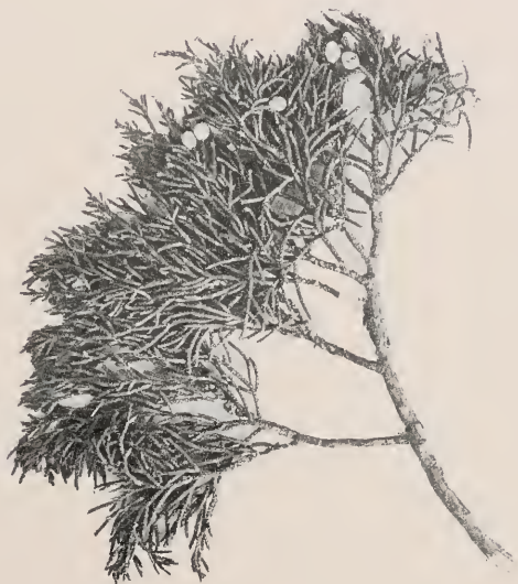
Juniperus occidentalis Hook.