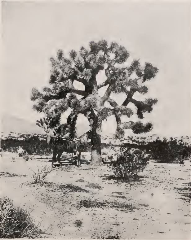
Cleistoyucca arborescens Trelease.

From Coville, United States Department of Agriculture.