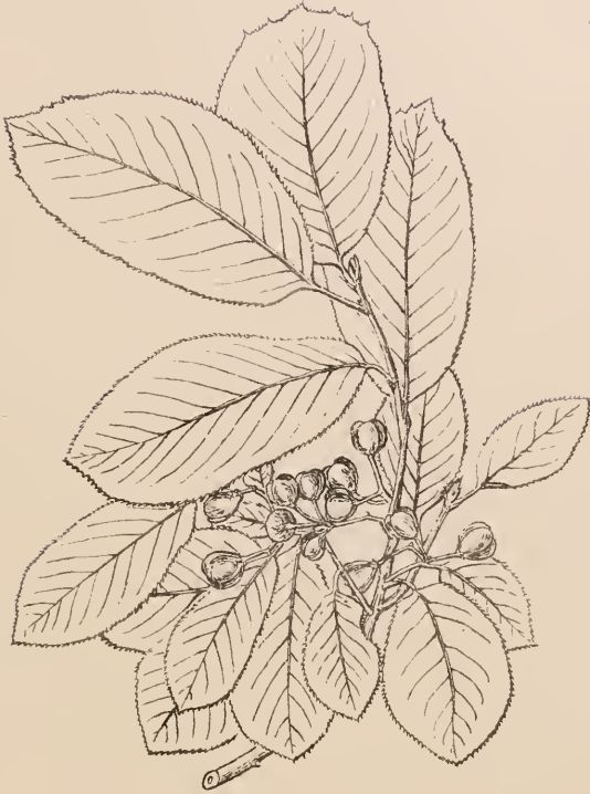
Rhamnus Purshiana DC.