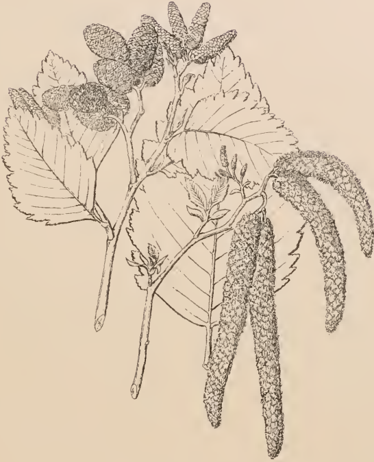
Alnus Oregona Nutt.