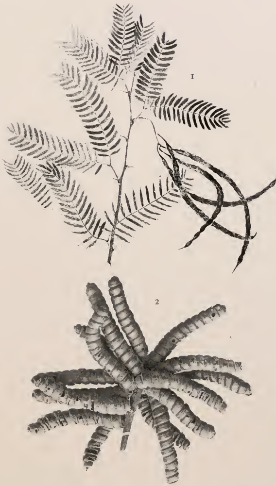
Fig. 1. Prosopis juliflora DC.