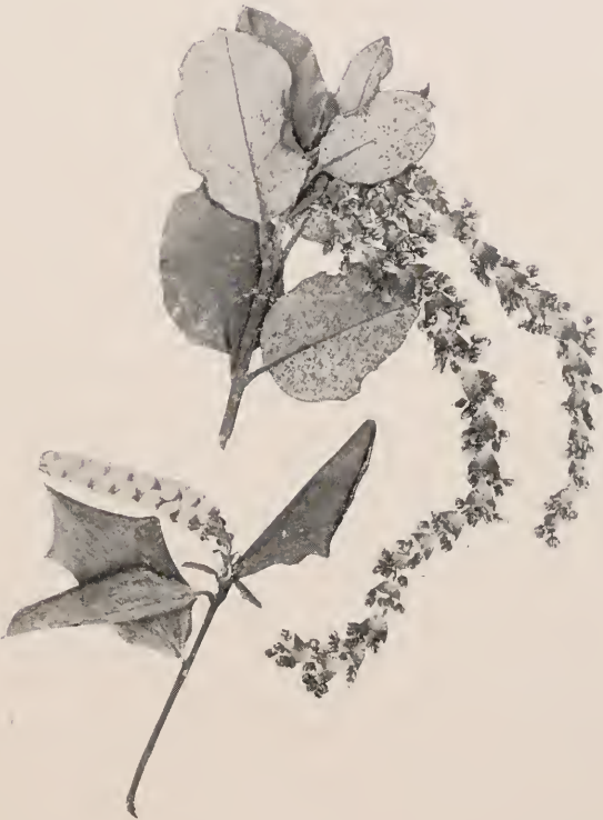
Garrya elliptica Dougl.