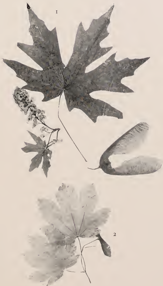
Fig. 1. Acer macrophyllum Pursh.