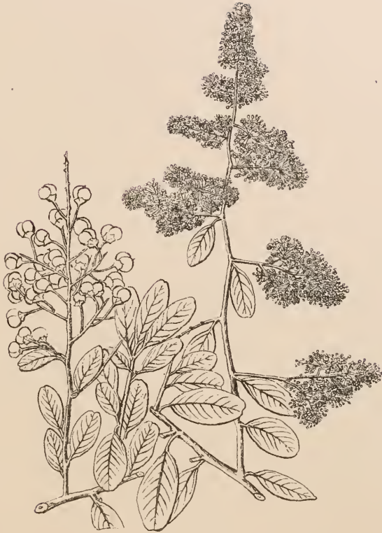
Ceanothus spinosus Nutt.