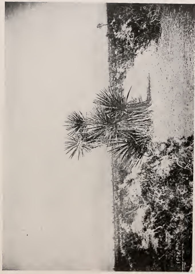
Yucca Mohavensis Sargent.

From Merriam, United States Department of Agriculture.