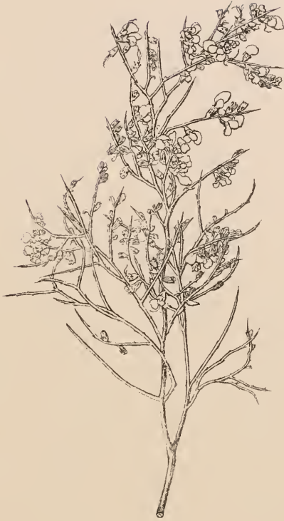
Dalea spinosa Gray.