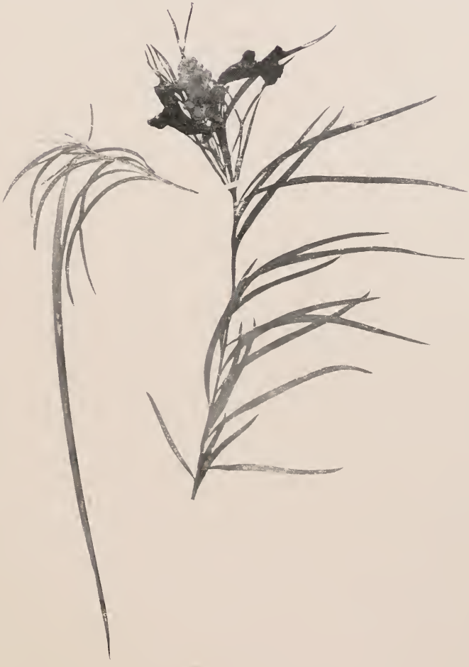
Chilopsis saligna Don.