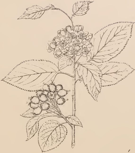
Malus rivularis Dec.