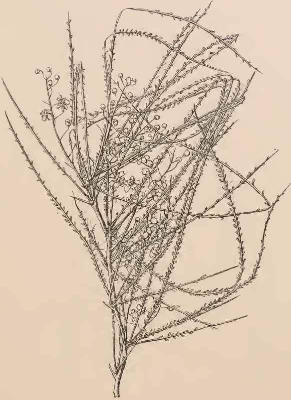
Parkinsonia aculeata L.