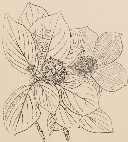
Cornus Nuttallii Aud.