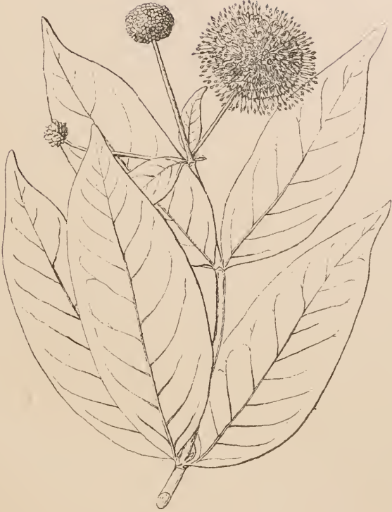
Cephalanthus occidentalis L.