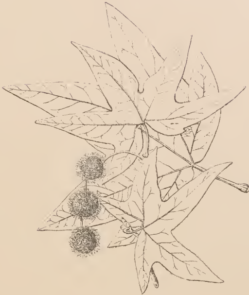
Platanus racemosa Nutt.