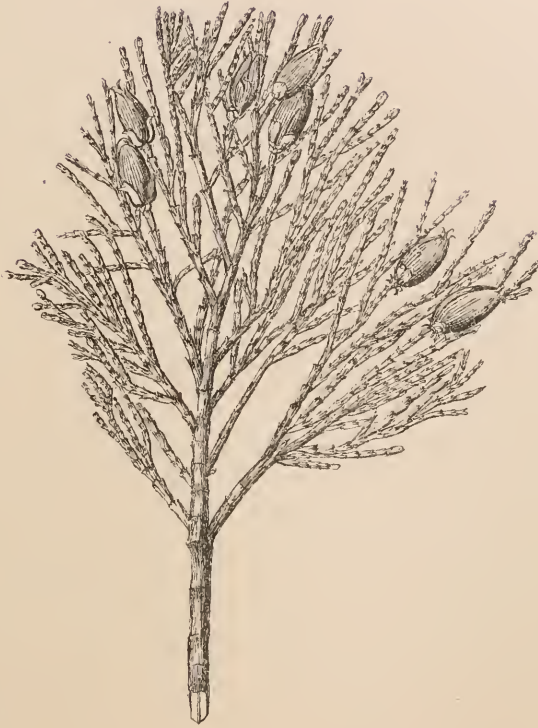
Libocedrus decurrens Torr.