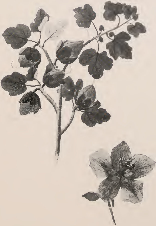
Fremontodendron Californica Coville.