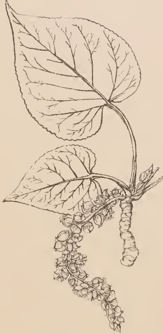
Populus trichocarpa Torr. & Gray.