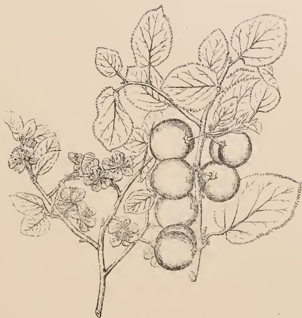
Prunus subcordata Benth.