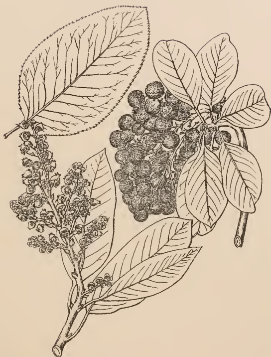
Arbutus Menziesii Pursh.