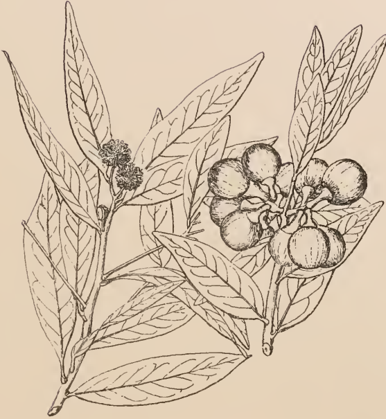
Umbellularia Californica Nutt.