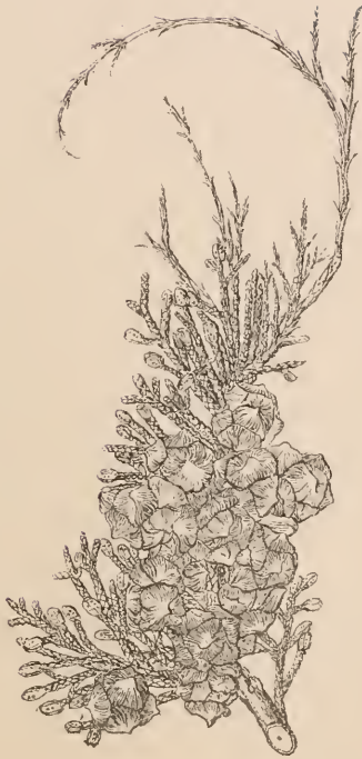
Cupressus Goveniana Gordon.