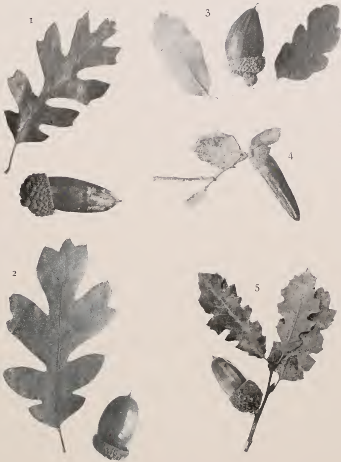
Fig. 1. Quercus lobata Neé. Fig. 2. Quercus Garryana Dougl. Fig. 3. Quercus Douglasii H. & A. Fig. 4. Quercus Atwoodiana Eastwood. Fig. 5. Quercus MacDonaldi Greene.