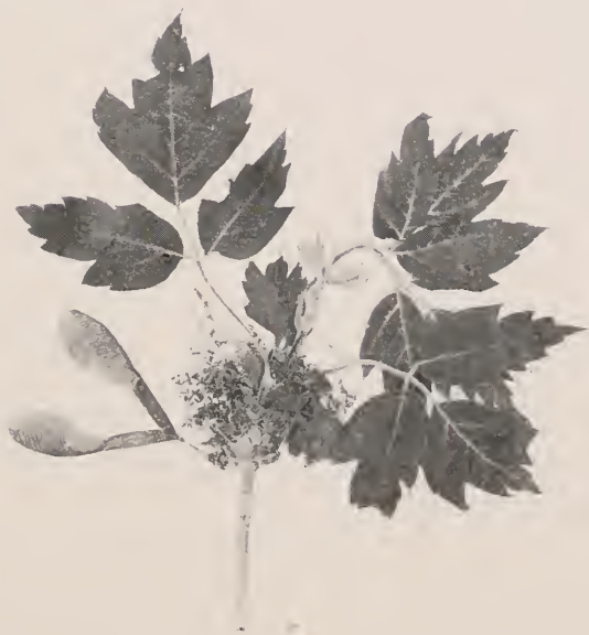
Acer Negundo Californicum Sargent.