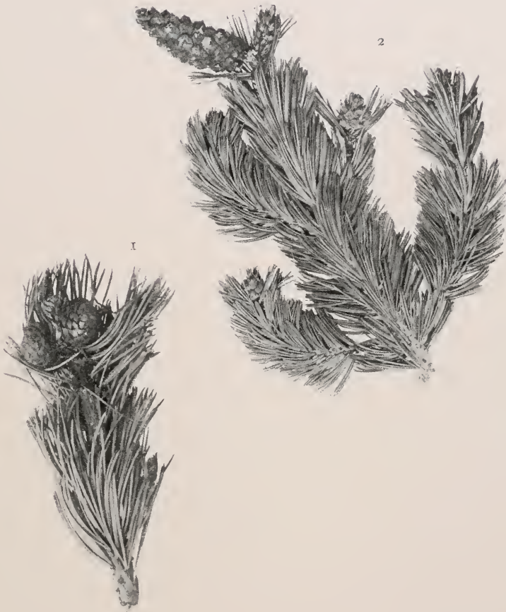
Fig. 1. Pinus albicanlis Engelm.