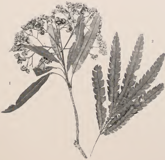
Fig. 1. Lyonothamnus floribundus Gray.