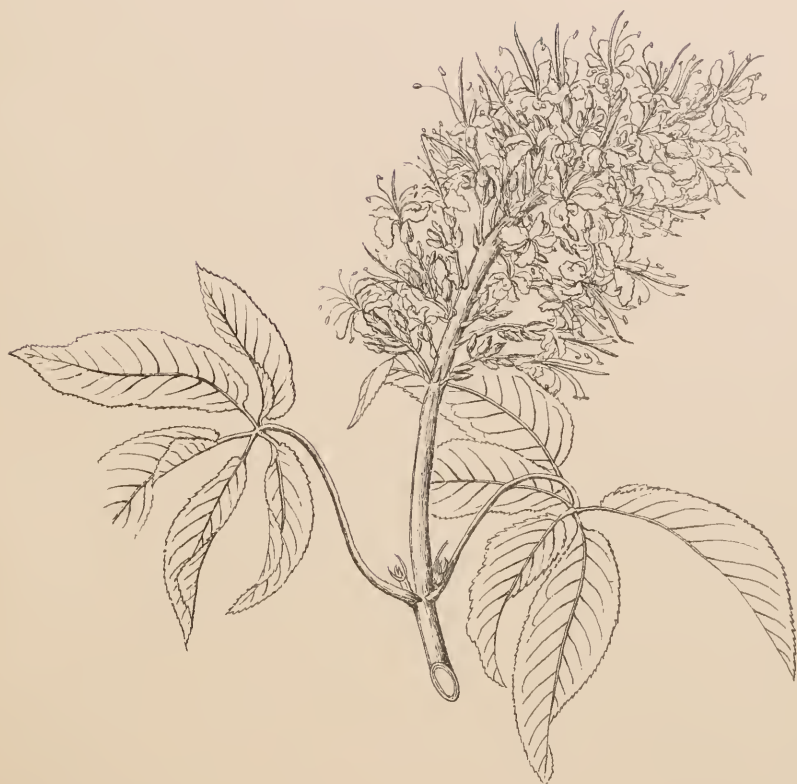
Esclus Californica Nutt.