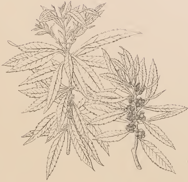
Myrica Californica Cham.