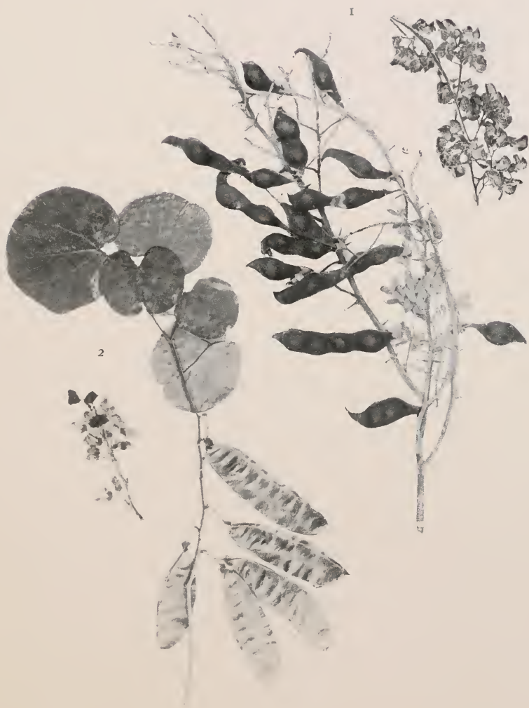
Fig. 1. Olneya Tesota Gray.