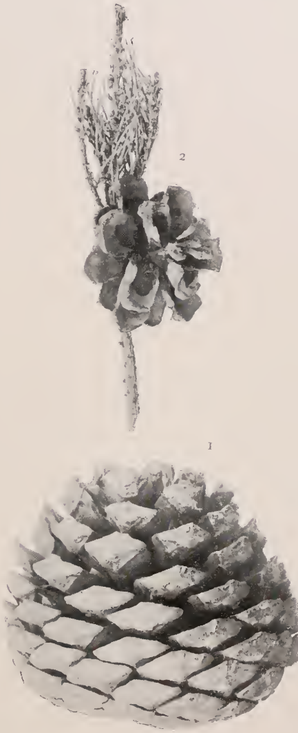
Fig. 1. Pinus Torreyana Parry.