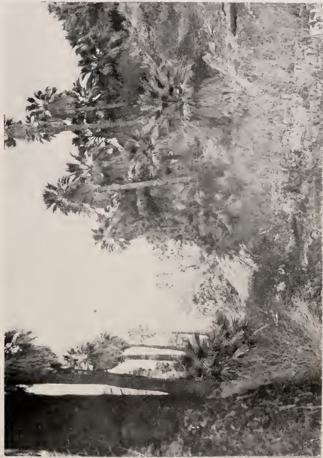
Washingtonia filamentosa O. K.