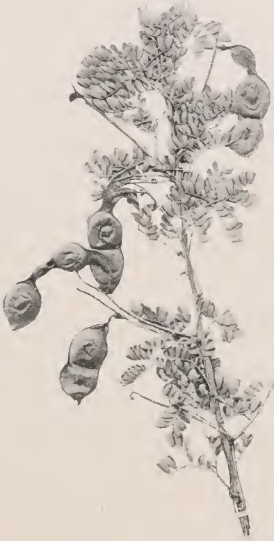
Acacia Greggii Gray.