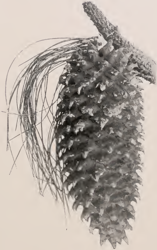
Pinus Coulteri Don.