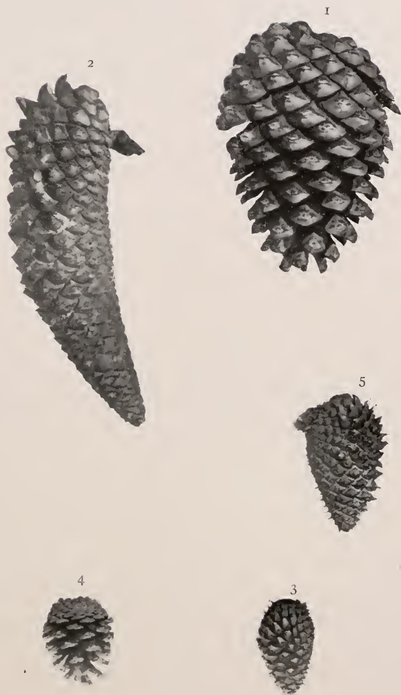
Fig. 1. Pinus radiata Don. Fig. 2. Pinus attenuata Lemmon. Fig. 3. Pinus contorta Dougl. Fig. 4. Pinus Murrayana Murr. Fig. 5. Pinus muricata Don.