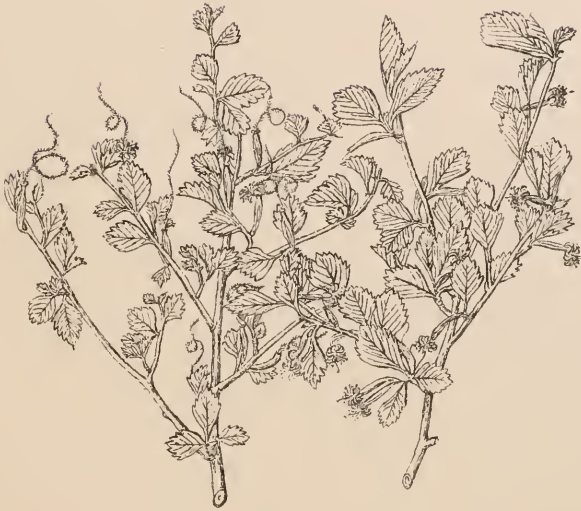
Cercocarpus betulaeifolius Hook.