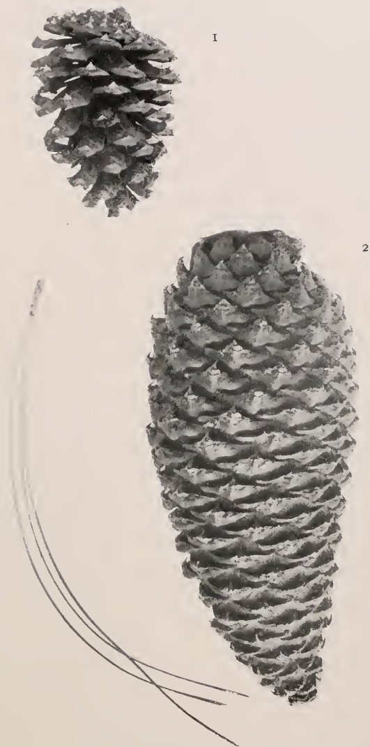
Fig. 1. Pinus ponderosa Dougl.