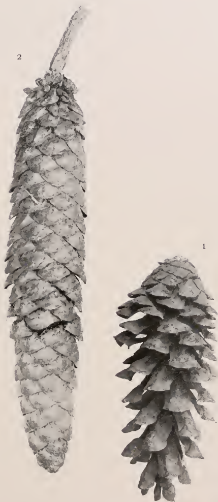
Fig. 1. Pinus monticola Dougl.