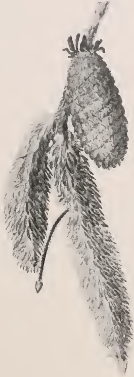
Picea Sitchensis Carr.