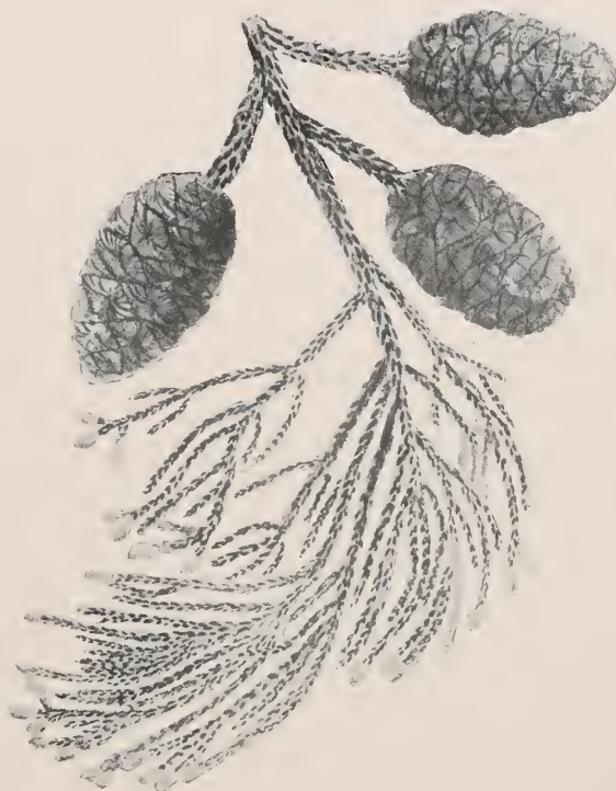
Sequoia gigantea Dec.