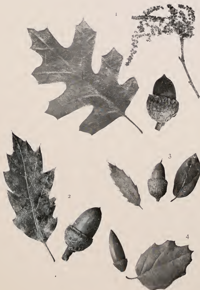
Fig. 1. Quercus Californica Cooper.