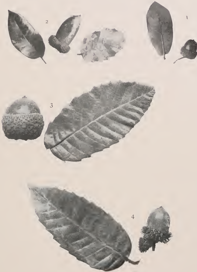
Fig. 1. Quercus Engelmanni Greene.