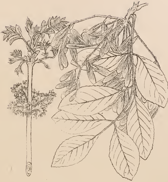
Fraxinus Oregona Nutt.