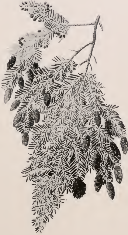
Tsuga heterophylla Sargent.