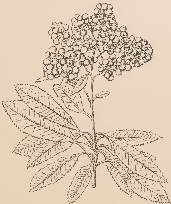
Heliosmela arbutifolia Roem.