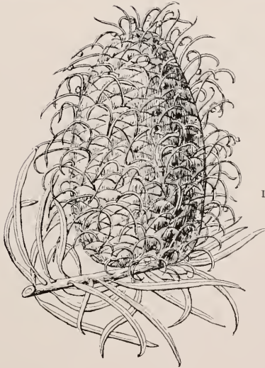
Fig. 1. Abies venusta Sargent.