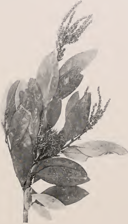
Castanopsis chrysophylla A. DC.