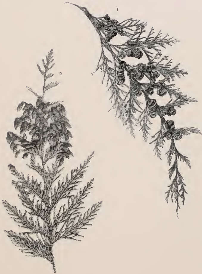
Fig. 1. Chamcecypris Lawsoniana Parlatt.