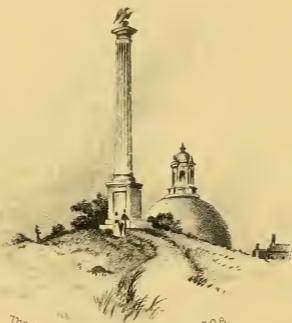
The Summit of Beacon Hill, 1808.

PUBLISHED BY Small Maynard & Company 6 Beacon Street BOSTON