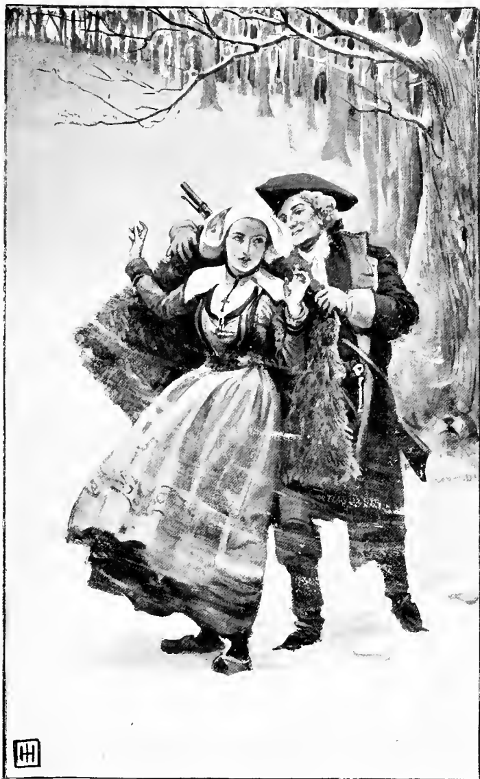
"Wrapped it round her shoulders." (Page 12.)