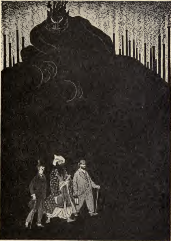
HOW ALI CAME TO THE BLACK COUNTRY