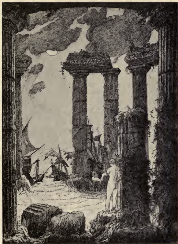
THE SECRET OF THE SEA