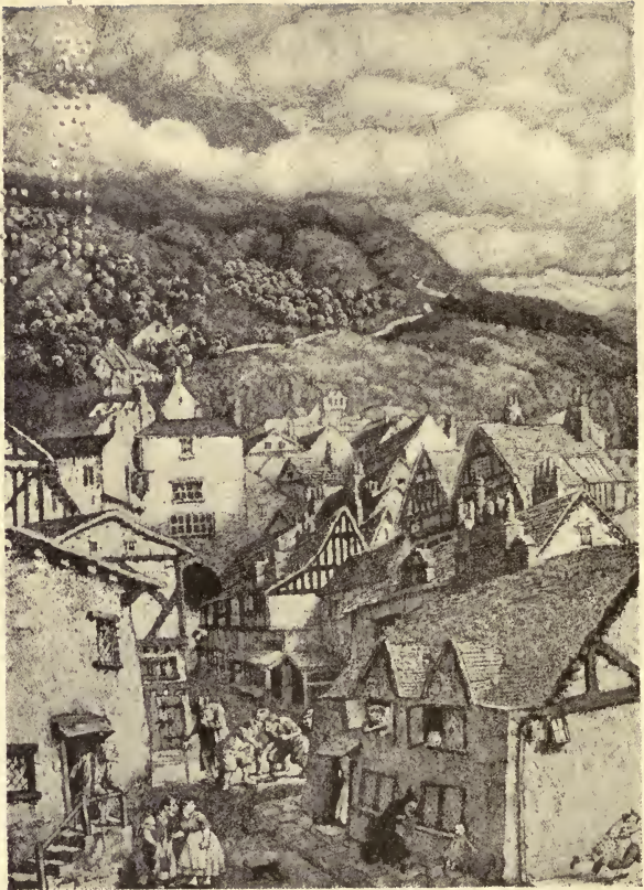
THE BAD OLD WOMAN IN BLACK