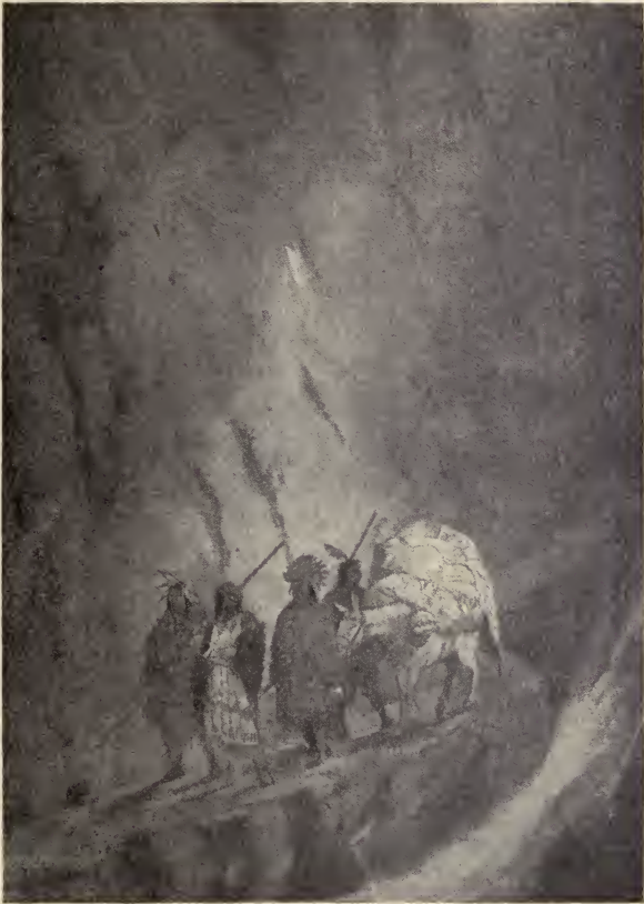
THE LOOT OF LOMA