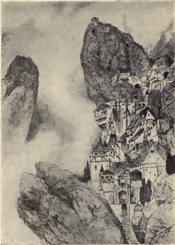
THE LONG PORTER'S TALE