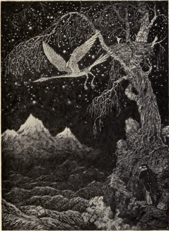
THE BIRD OF THE DIFFICULT EYE