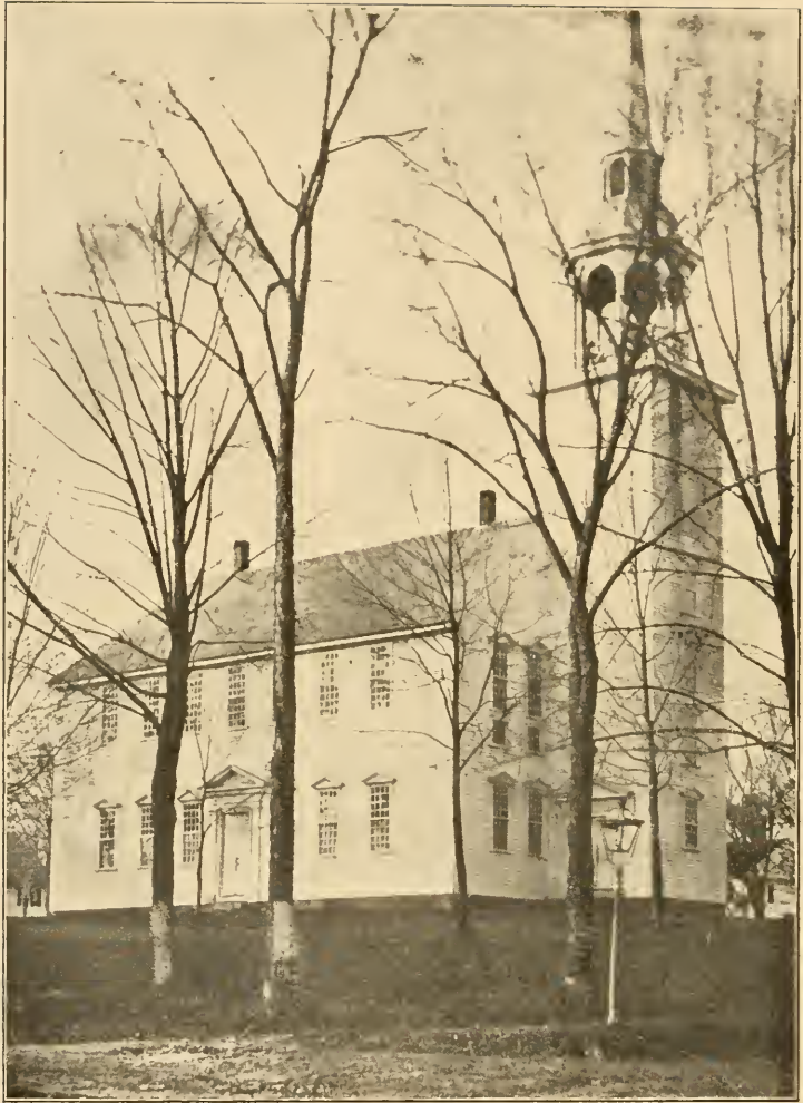
As our remodeled old First Meeting House looked when our forefathers first met to protest against their many foreign grievances, and from which, with the blessing of God and their aged pastor, they finally went courageously forth to battle for the liberties of a free people and the founding of a nation.