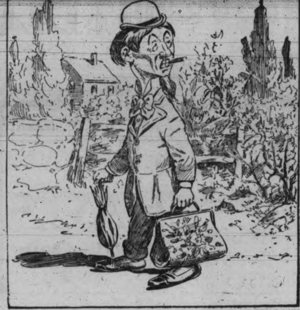
"WONDER WHAT THEM TWO YAPS IS A LAFFEN AT? GUESS THEY NEVER SEEN A REAL DUDE AFORE." CAN YOU SEE THEM?

In yesterday's puzzle, by using the upper part of the picture as base, the Fre-Count can be found in the lower left corner, his moustache and beard formed by black feather on the lady's hat.