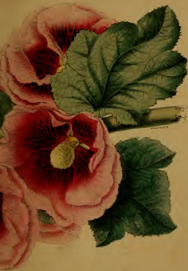
Published by Houlston & Stoneman Paternoster Row Dec. 2. 1844