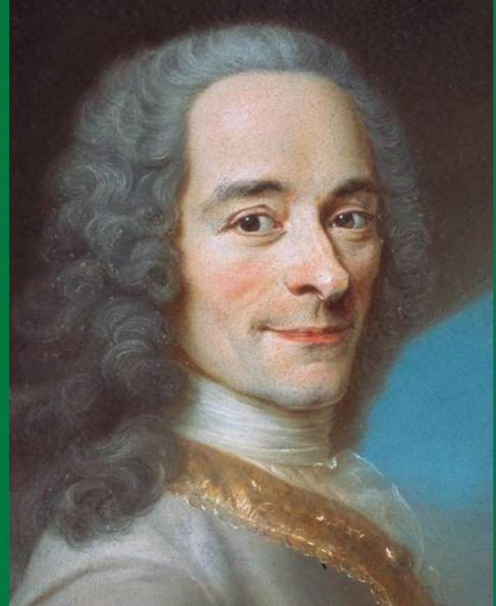
Portrait of Voltaire , After Maurice Quentin de La Tour [Public domain] Via Wikimedia Commons.