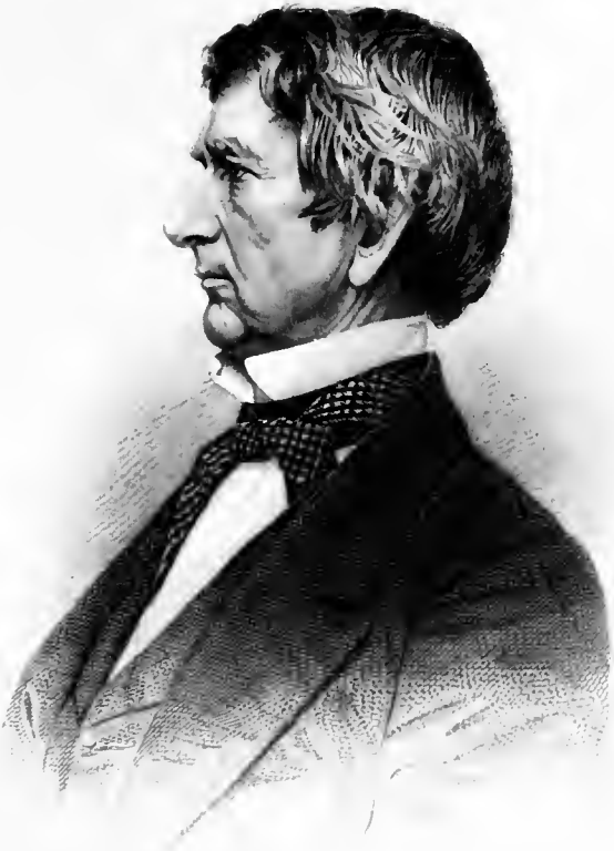
William L. Garrison