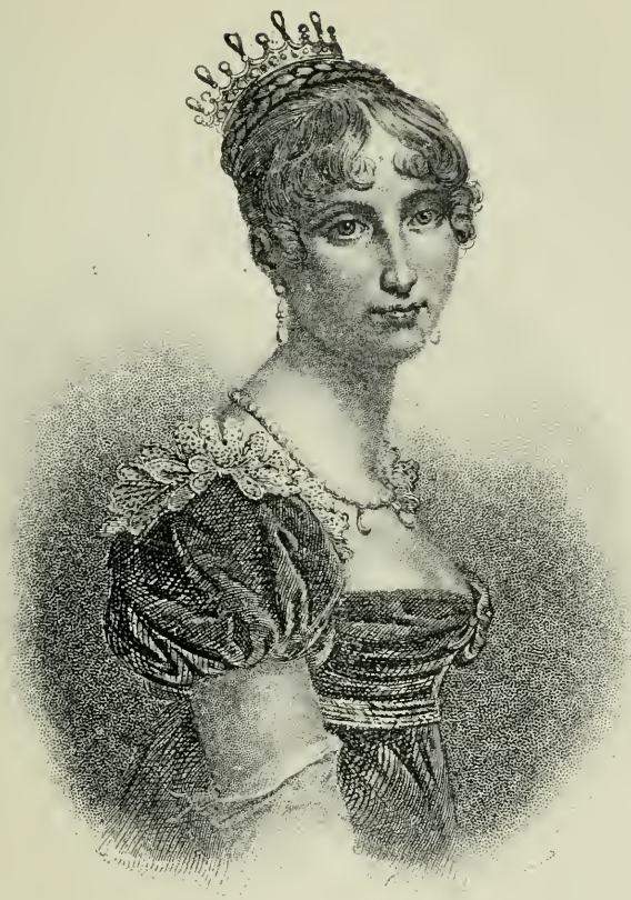
HORTENSE BEAUHARNAIS. QUEEN OF HOLLAND