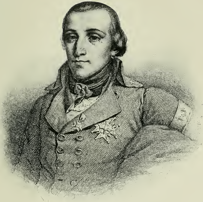
HENRI DE BOURBON ( DUC D'ENCHIEN )