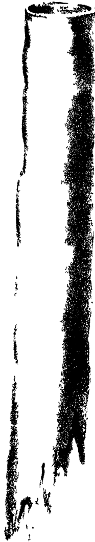
Fig. Similit. of the morbid Gummy adhesion or Lining lined in the Oesophagus or guttlet descended from Mr. Mead's Stomach after more than twelv e month use of the Vegetable Universal Medicine. All those labouring under Palpitation, Lightness of the Chest, Diseases of the Heart, and Cholic Indigestion have something similar in these parts