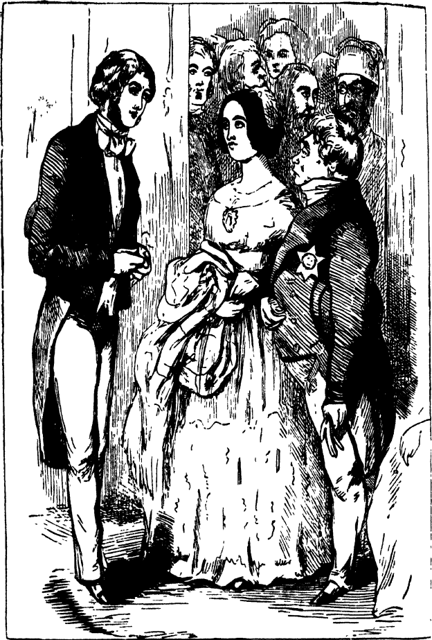
ARTHUR MEETS WITH AN OLD ACQUAINTANCE.