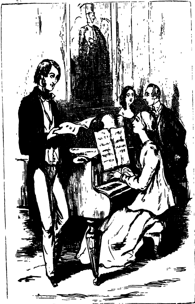
MR. PEN BEGINS TO BE CONSOLED.