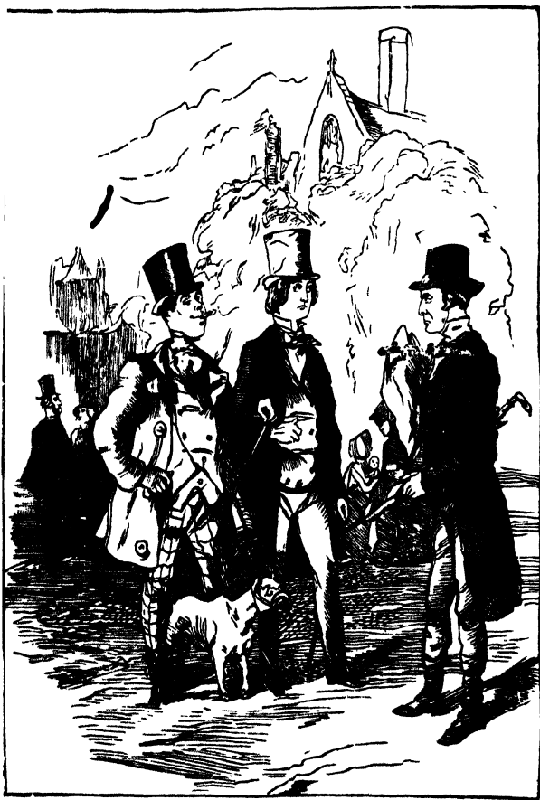
YOUTH BETWEEN PLEASURE AND DUTY.