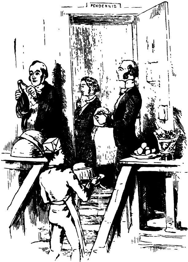
A LITTLE DINNER