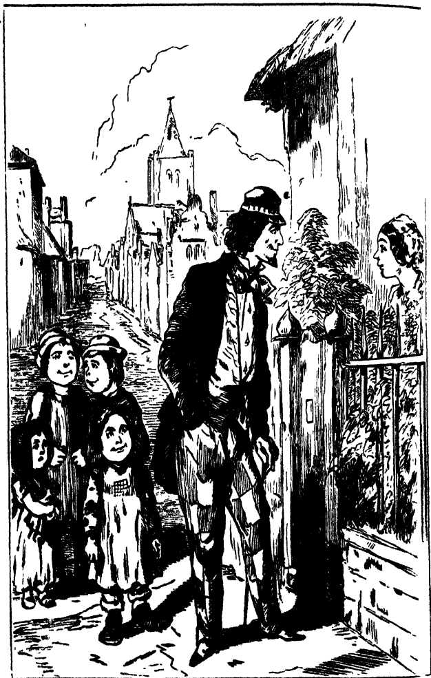
MIRIBOLANT FASCINATES THE NATIVES.