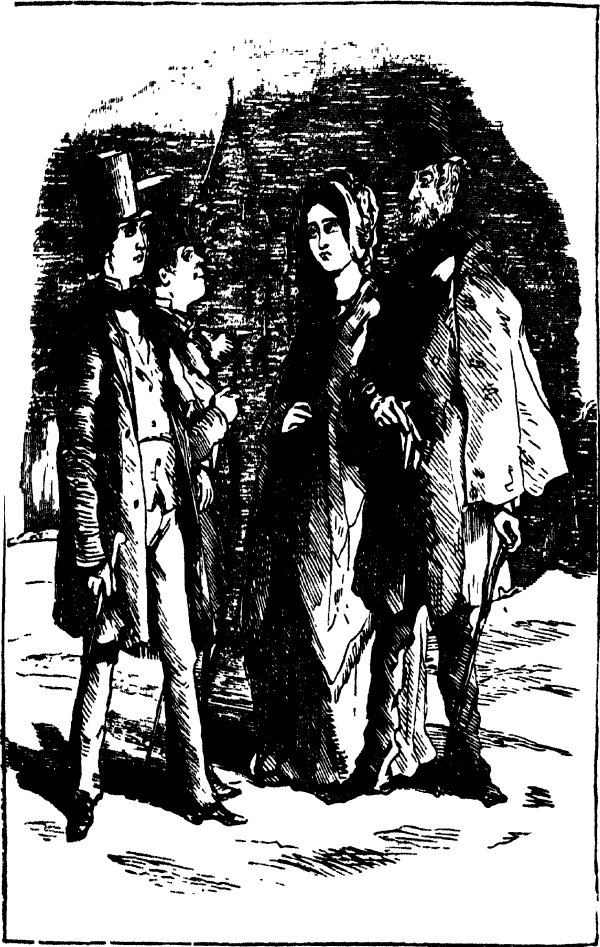
A CUT DIRECT.