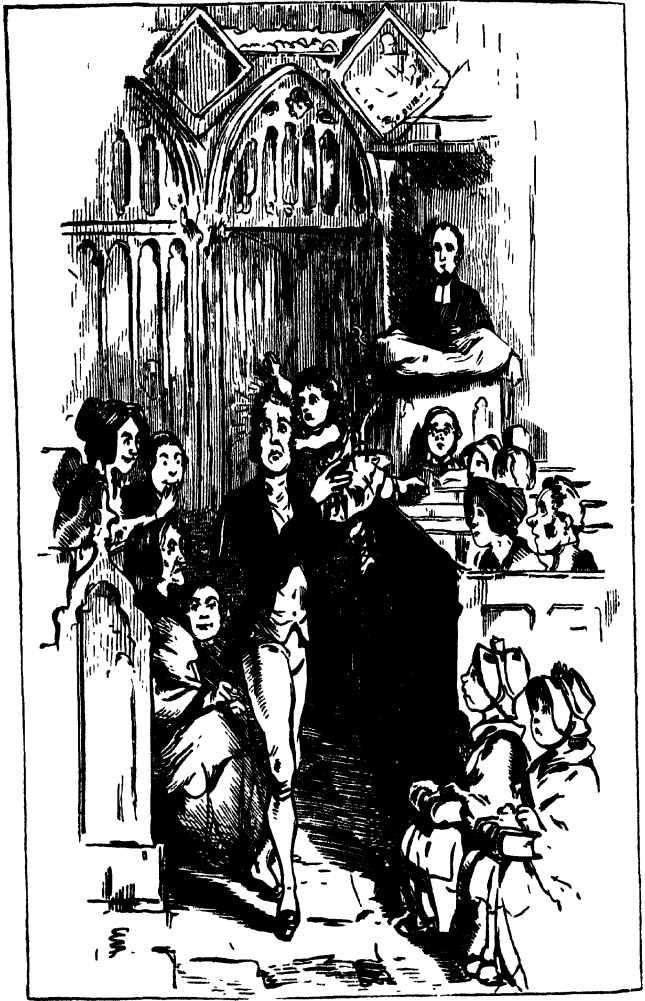
MASTER FRANCIS IN A STATE OF REVOLT.