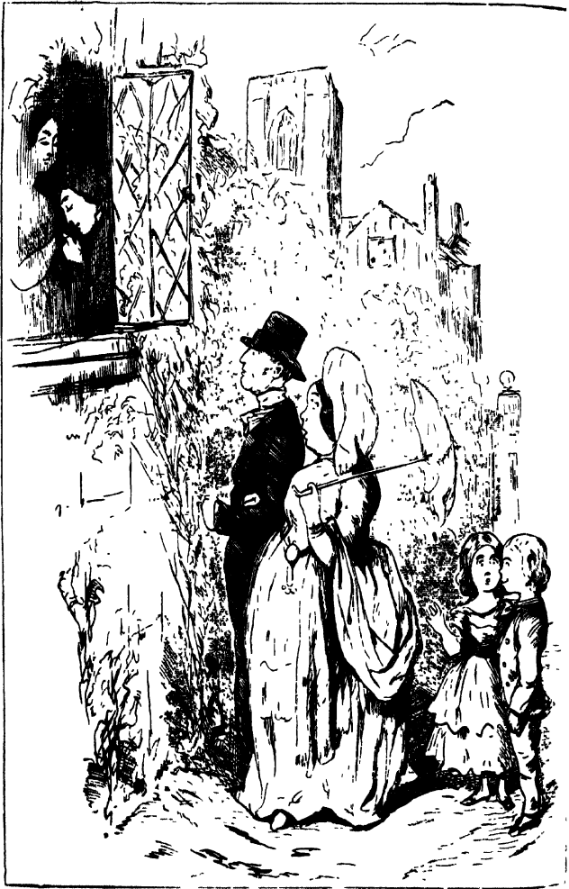
A VIEW FROM THE DEAN'S GARDEN.