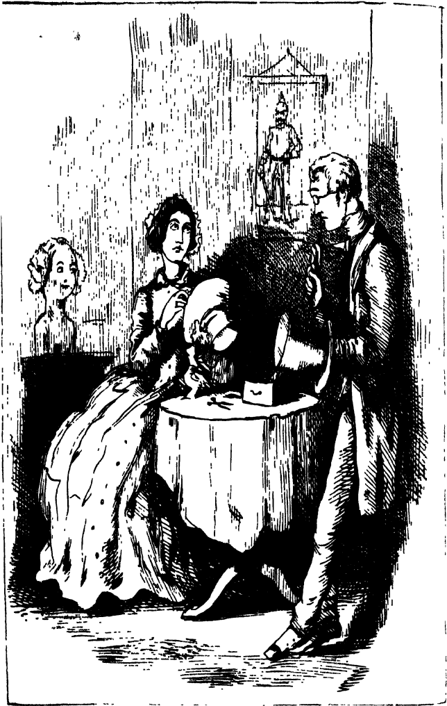
THE CURATE'S CONFIDANTE.