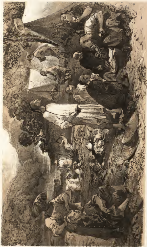
THE PEOPLE OF THE