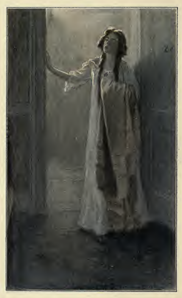
HIS EYES CAUGHT THE OUTLINE OF A GIRL.