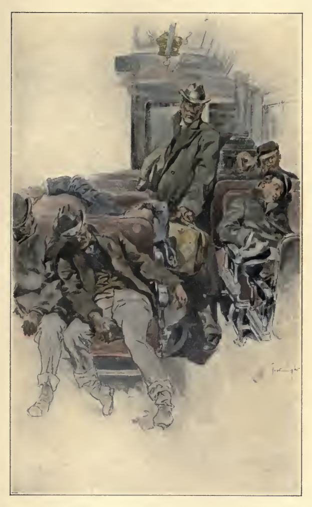
HEADS AND ARMS AND LEGS MADE THE PASSAGE OF THE AISLE DIFFICULT.