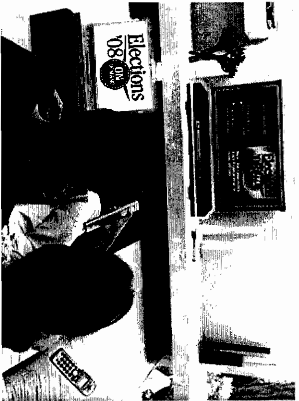
For more information on Political Advertising opportunities, contact a specialist.