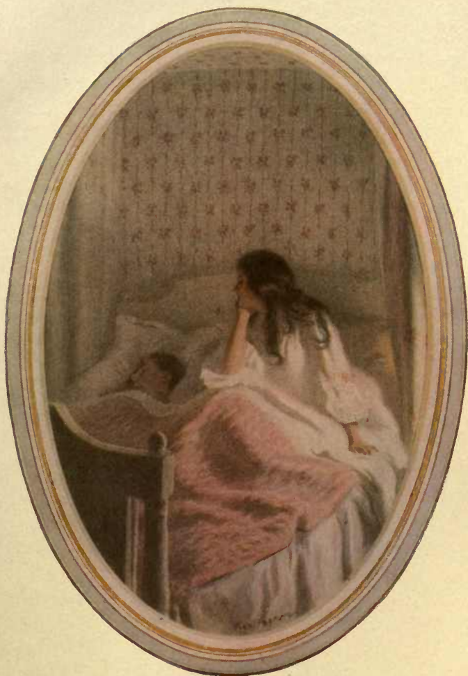
“In the dead of night Daphne sat up in bed, looking at the face and head of her husband beside her on the pillow”