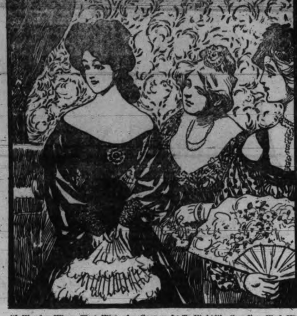
"I Wonder Where That Flirt of a George Is To-Night?" Can You Find Him!

In Saturday's puzzle an alligator can be found formed on the bank of the