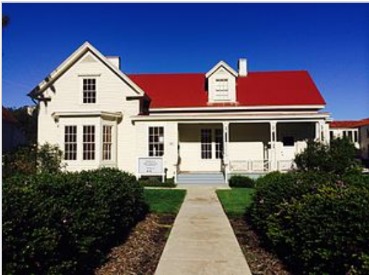
Wiki Education Foundation's office is in the right half of the building on 11 Funston Avenue. Our office is located in the Presidio and surrounded by likeminded organizations, many of them non-profits.