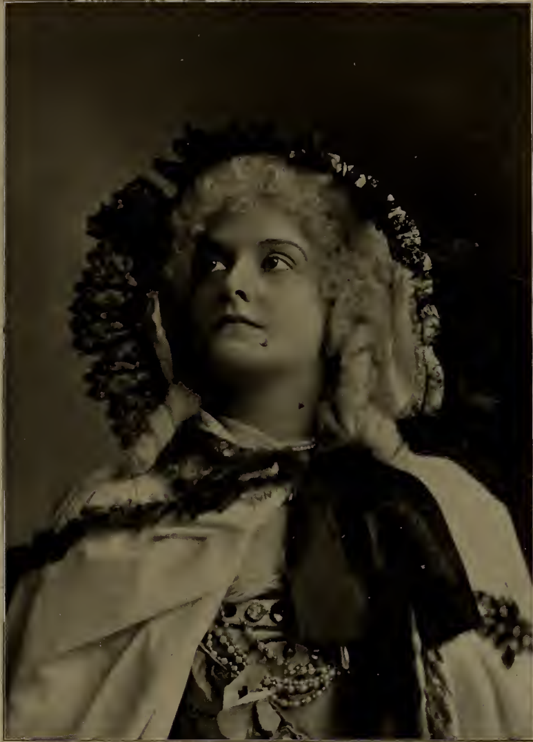
"WHEN GRANDMA DANCED THE MINUET."