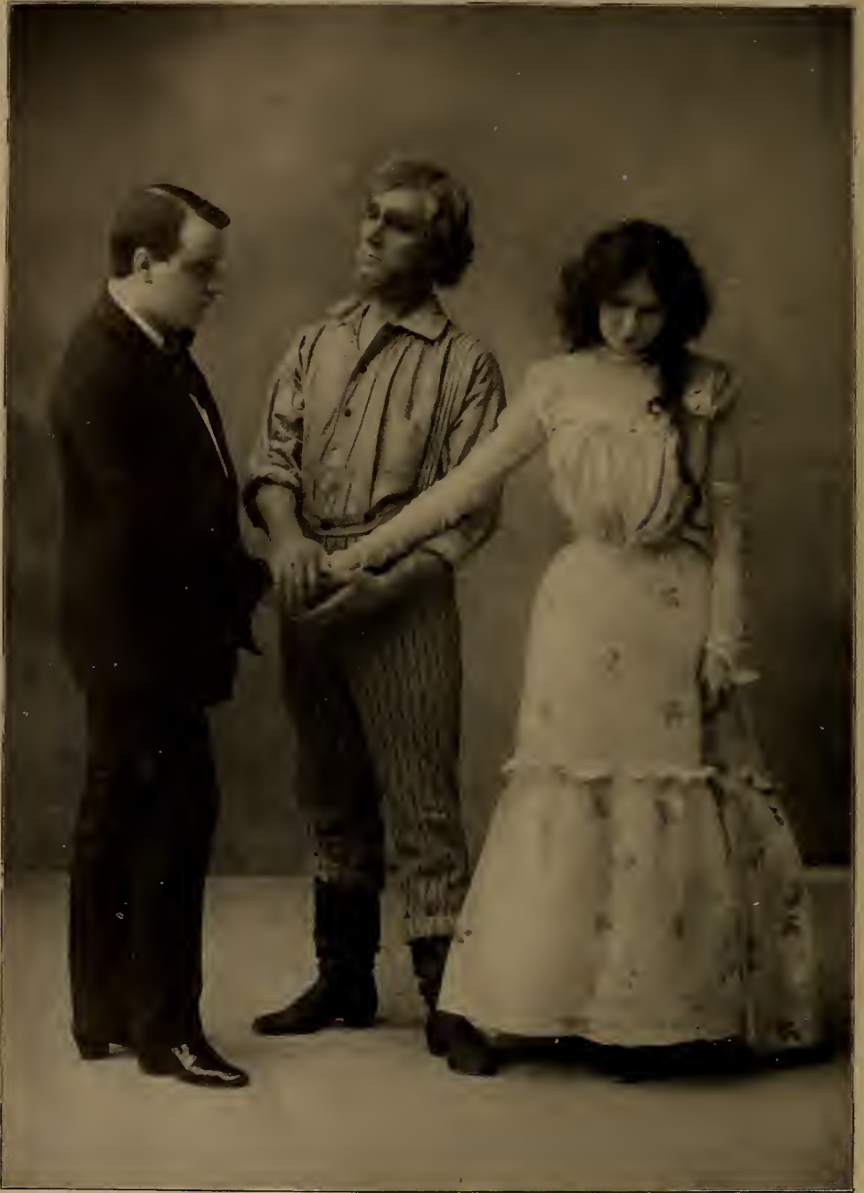
HER FATHER'S CONSENT.