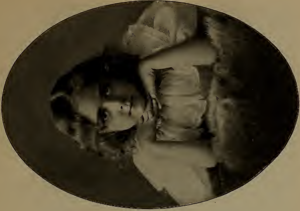
A DAY DREAM.