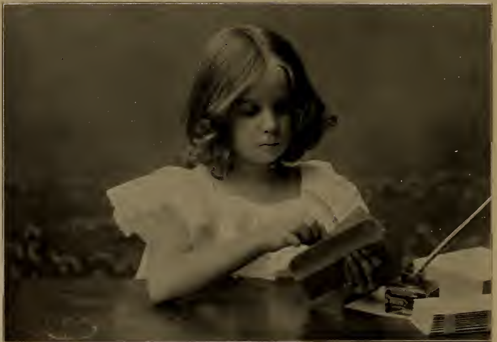
"Now, I'll mail it."