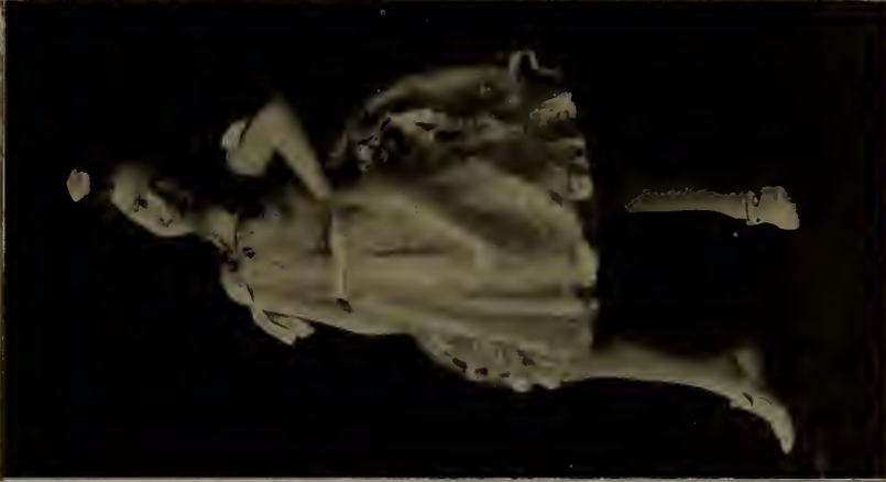
There was music, there was dancing, And the sight was most entrancing, As if fairyland and floral band were holding jubilee.