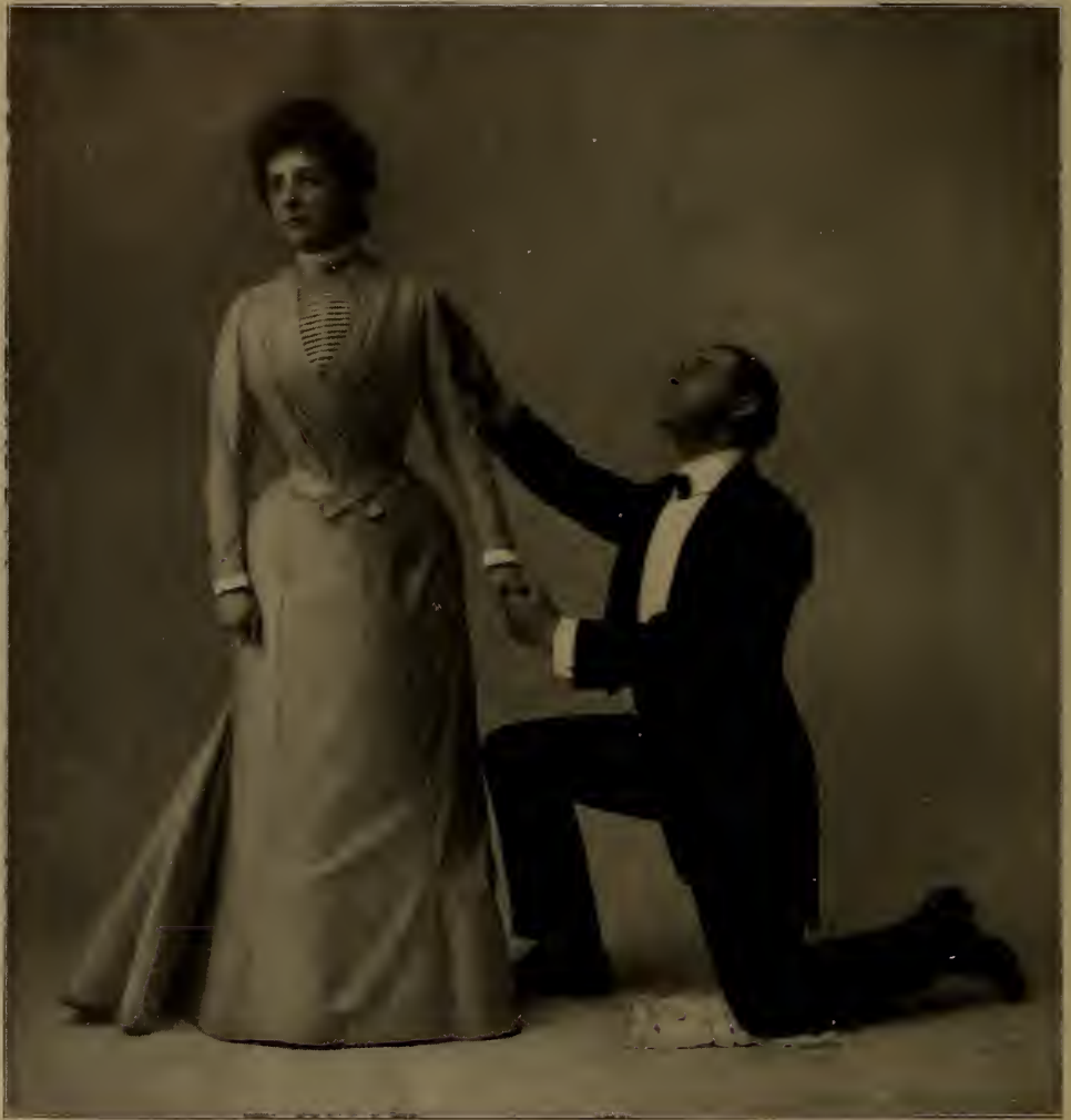
A PLEA FOR FORGIVENESS.