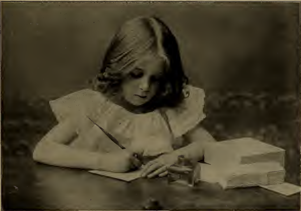
"I've got it."