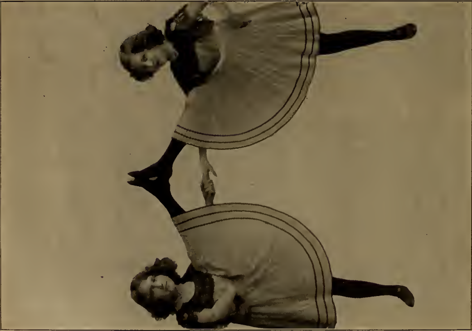
The fiddlers were scraping so cheerly, O, With a one, two, three, and a one, two, three,