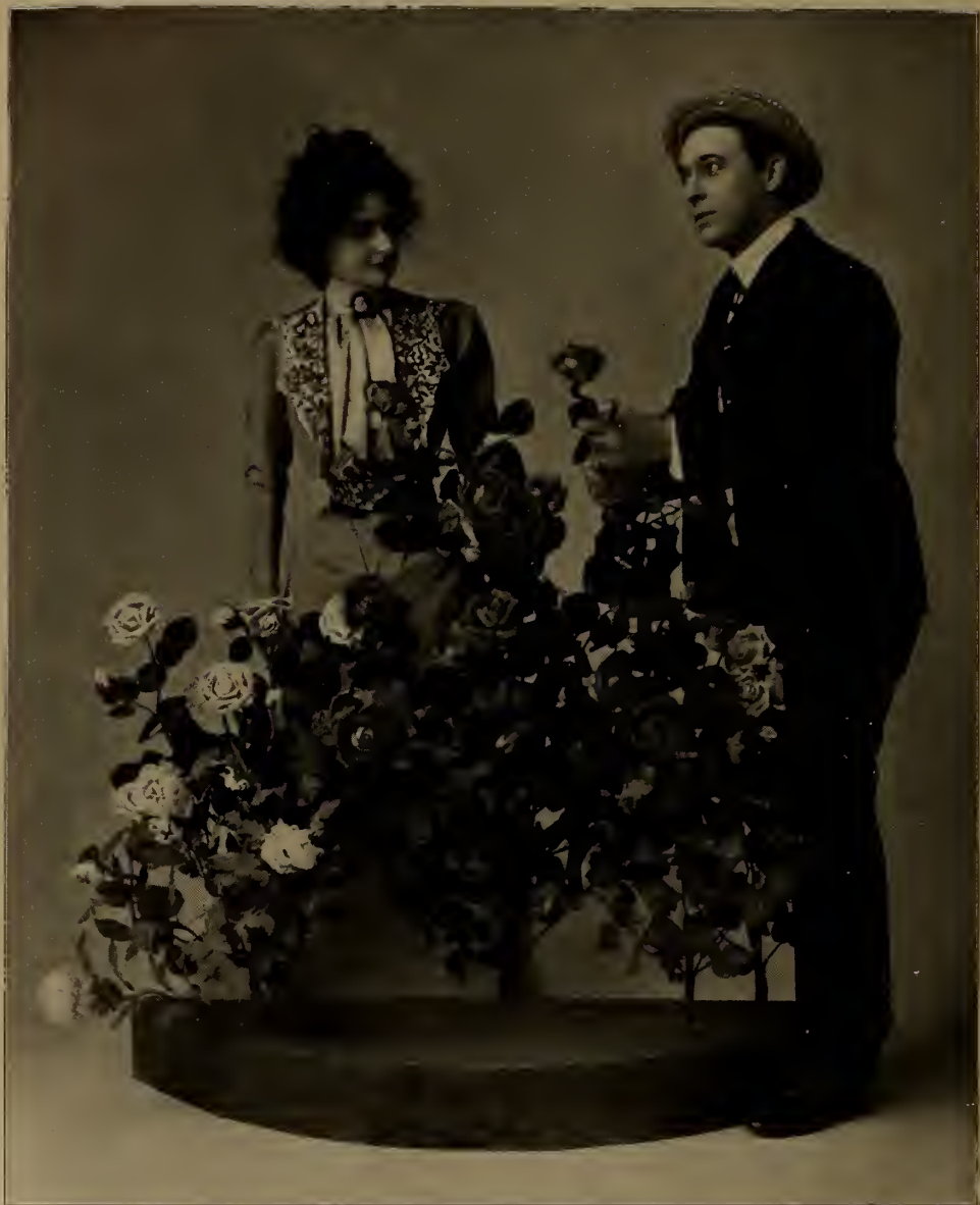
"MY LOVE IS LIKE A RED, RED ROSE!"