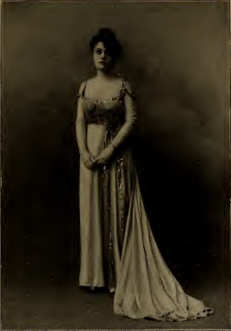
THE IDEAL POISE.