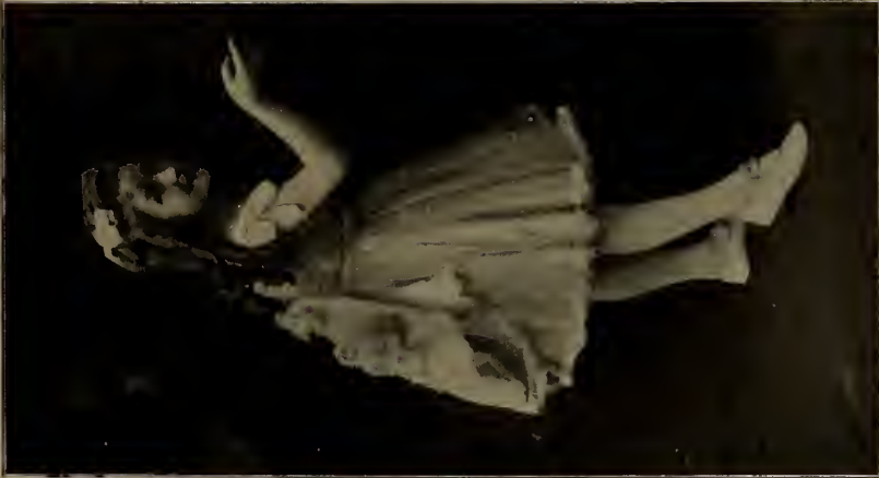
The great display of frilling Was positively killing; And, oh, the little booties and the lovely sash so wide!