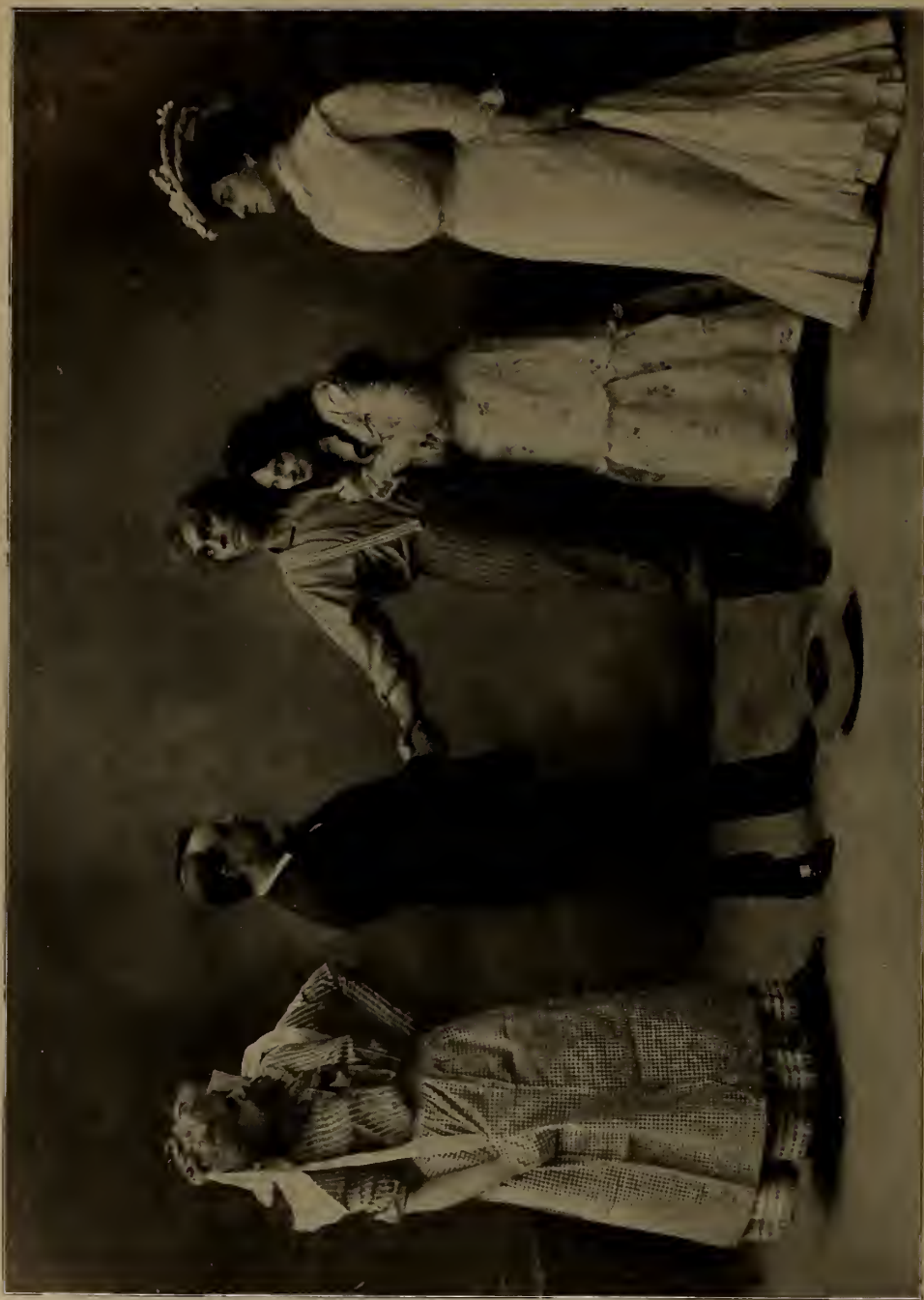
THE PLEDGE OF LOVE AND HONOR.