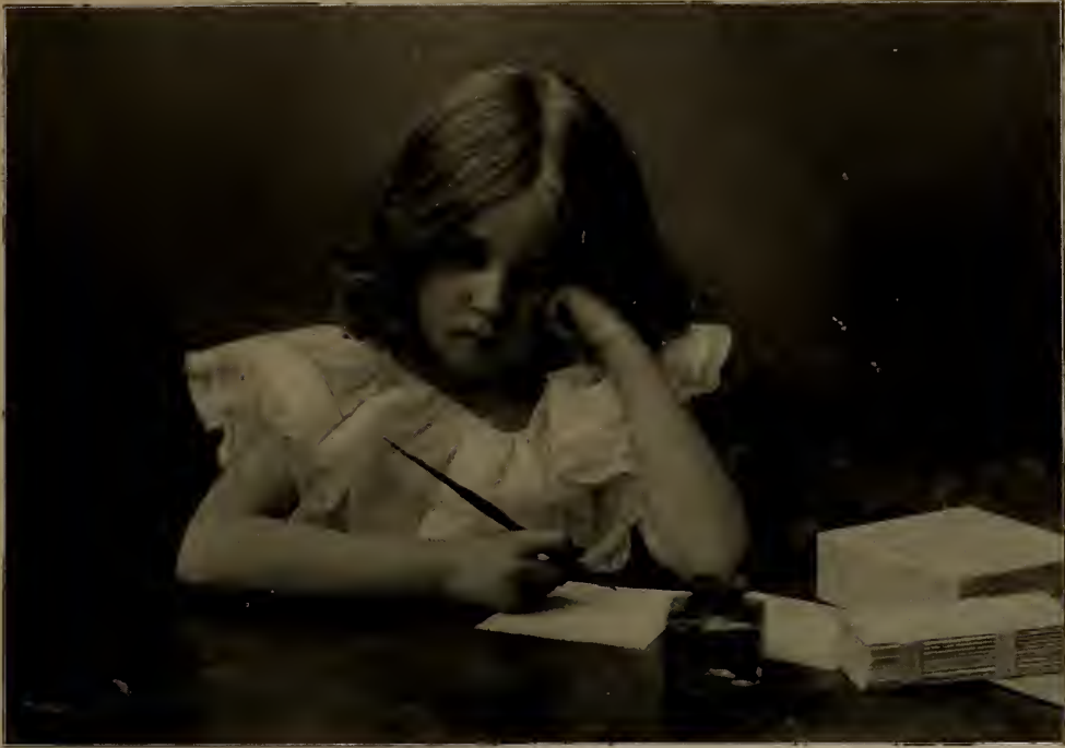
"What shall I write?"