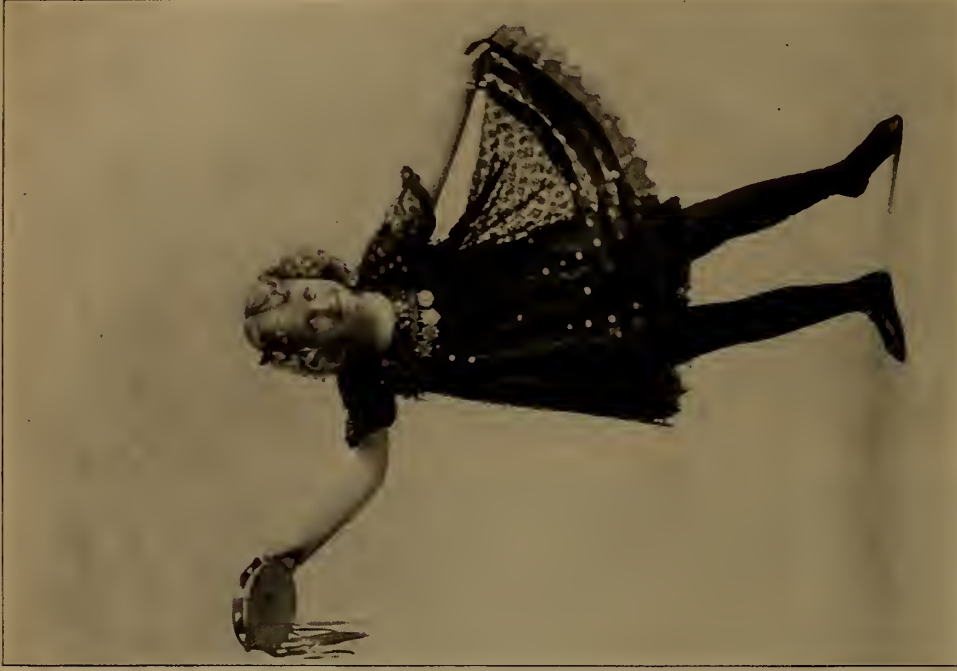
And the children were dancing so merrily, O, All under the shade of the Christmas tree.