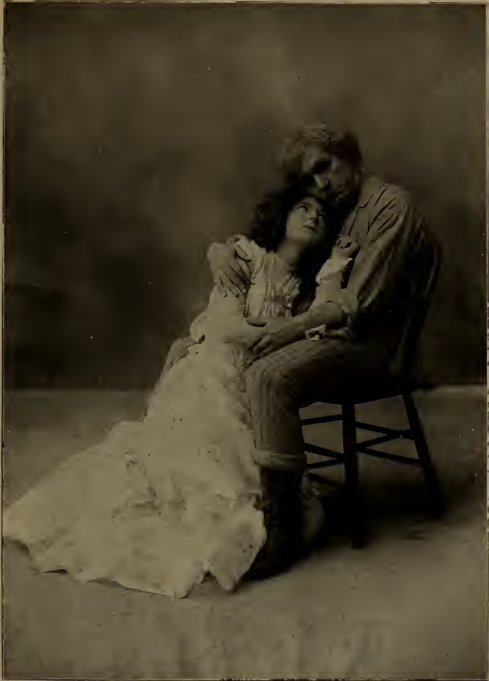
SHARING A SORROW.