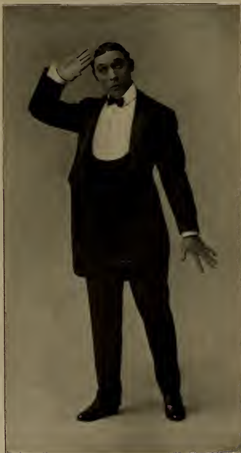
THE AWKWARD SALUTE

4. Do not move the arm and hand to the intended position by the shortest course, but describe a waving line, and let the motion be rather slow, until the position is almost reached, then let the hand move quickly to its place, in completing the gesture.