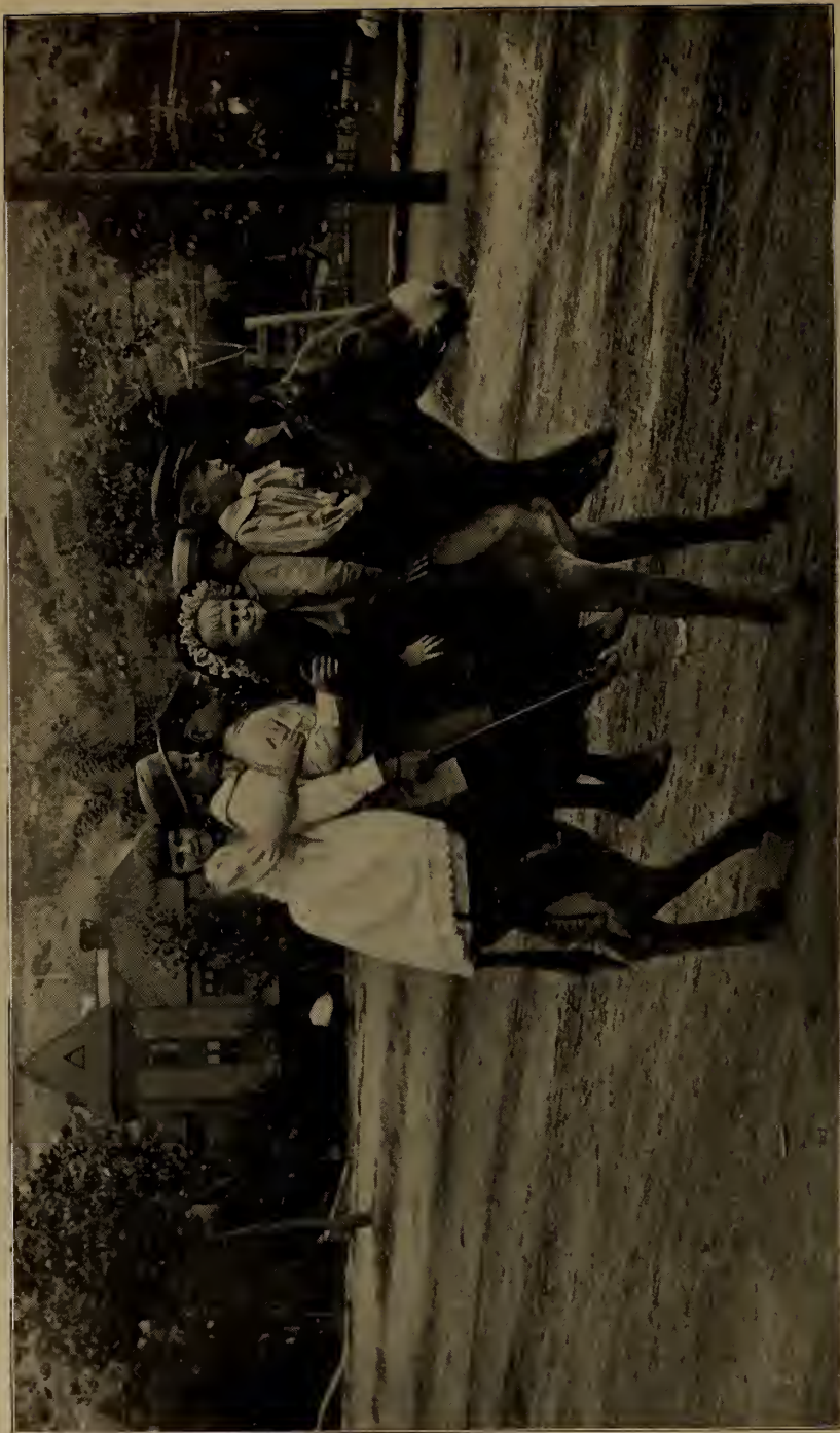
THE DONKEY EXPRESS.