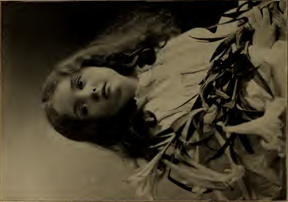
"FAIRER THAN THE LILY."