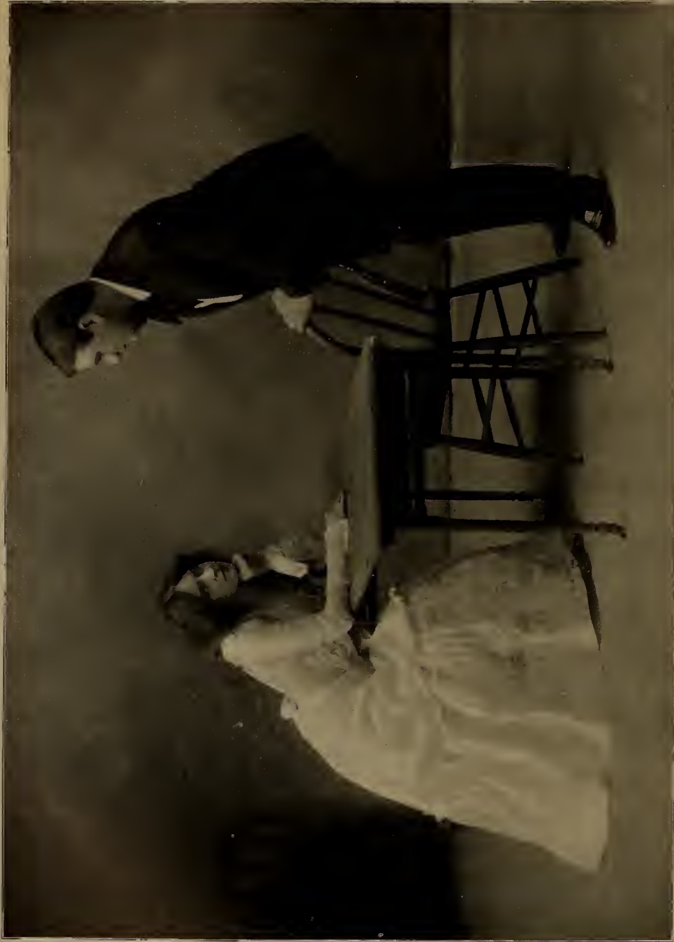
LOVE'S DOUBTS AND FEARS.