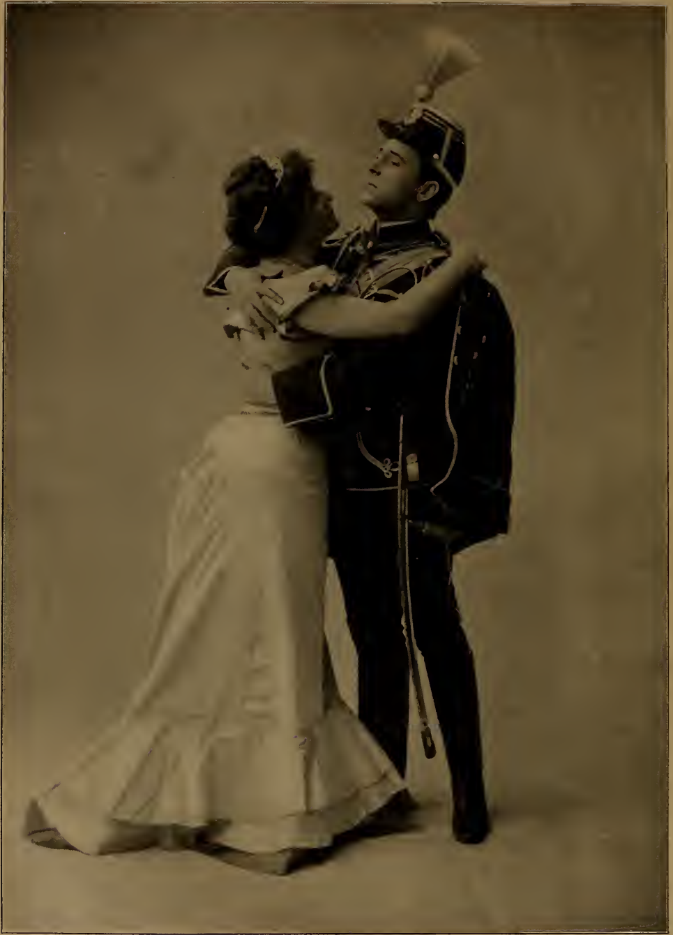
THE SOLDIER'S FAREWELL.