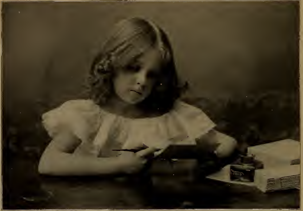
"I send a thousand kisses."