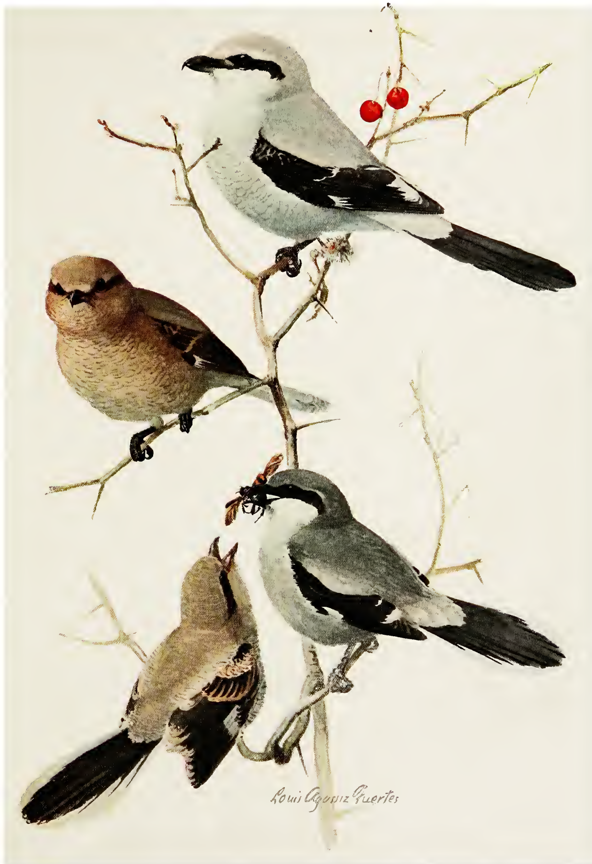
NORTHERN SHRIKE Lanius borealis Vieillot ADULT MALE