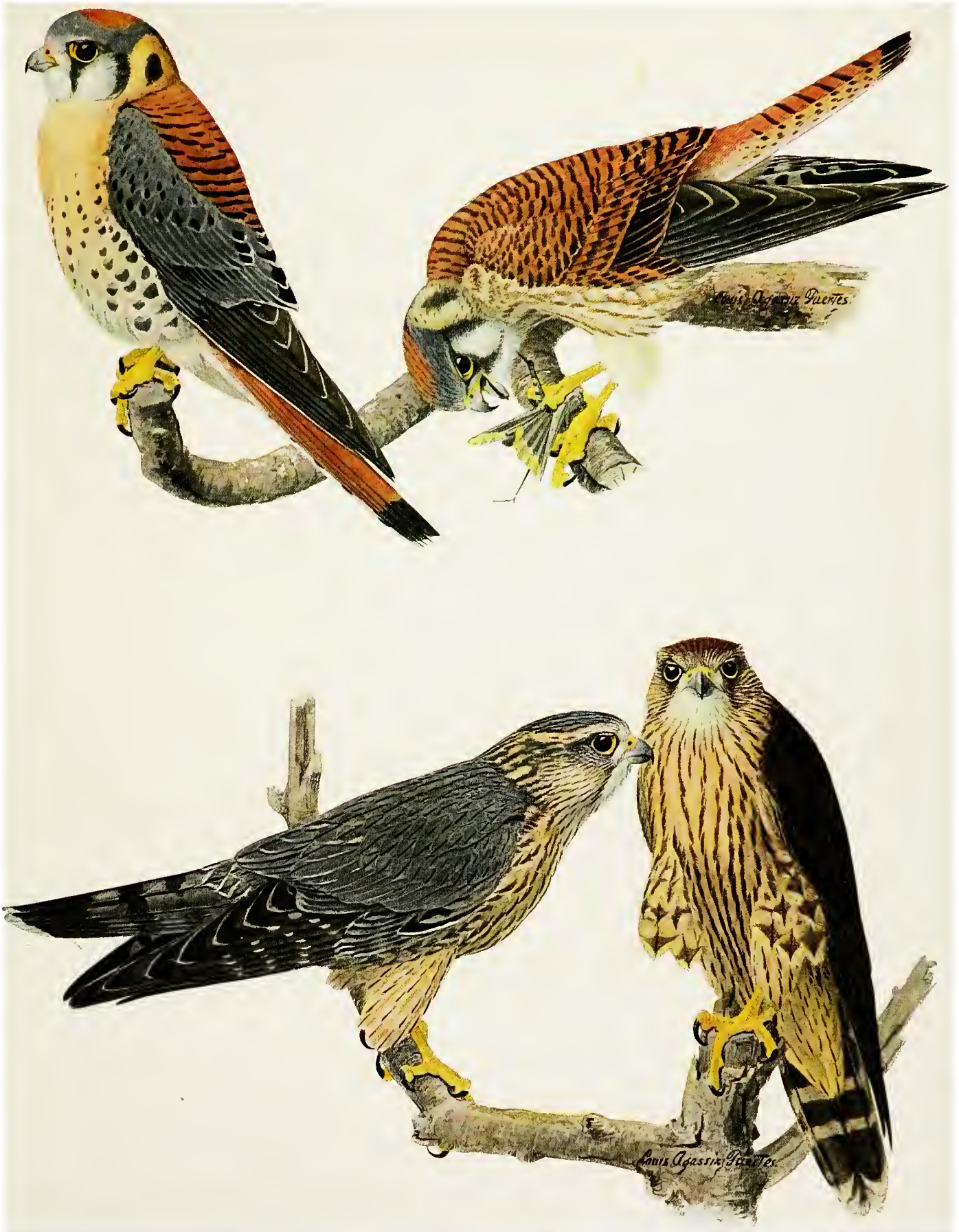
MALE SPARROW HAWK Falco sparverius sparverius Linnaeus FEMALE PIGEON HAWK Falco columbarius columbarius Linnaeus ADULT IMMATURE All \frac{1}{2} nat. size