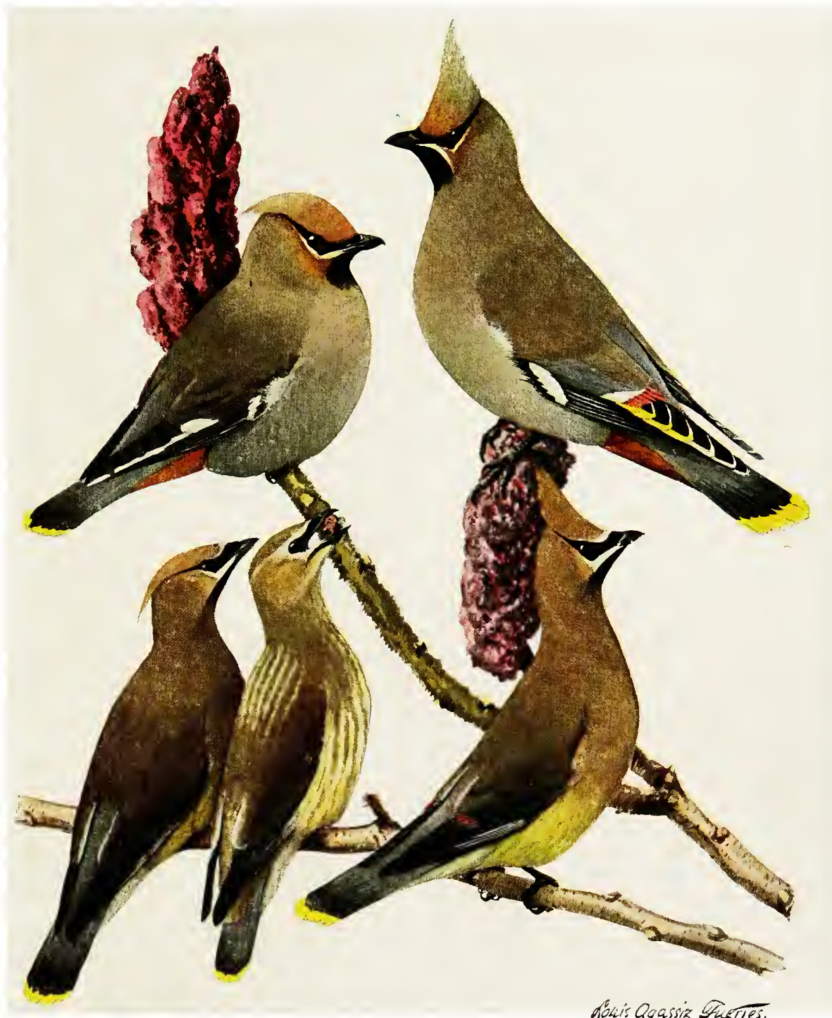
BOHEMIAN WAXWING Bombycilla garrula (Linnaeus) FEMALE CEDAR WAXWING Bombycilla cedrorum Vieillot MALE FEMALE IMMATURE MALE All \frac{1}{2} nat. size