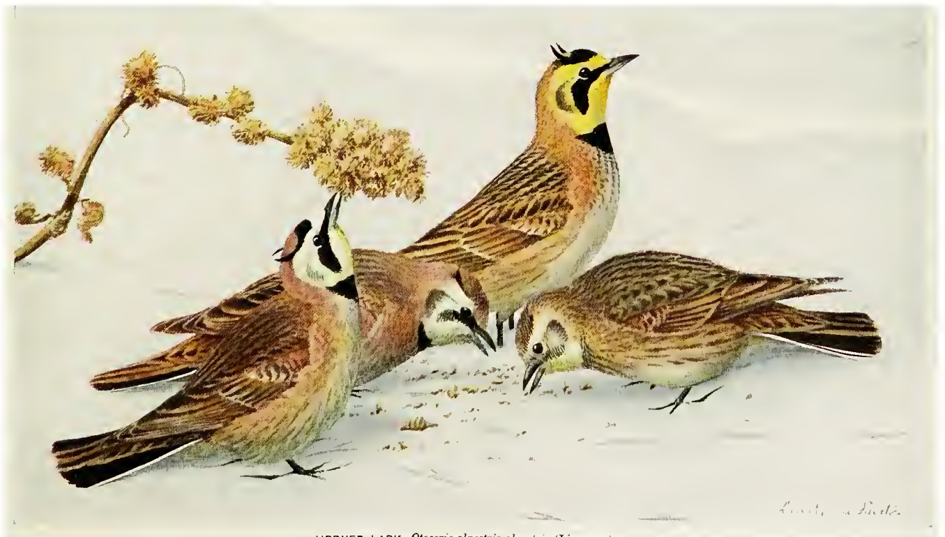
HORNED LARK Otocoris alpestris alpestris (Linnaeus)