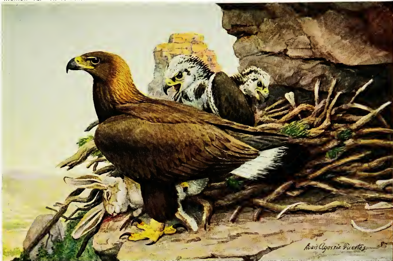
GOLDEN EAGLE Aquila chrysaetos (Linnaeus) ½ nat. size