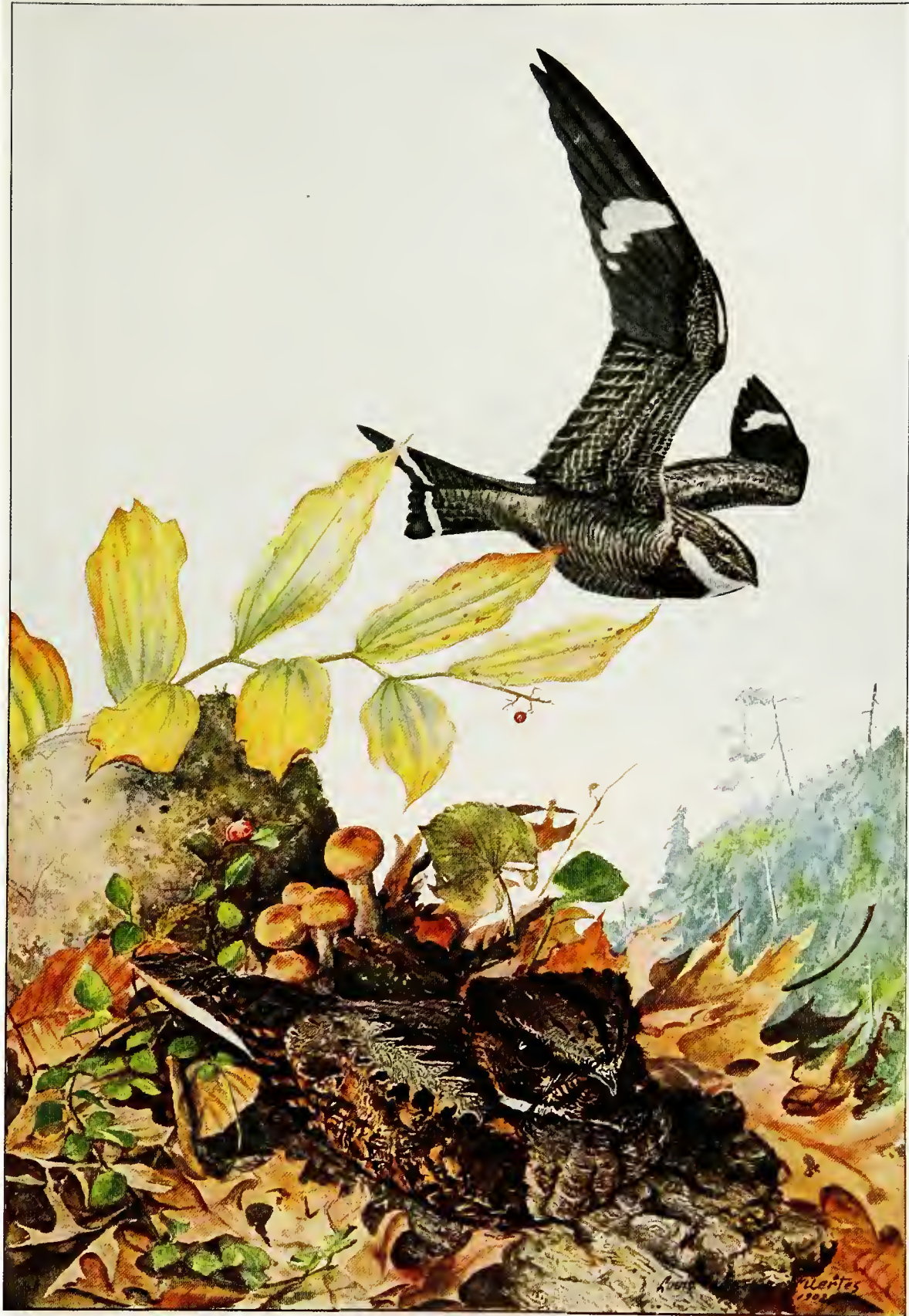
NIGHTHAWK Chordeiles virginianus virginianus (Gmelin)