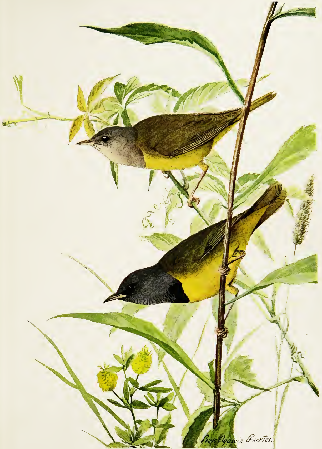
MOURNING WARBLER Oporornis philadelphia (Wilson)