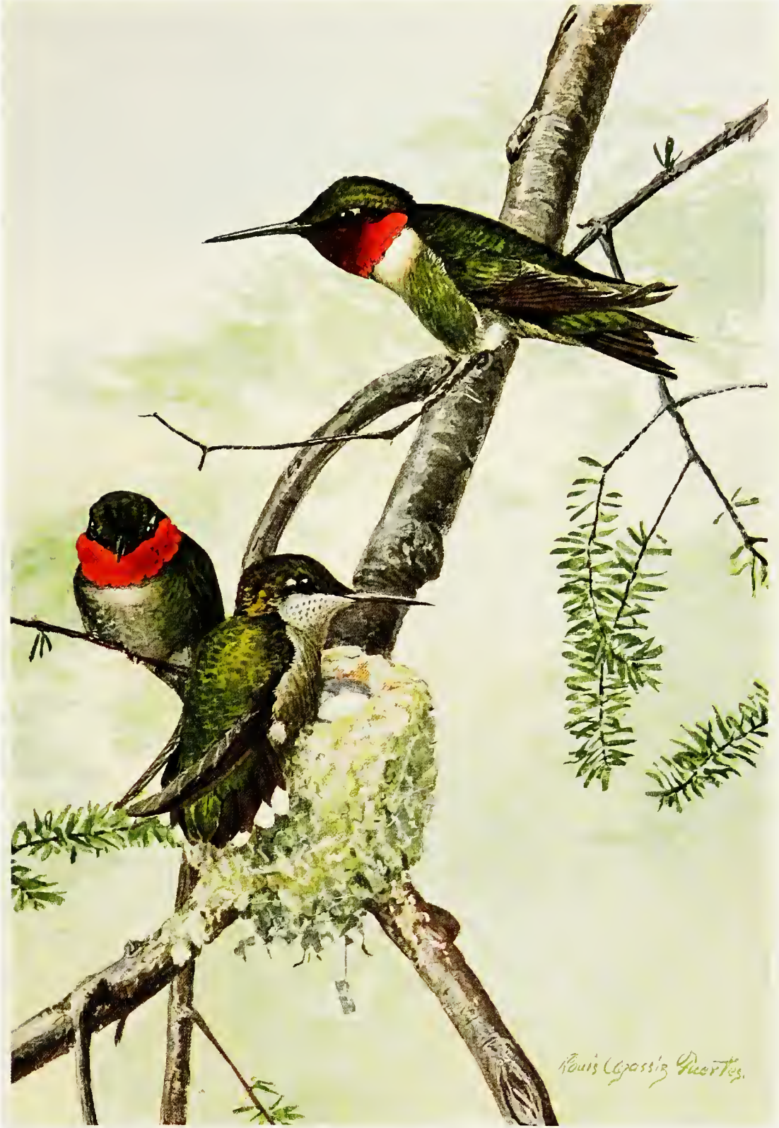
RUBY-THROATED HUMMINGBIRD Archilochus colubris (Linnaeus)