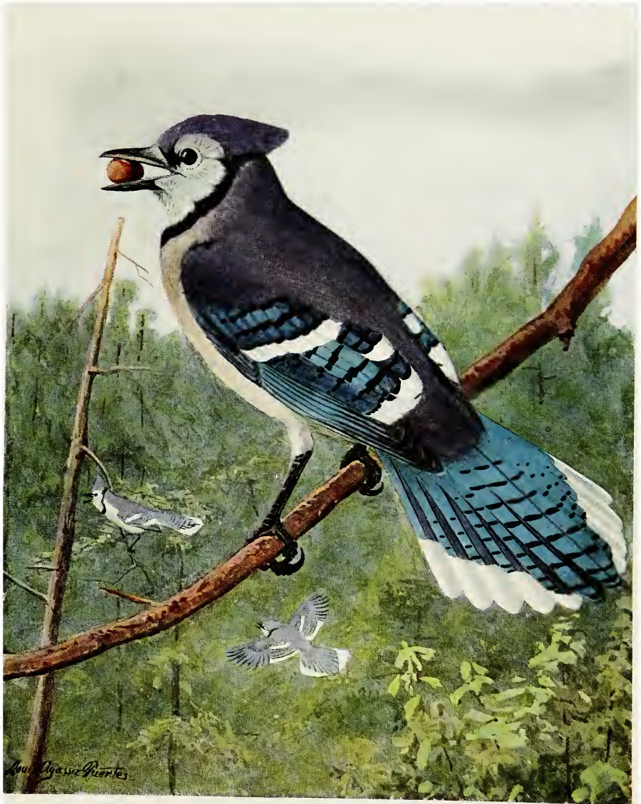
BLUE JAY Cyanocitta cristata cristata (Linnaeus) ¾ nat. size