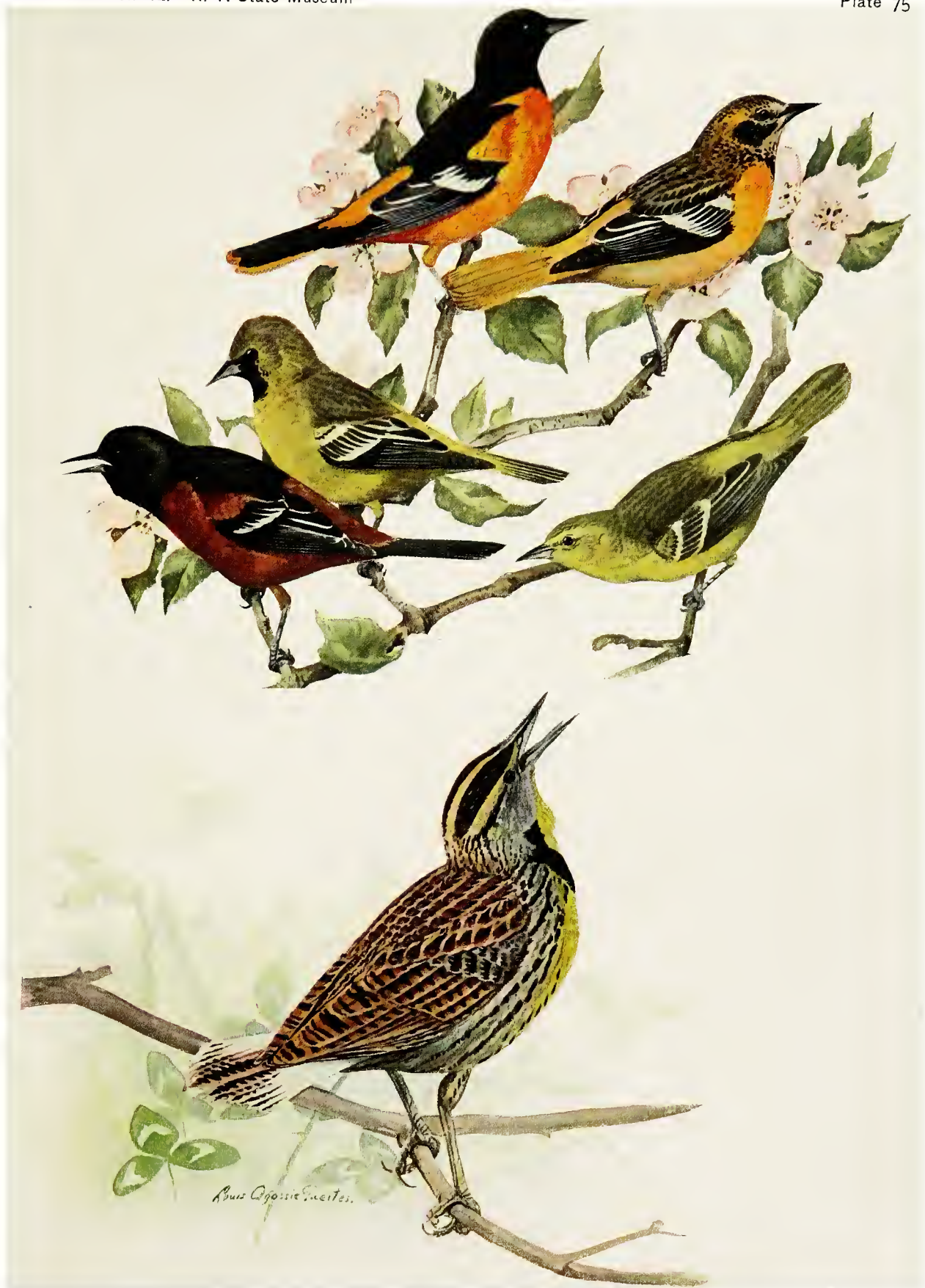
BALTIMORE ORIOLE Icterus galbula (Linnaeus) MALE ORCHARD ORIOLE Icterus spurius (Linnaeus) FEMALE FIRST YEAR MALE ADULT MALE MEADOWLARK Sturnella magna magna (Linnaeus) FEMALE All \frac{1}{2} nat. size