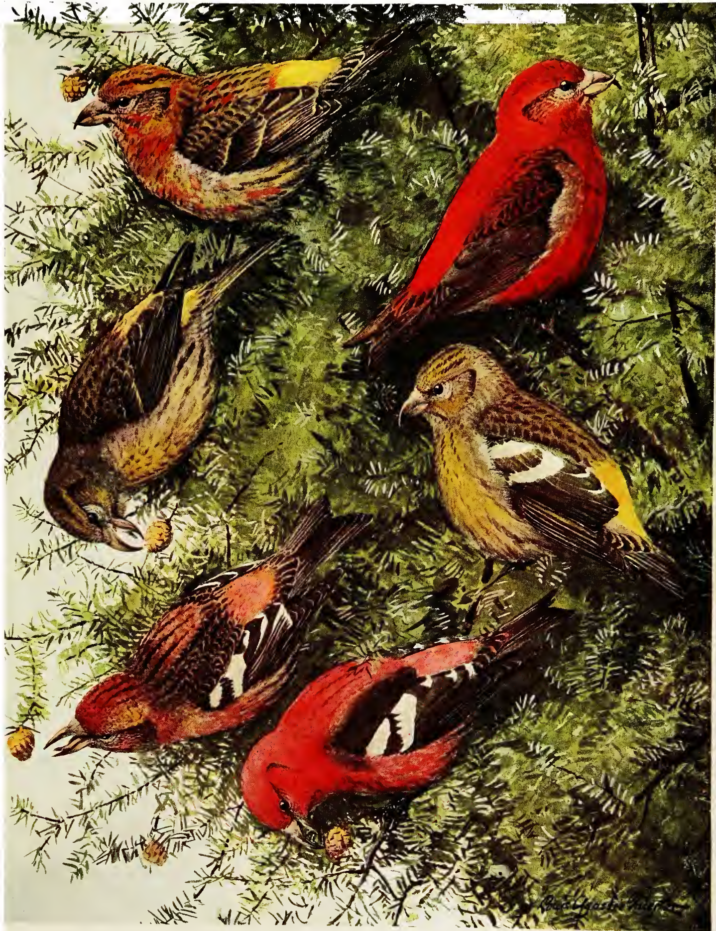
CROSSBILL Loxia curvirostra minor (Brehm)