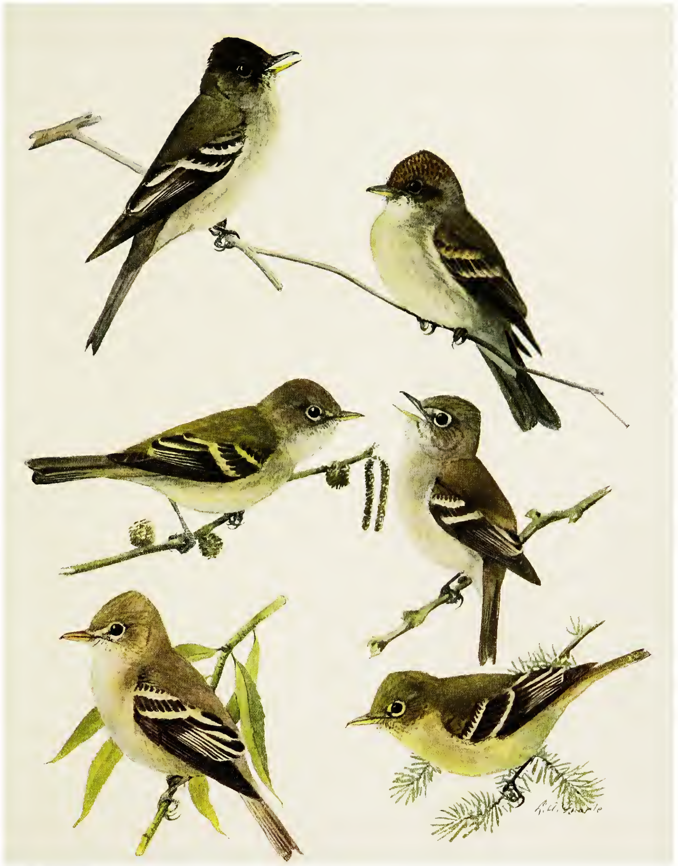
WOOD PEWEE Myiochanes virens (Linnaeus) ADULT ALDER FLYCATCHER Empidonax traillii alnorum Brewster IMMATURE ACADIAN FLYCATCHER Empidonax vireescens (Vieillot) LEAST FLYCATCHER Empidonax minimus (W. M. & S. F. Baird) YELLOW-BELLIED FLYCATCHER Empidonax flaviventris (W. M. & S. F. Baird)