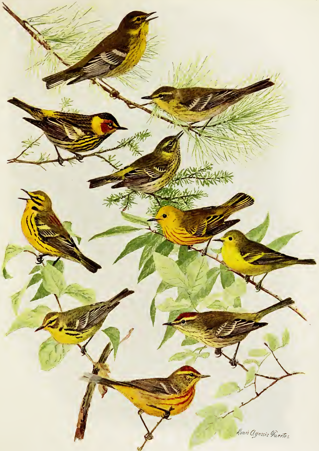
PINE WARBLER Dendroica vigosii (Audubon) MALE FEMALE CAPE MAY WARBLER Dendroica tigrina (Gmelin) MALE FEMALE PRAIRIE WARBLER Dendroica discolor (Vieillot) MALE FEMALE YELLOW WARBLER Dendroica aestiva aestiva (Gmelin) MALE FEMALE YELLOW PALM WARBLER Dendroica palmarum palmarum (Gmelin) PALM WARBLER Dendroica palmarum hypochrysea Ridgway All \frac{1}{2} nat. size