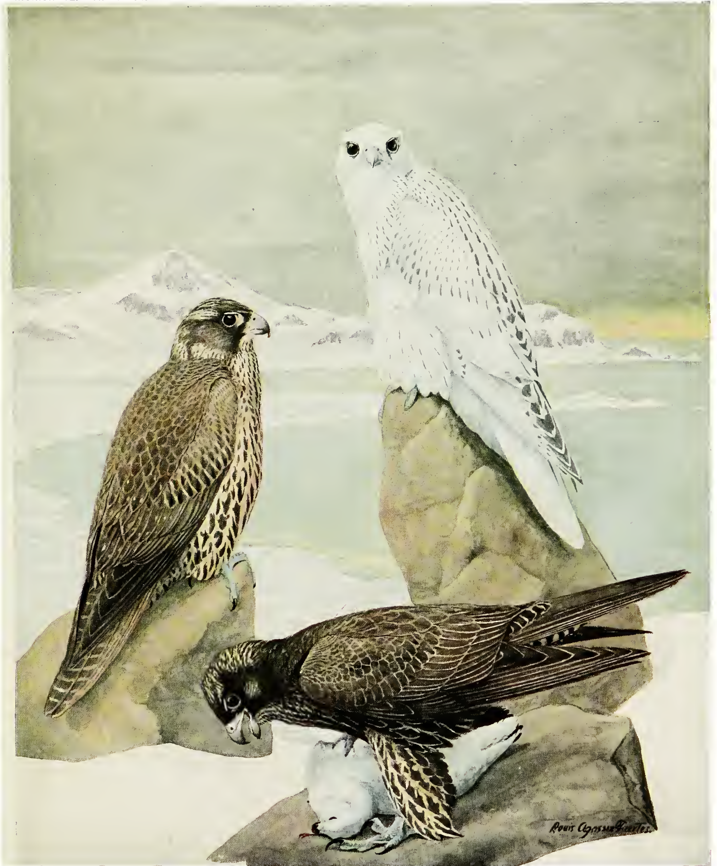
GYRFALCON Falco rusticolus gyrfalco Linnaeus