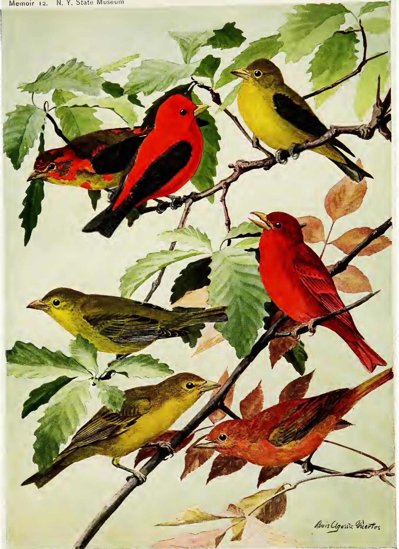
CHANGING MALE FEMALE