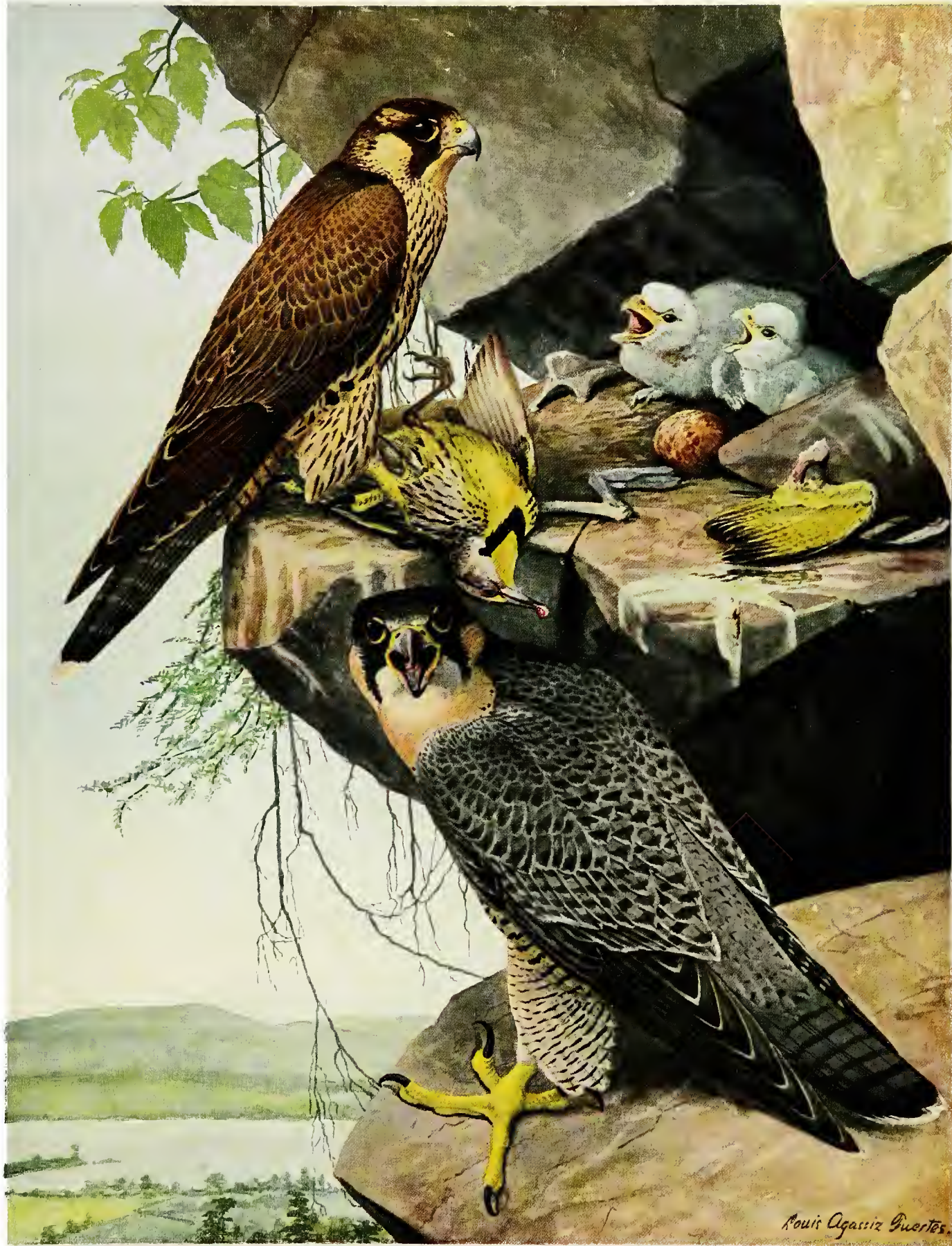
FIRST YEAR MALE DUCK HAWK Falco peregrinus anatum Bonaparte CHICKS AND EGG ADULT FEMALE All \frac{1}{3} nat. size