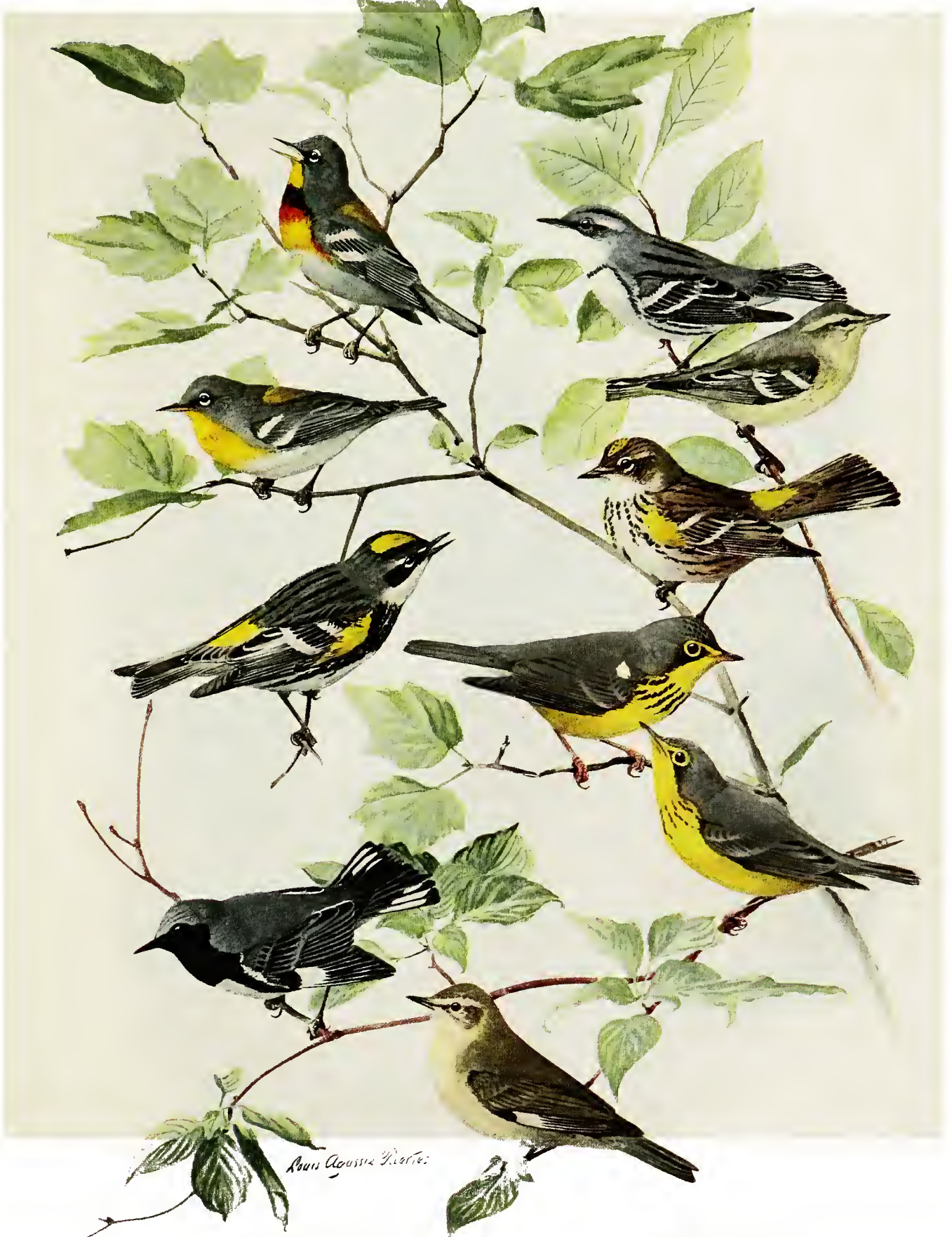
PARULA WARBLER Compothlypis americana americana (Linnaeus) MALE FEMALE