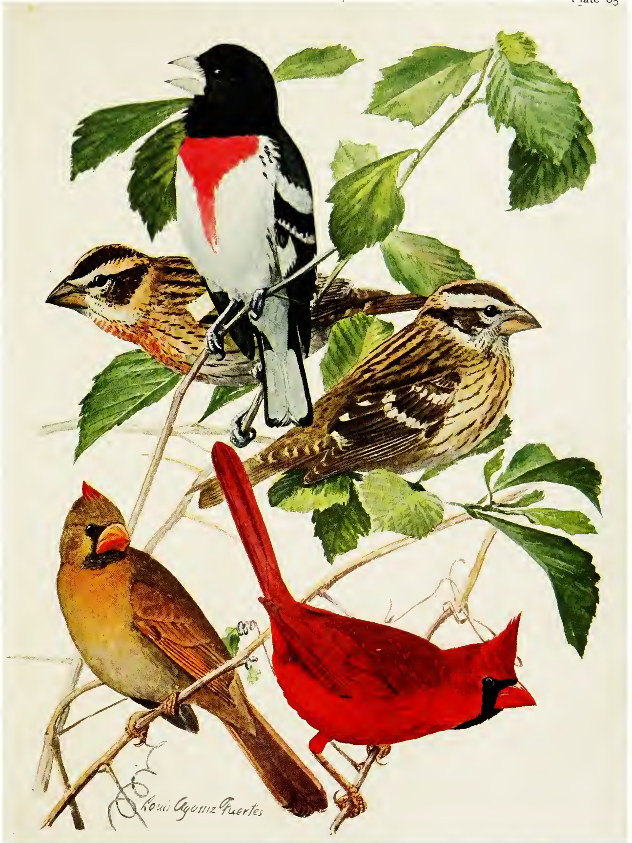
ROSE-BREADED GROSBEEK Zamelodia ludoviciana (Linnaeus) ADULT MALE IMMATURE MALE IN AUTUMN CARDINAL Cardinalis cardinalis cardinalis (Linnaeus) FEMALE FEMALE MALE