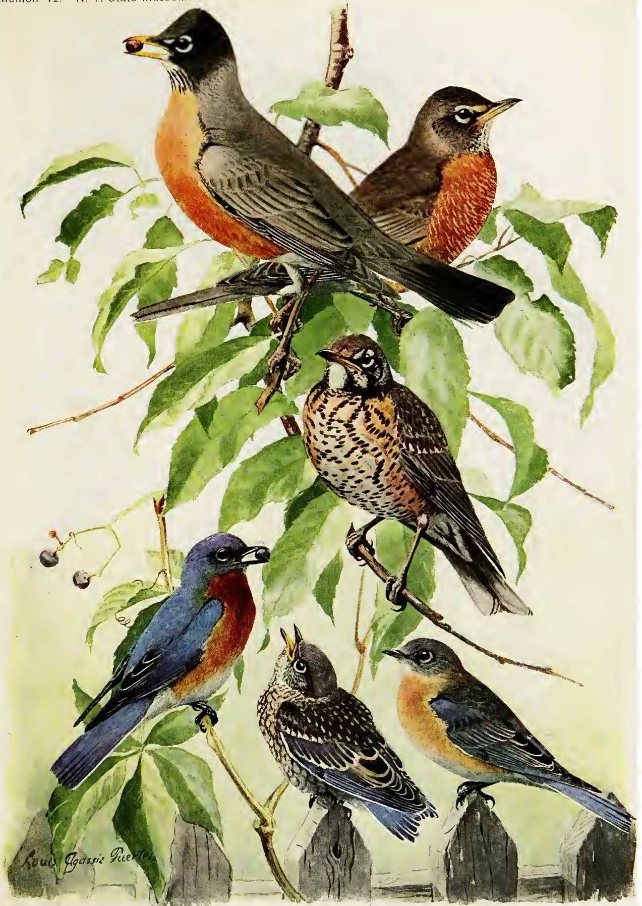
ROBIN Planesticus migratorius migratorius (Linnaeus) ADULT IN SPRING FALL