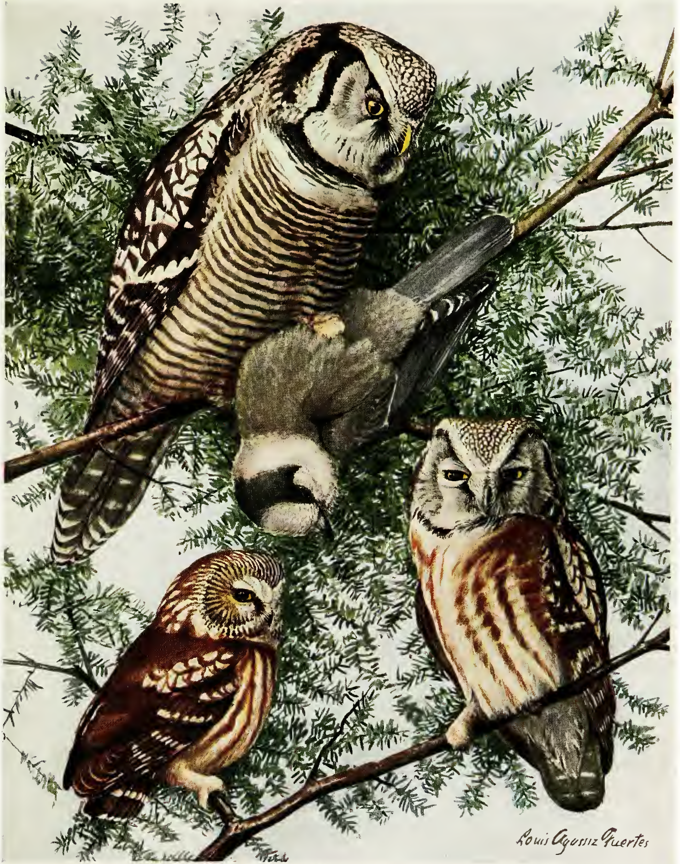
HAWK OWL Surnia ulula caparoch (Müller) SAW-WHET OWL Cryptoglaux acadica acadica (Gmelin)