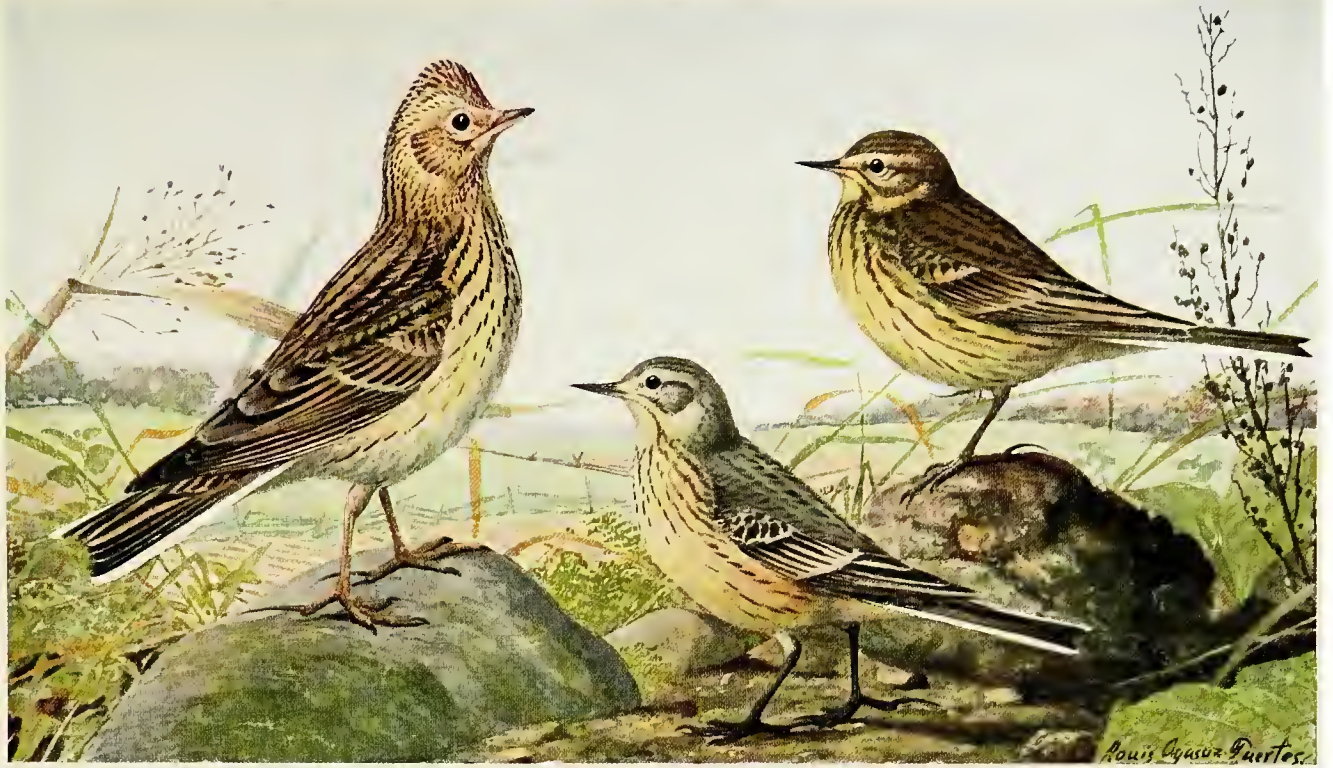
SKYLARK Alauda arvensis Linnaeus