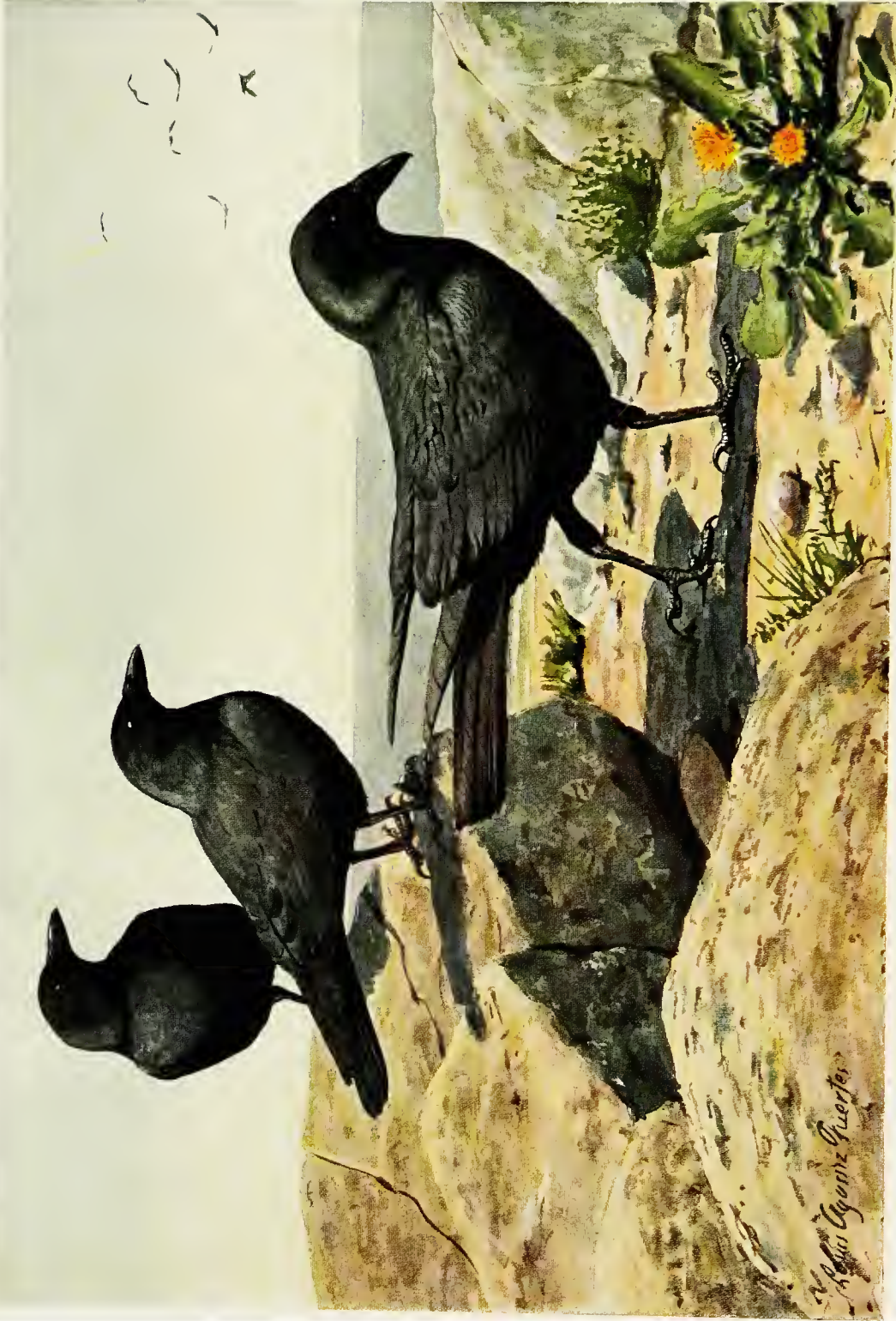
FISH CROW Corvus ossifragus Wilson