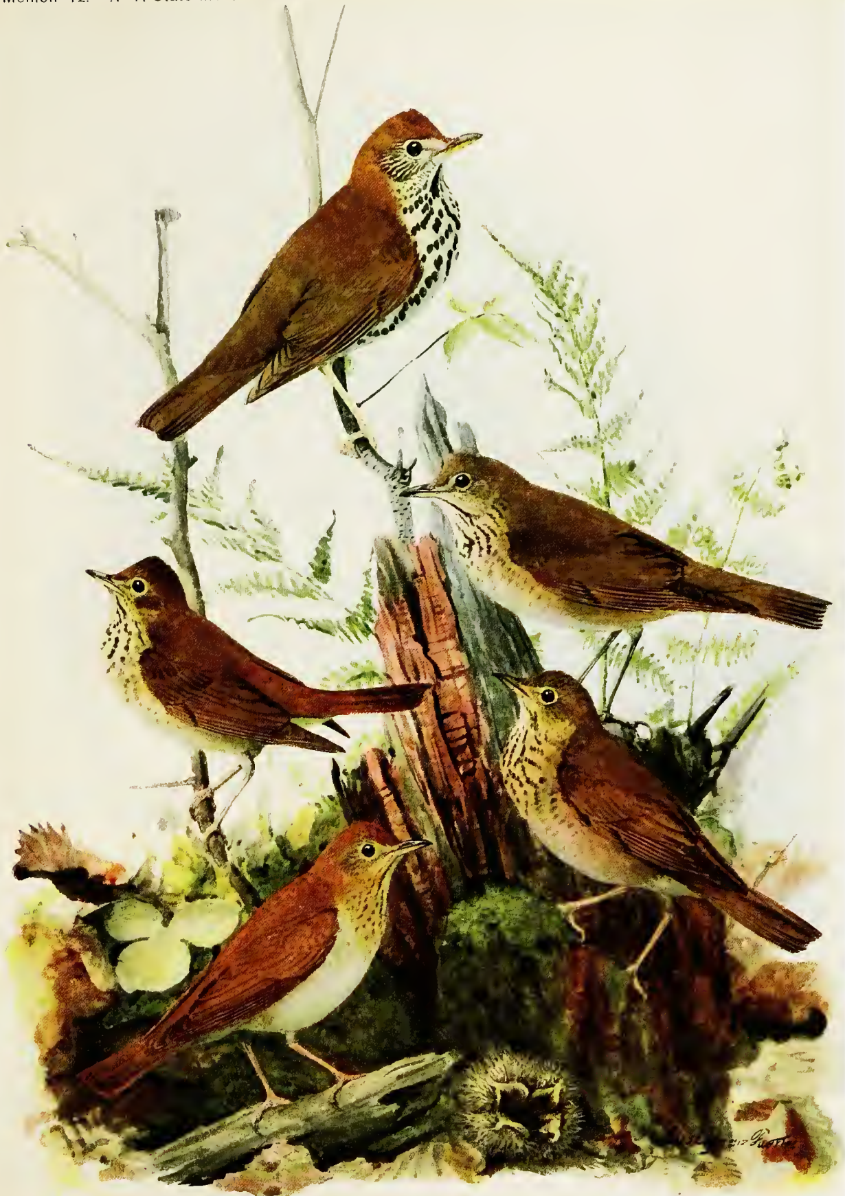
WOOD THRUSH Hylocichla ustulata (Gmelin) HERMIT THRUSH Hylocichla guttata pallasii (Cabanis) GRAY-CHEEKED THRUSH Hylocichla alcyon alcyon (Baird) VEERY Hylocichla fuscescens fuscescens (Stephens) OLIVE-BACKED THRUSH Hylocichla ustulata swainsoni (Tschudi)* All \frac{1}{2} nat. size