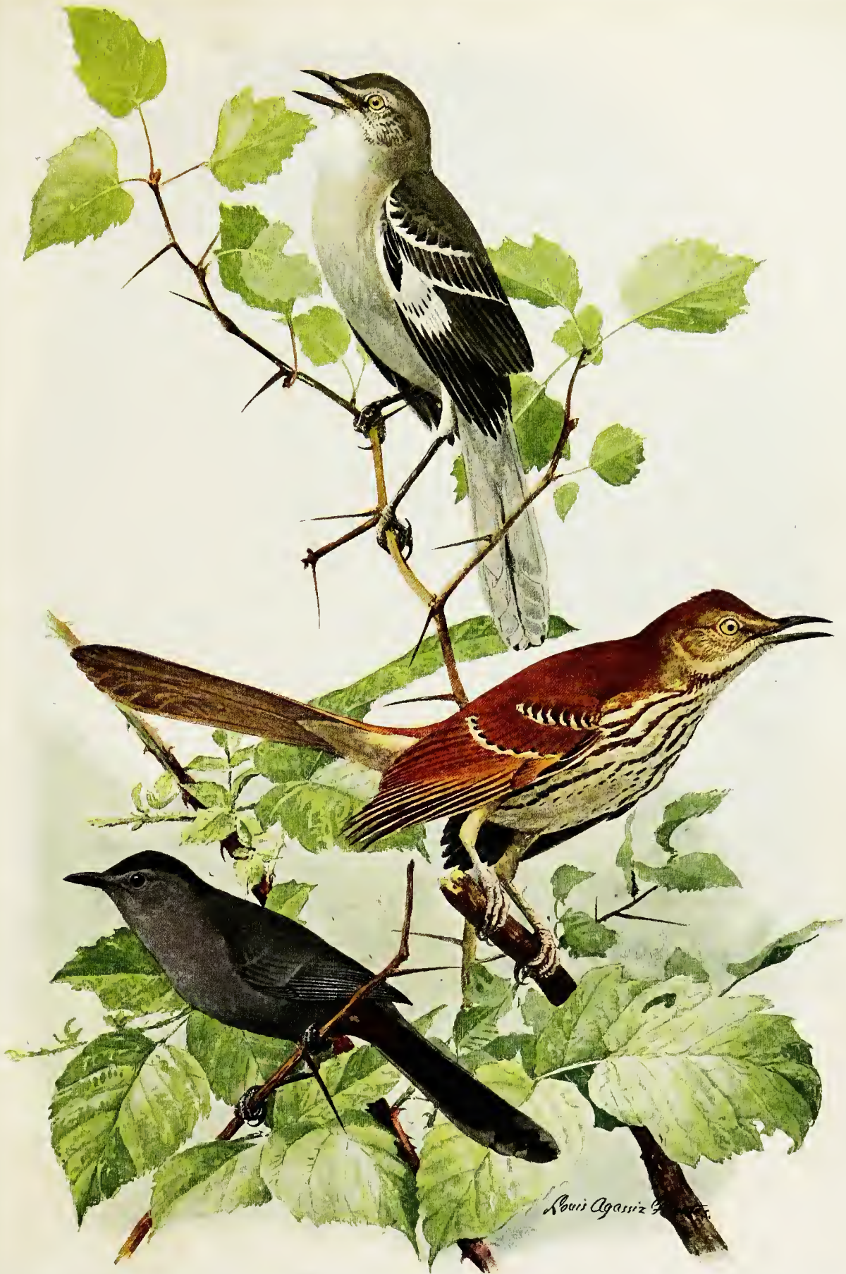
MOCKINGBIRD Mimus polyglottos polyglottos (Linnaeus) BROWN THRASHER Toxostoma rufum (Linnaeus) CATBIRD Dumetella carolinensis (Linnaeus) All \frac{1}{2} nat. size