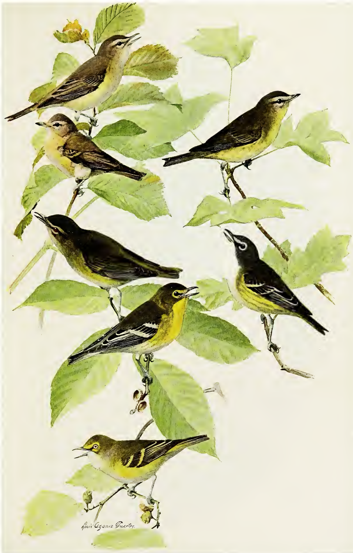
WARBLING VIREO Vireosylva gilva ♂/lva (Vieillot) ADULT