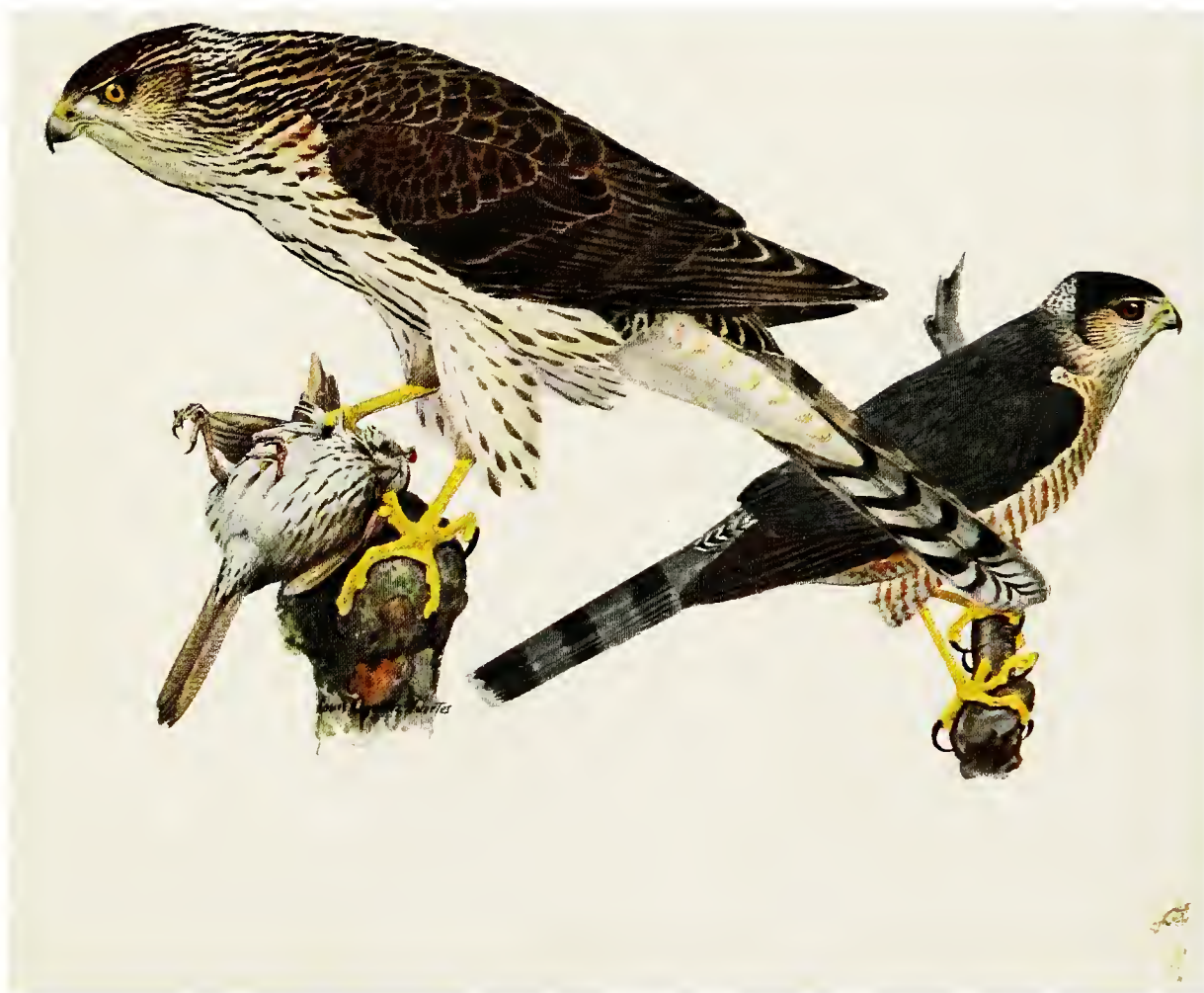
COOPER'S HAWK Accipiter cooperi (Bonaparte) IMMATURE FEMALE