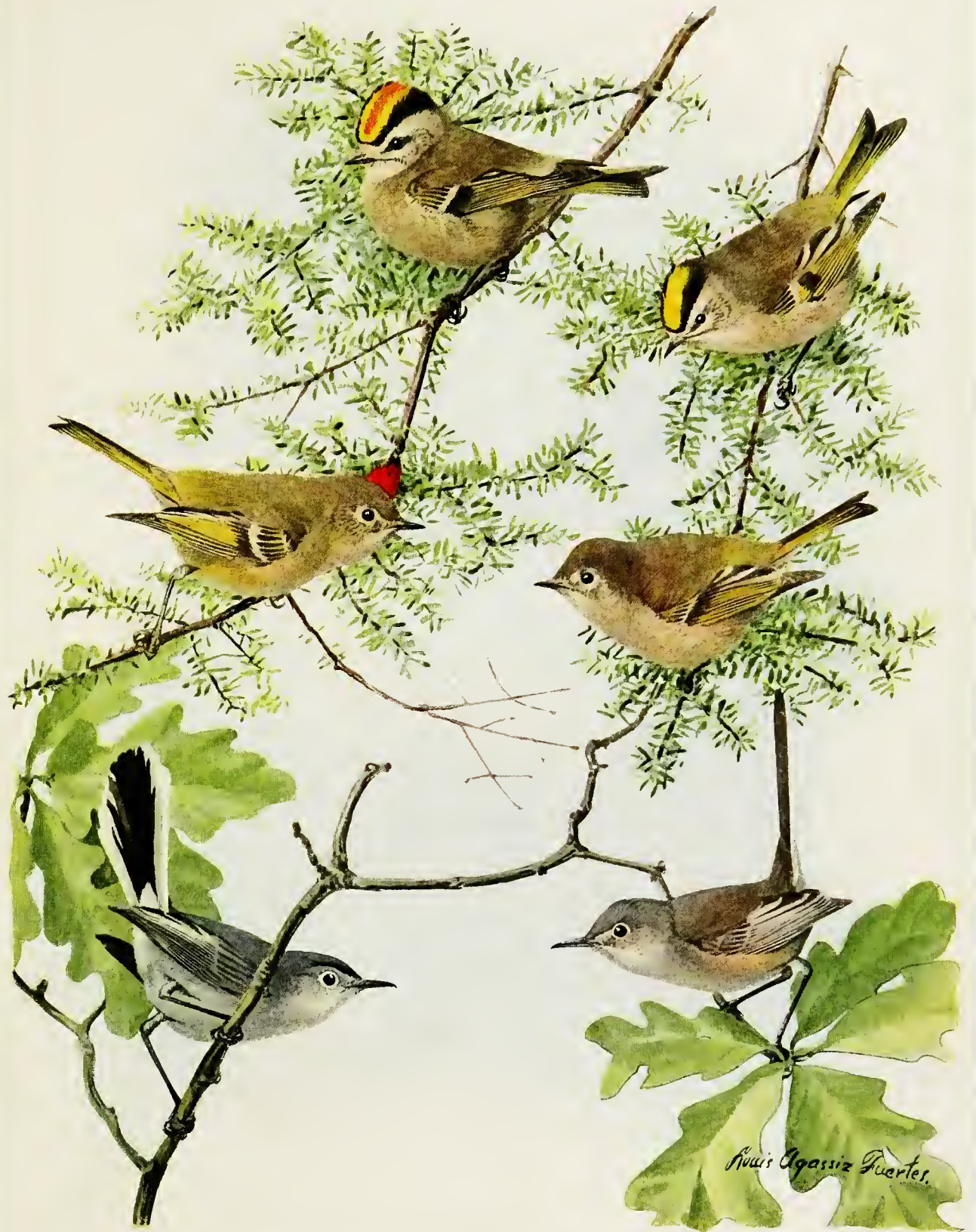
GOLDEN-CROWNED KINGLET Regulus satrapa satrapa Licht.