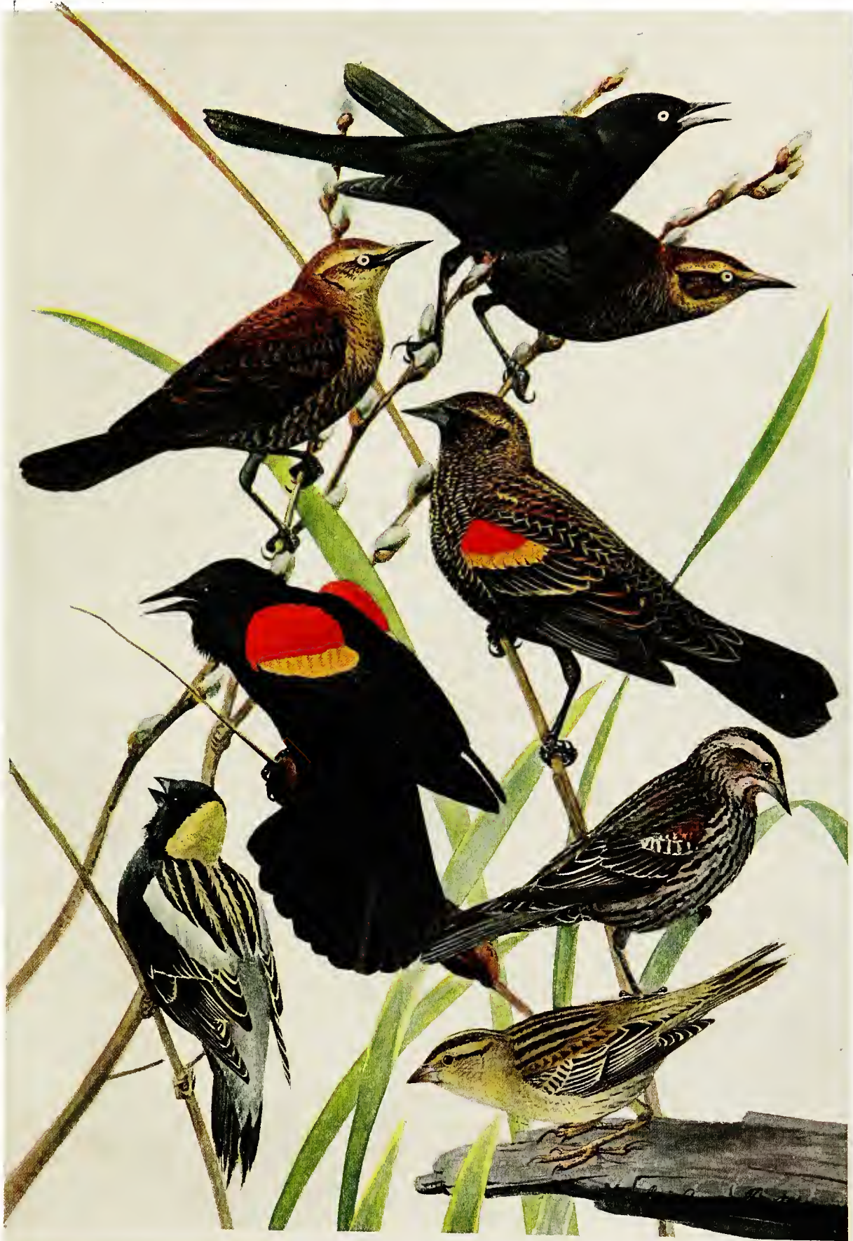
RUSTY BLACKBIRD Euphagus carolinus (Müller)