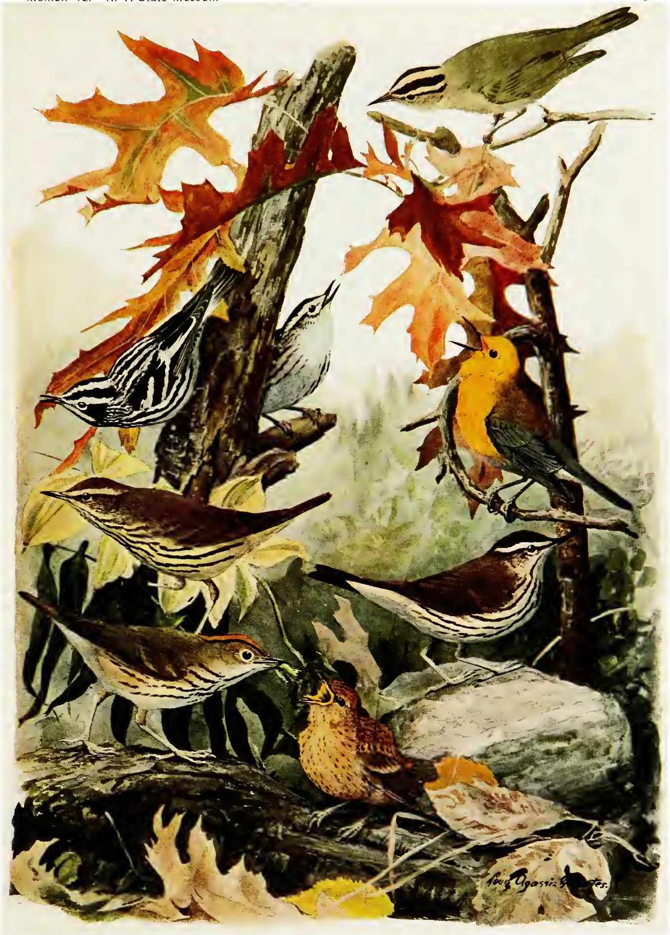
BLACK AND WHITE WARBLER Mniotilta varia (Linnaeus)