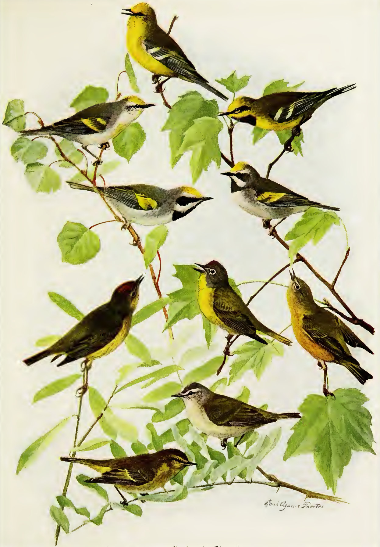
BLUE-WINGED WARBLER Vermivora pinus (Linnaeus) BREWSTER'S WARBLER Vermivora leucobronchialis (Brewster) GOLDEN-WINGED WARBLER Vermivora chrysoptera (Linnaeus) ORANGE-CROWNED WARBLER Vermivora celata celata (Say) TENNESSEE WARBLER Vermivora peregrina (Wilson) LAWRENCE'S WARBLER Vermivora lawrenceti (Herrick) NASHVILLE WARBLER Vermivora rubricapilla rubricapilla (Wilson) All ♂ nat. size