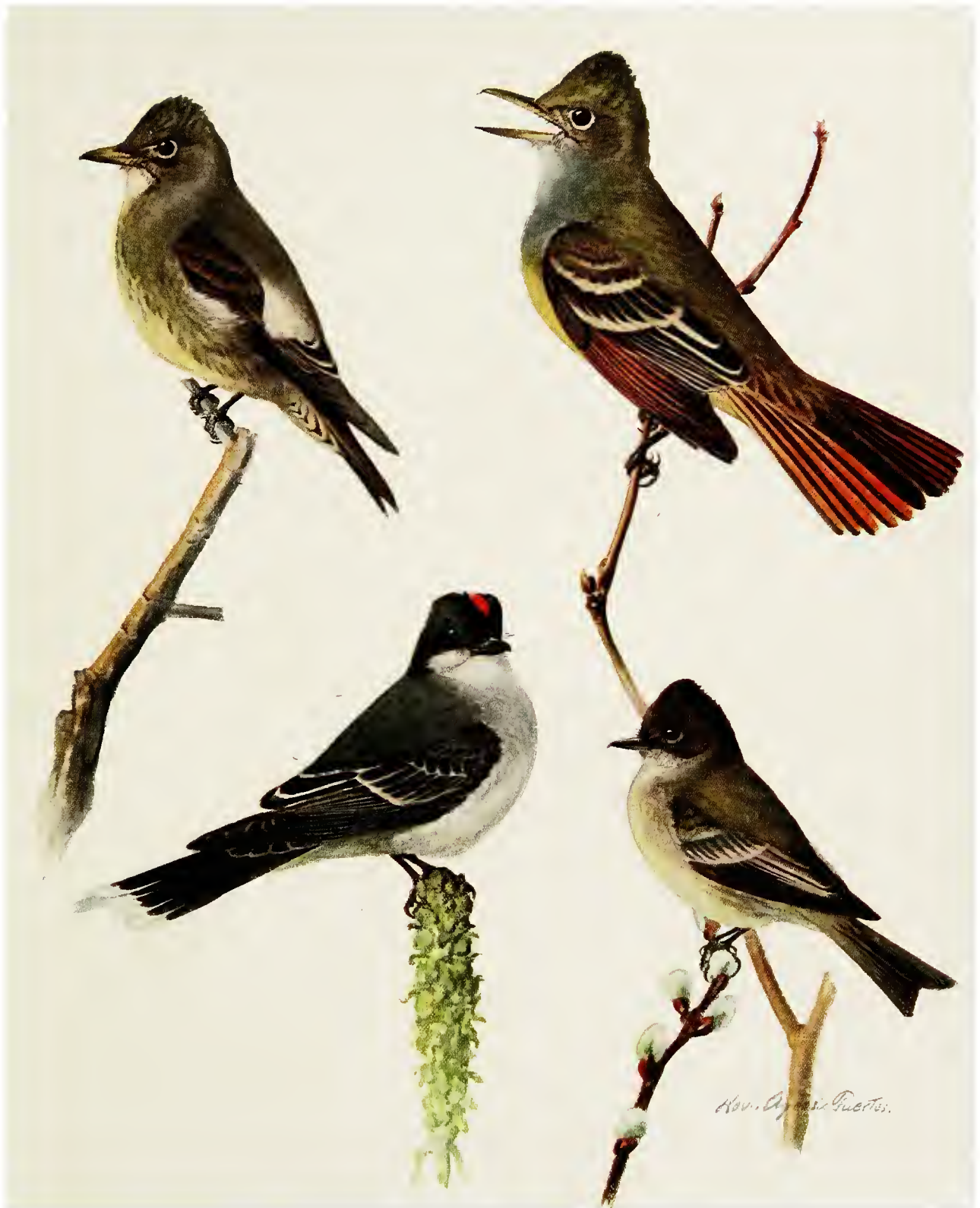
OLIVE-SIDED FLYCATCHER Nuttallornis borealis (Swainson)