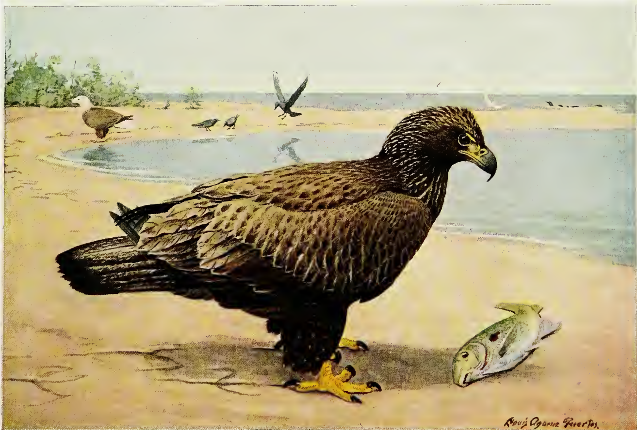
BALD EAGLE Haliaeetus leucocephalus leucocephalus (Linnaeus) IMMATURE ½ nat. size