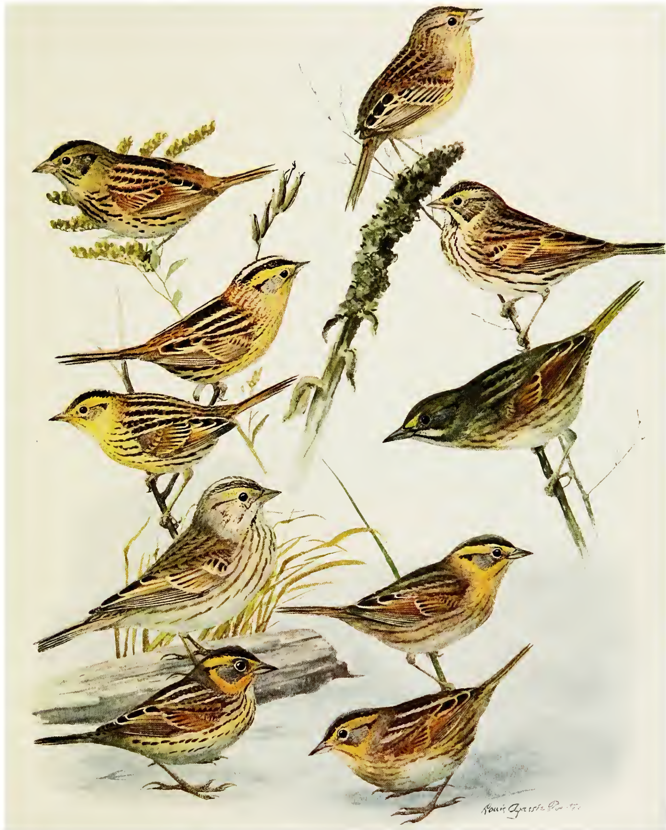
HENSLOW'S SPARROW Passerherbulus henslowi henslowi (Audubon) LECONTE'S SPARROW Passerherbulus lecontei (Audubon) ADULT IMMATURE IPSWICH SPARROW Passerculus princeps Maynard SHARP-TAILED SPARROW Passerherbulus caudaculus (Gmelin)