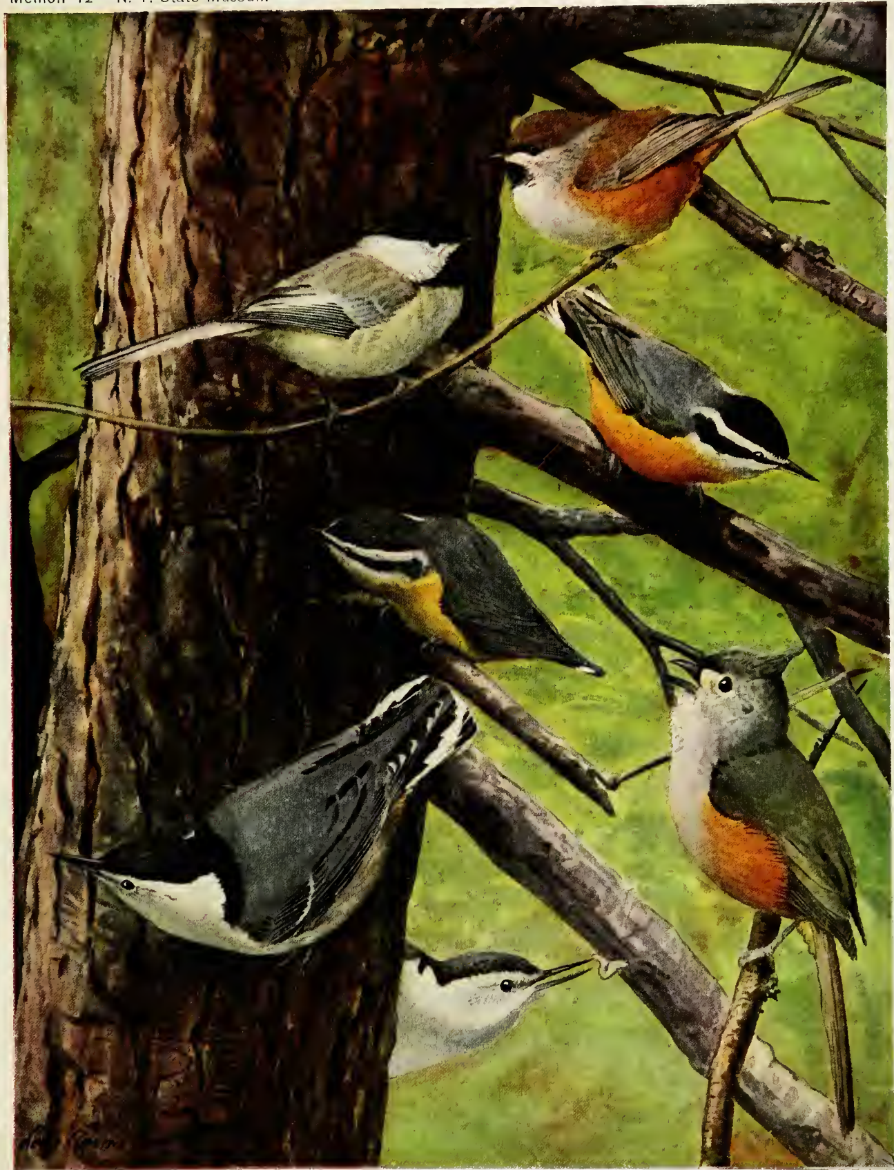
CHICKADEE Penthestes atricapillus atricapillus (Linnaeus) ARCADIAN CHICKADEE Penthestes hudsonicus litoralis (H. Bryant) WHITE-BREASTED NUTHATCH Sitta carolinensis carolinensis Latham RED-BREASTED NUTHATCH Sitta canadensis Linnaeus MALE MALE FEMALE TUFTED TITMOUSE Baeolophus bicolor (Linnaeus) All \frac{1}{2} nat. size