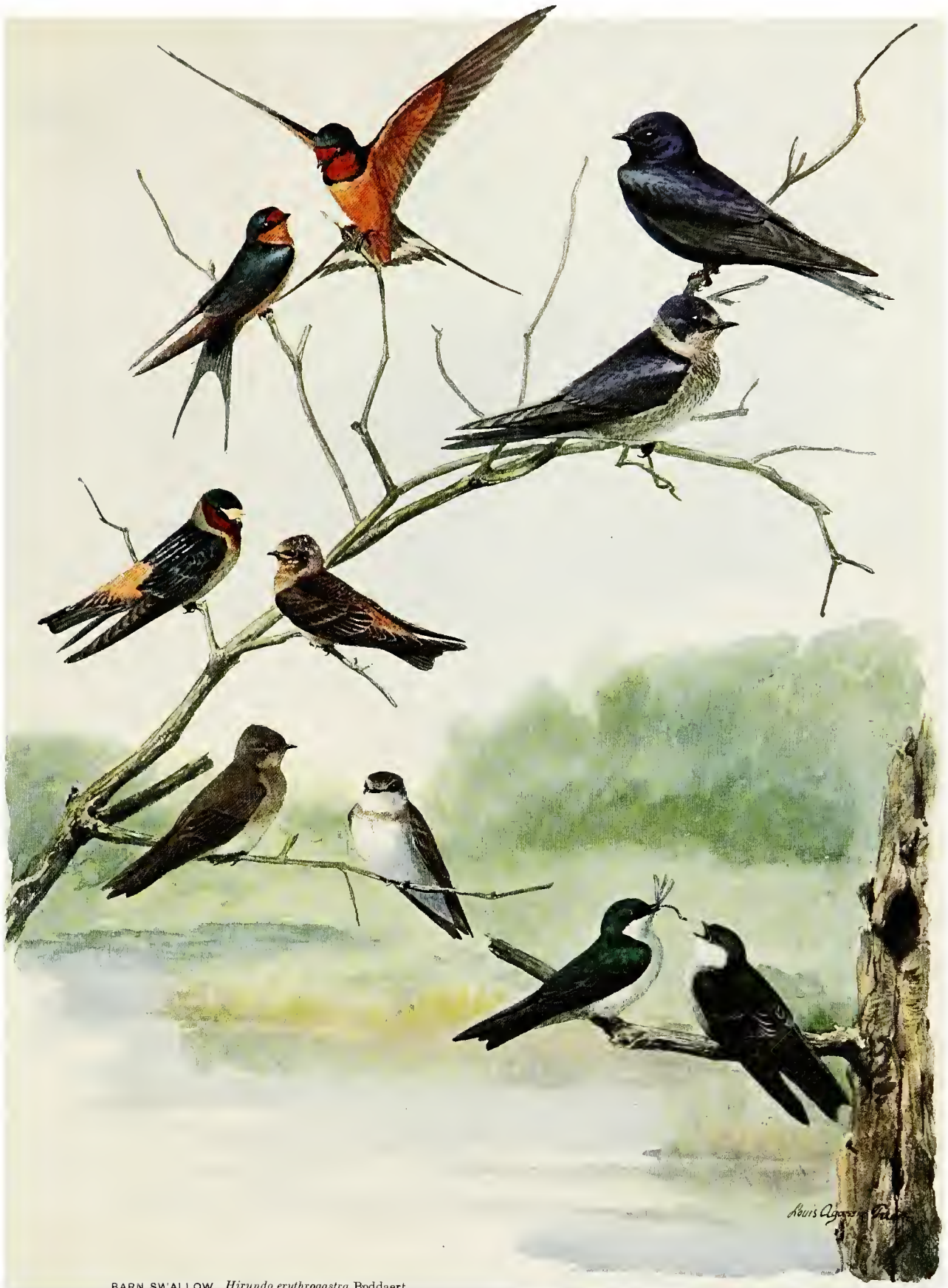
BARN SWALLOW Hirundo erythrogastra Boddaert FEMALE MALE CLIFF SWALLOW Petrochelidon lunifrons lunifrons (Say) ADULT IMMATURE ROUGH-WINGED SWALLOW Stelgidopteryx serripennis (Audubon) BANK SWALLOW Riparia riparia (Linnaeus)