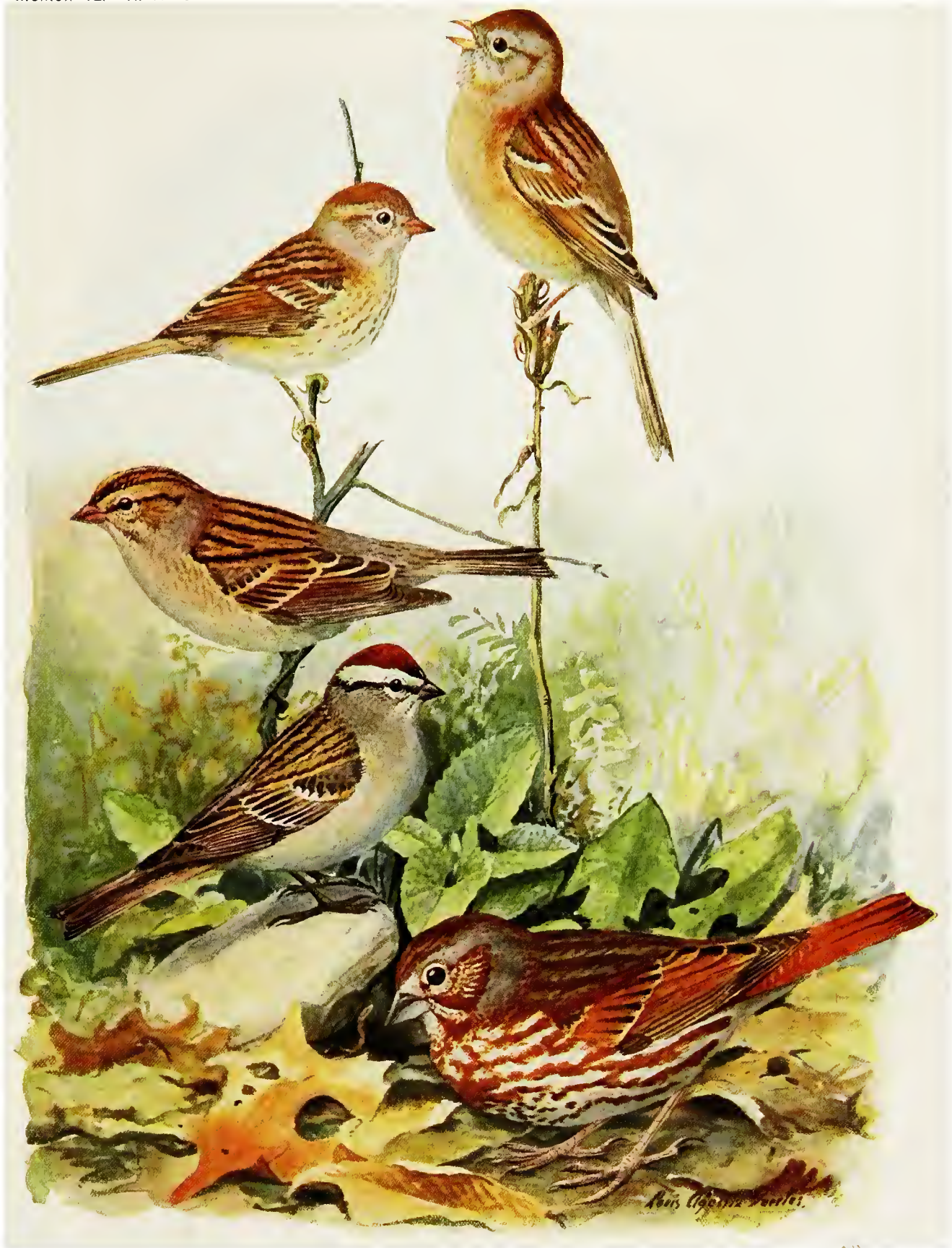
FIELD SPARROW Spizella pusilla pusilla (Wilson) MALE