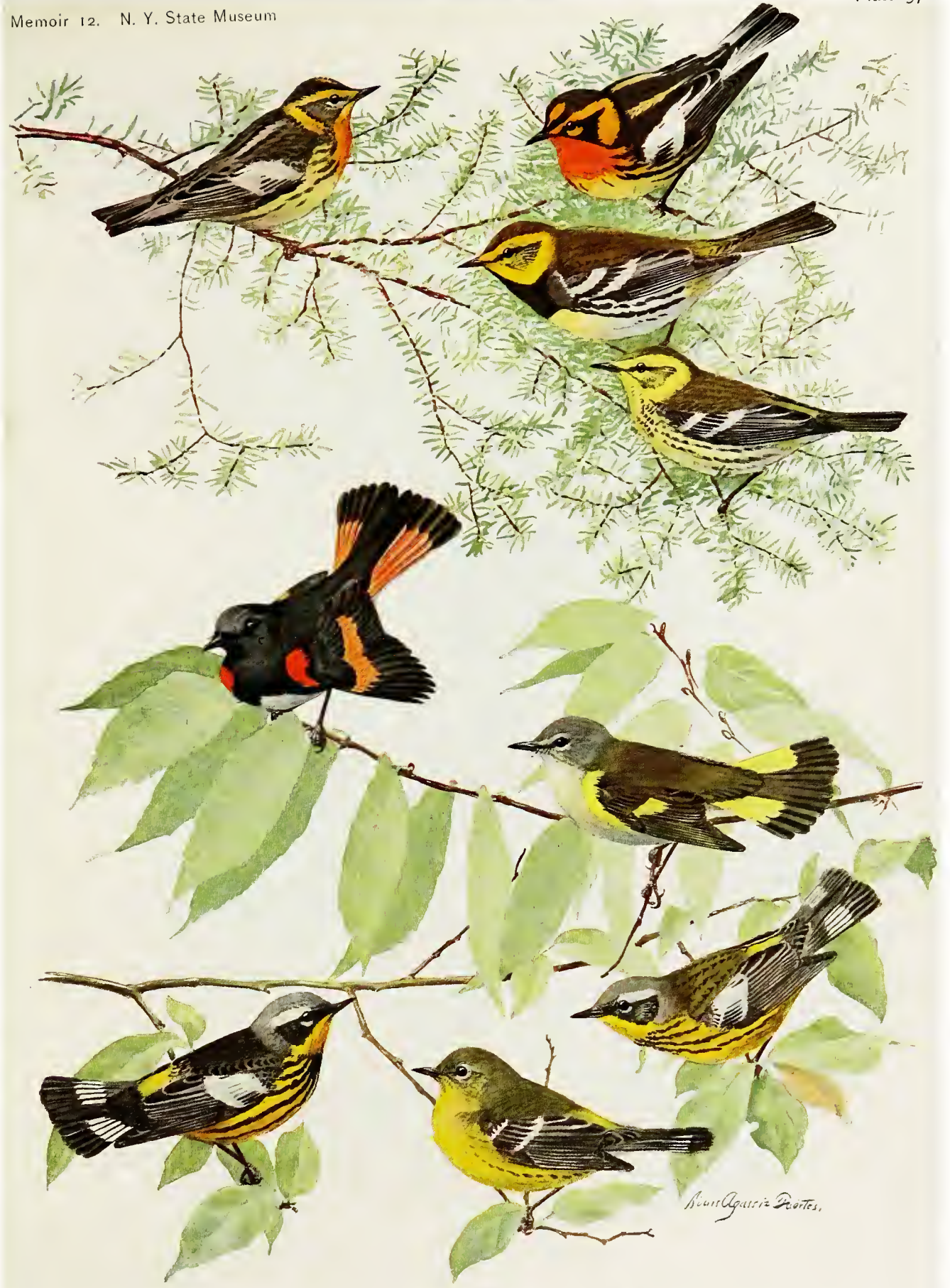
BLACKBURNIAN WARBLER Dendroica fusca (Müller) FEMALE BLACK-THROATED GREEN WARBLER Dendroica virens (Gmelin) MALE REDSTART Setophaga ruticilla (Linnaeus) FEMALE MAGNOLIA WARBLER Dendroica magnolia (Wilson) FEMALE IMMATURE All \frac{1}{3} nat. size FEMALE