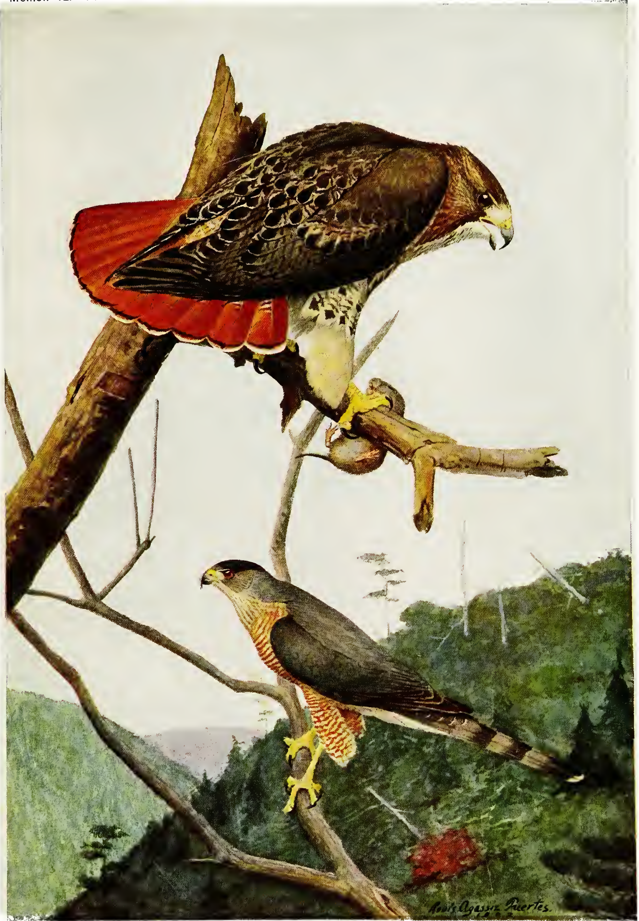
RED-TAILED HAWK Buteo borealis borealis (Gmelin) ADULT COOPER'S HAWK Accipiter cooperi (Bonaparte) ADULT FEMALE 1/2 nat. size