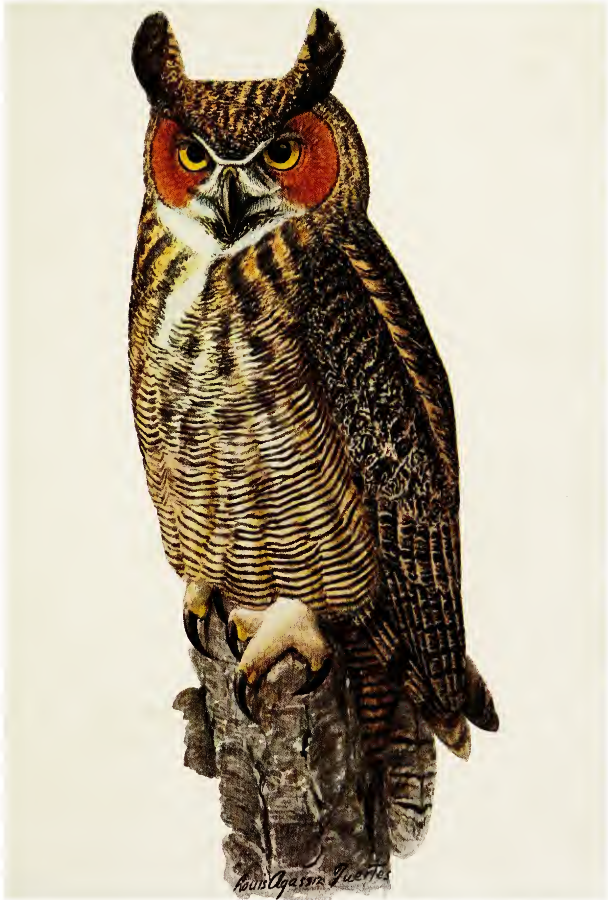
GREAT HORNED OWL Bubo virginianus virginianus (Gmelin) \frac{2}{3} nat. size