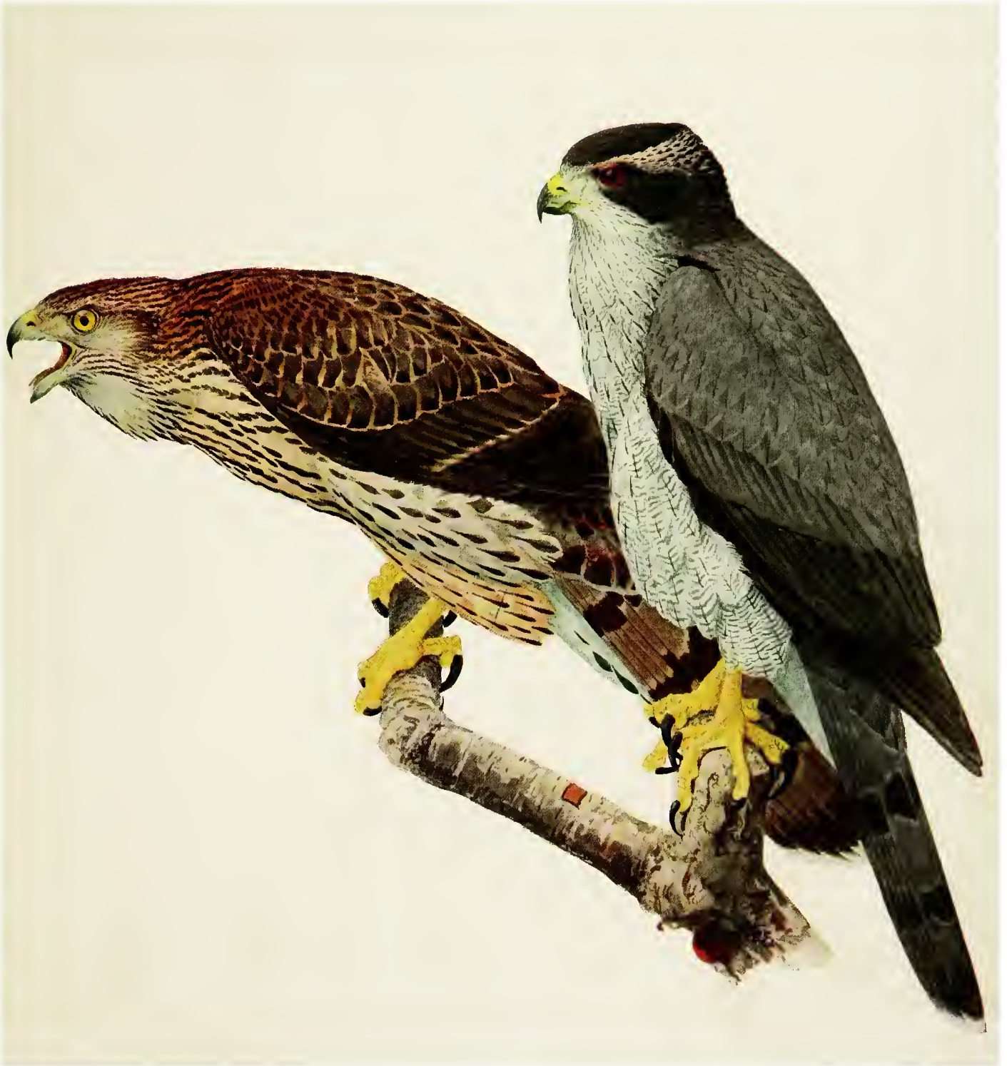
GOSHAWK. Astur atricapillus atricapillus (Wilson) \frac{1}{2} nat. size IMMATURE ADULT