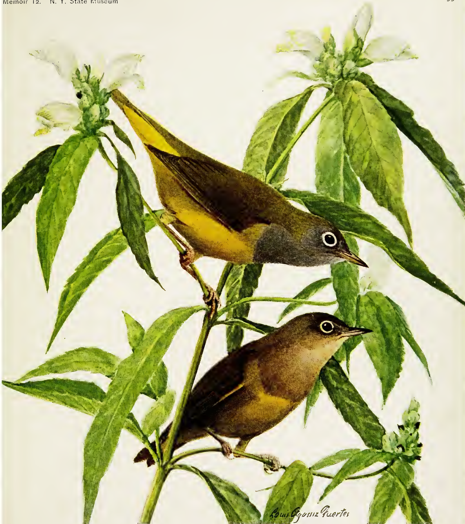
CONNECTICUT WARBLER Oporonis agilis (Wilson) ADULT IMMATURE Life size