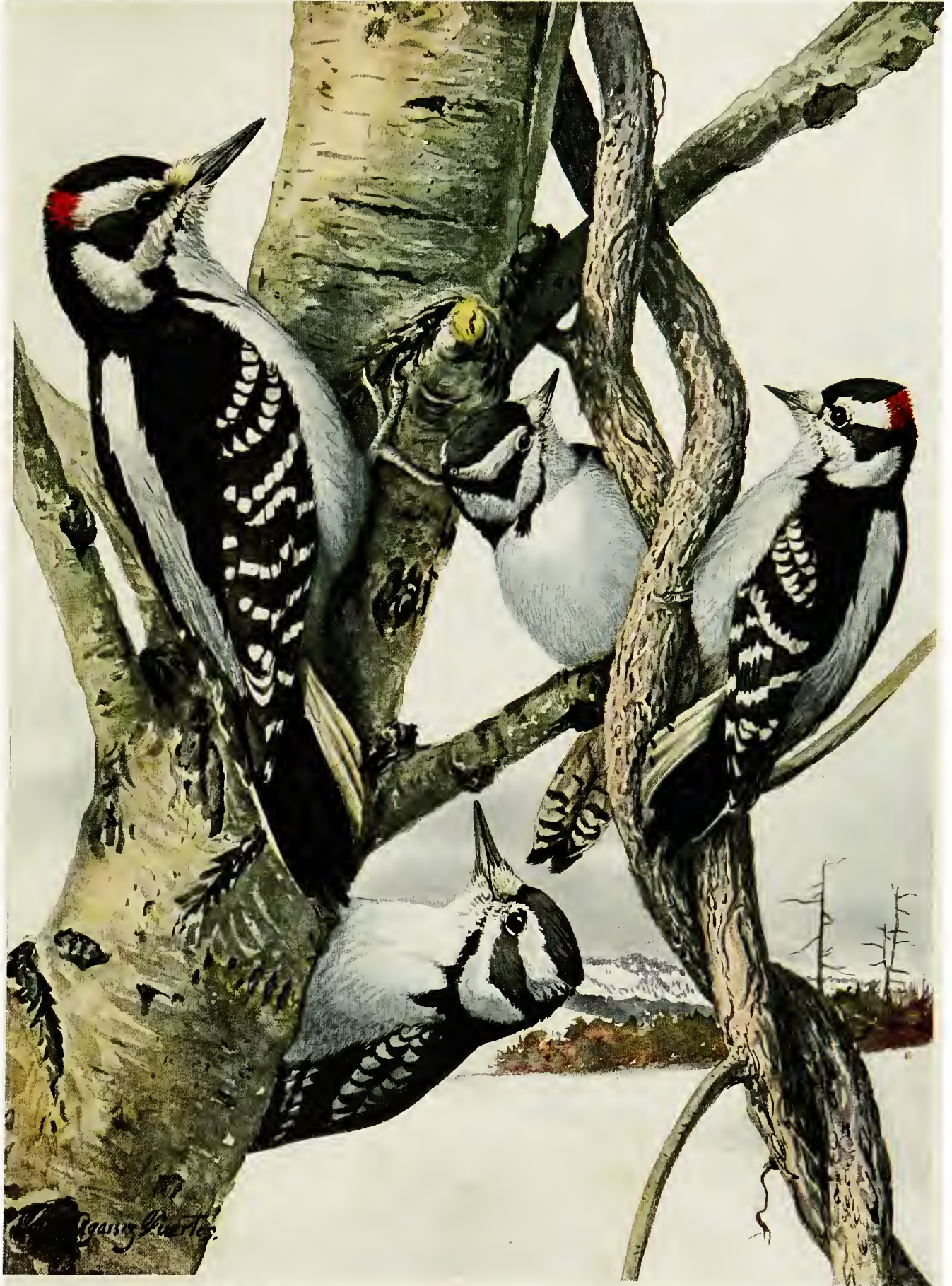
HAIRY WOODPECKER Dryobates villosus villosus (Linnaeus) MALE FEMALE