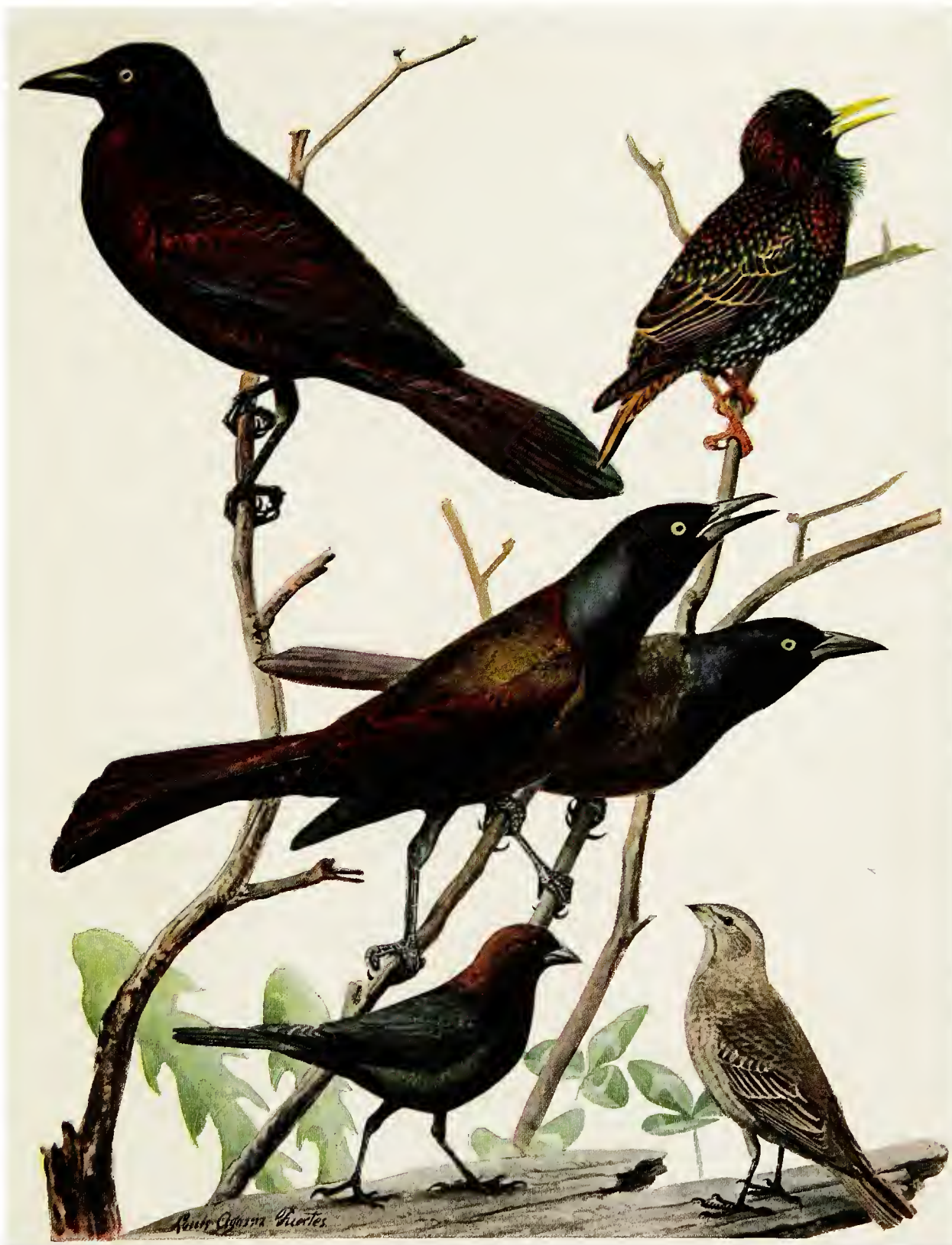
PURPLE GRACKLE Quiscalus quiscula quiscula (Linnaeus)