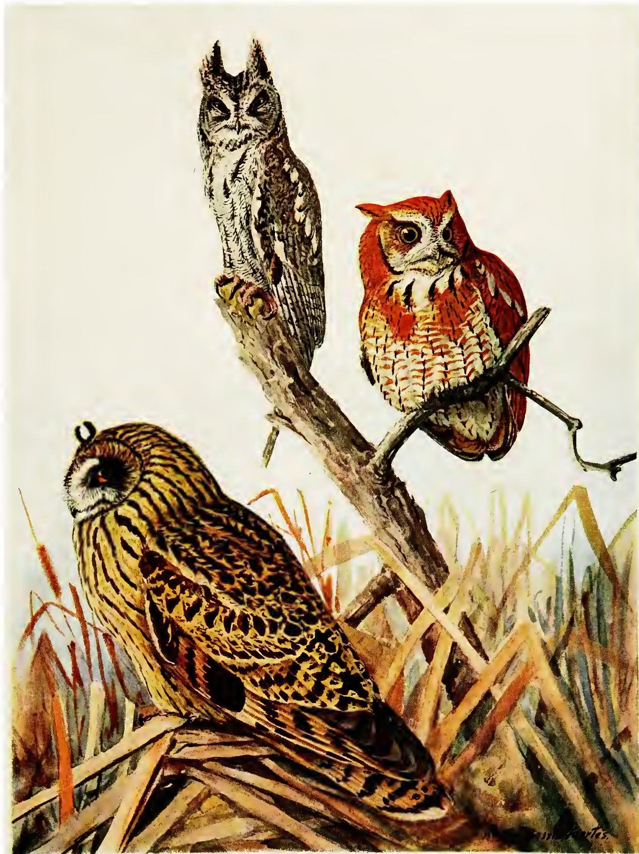
SCREECH OWL Otus asio asio (Linnaeus) Gray and red phases SHORT-EARED OWL Asio flammeus (Pontoppidan) All \frac{1}{2} nat. size