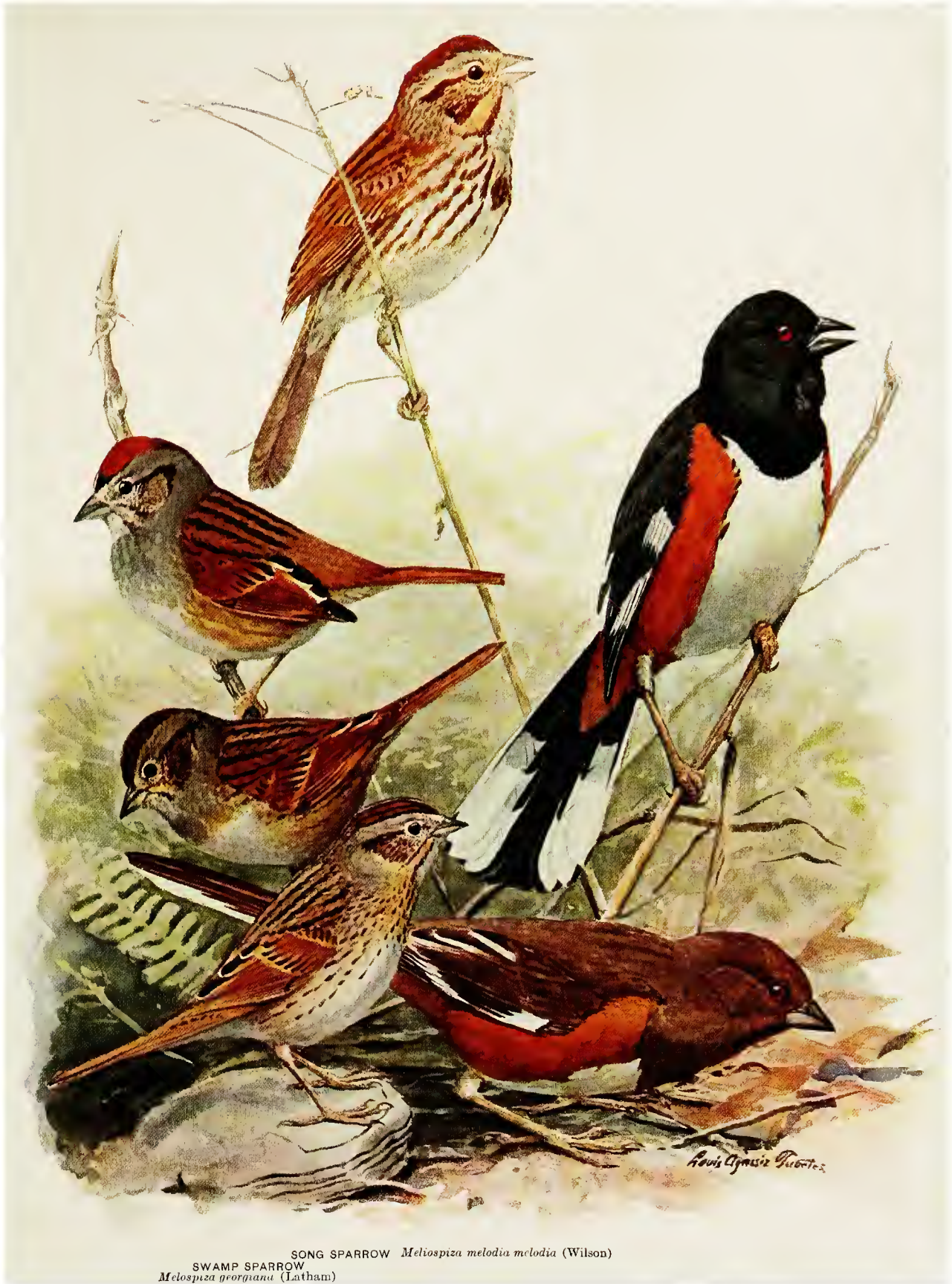
SONG SPARROW Melospiza melodia melodia (Wilson) SWAMP SPARROW Melospiza georgiana (Latham) SPRING AUTUMN LINCOLN'S SPARROW Melospiza lincolni lincolni (Audubon) All \frac{2}{3} nat. size