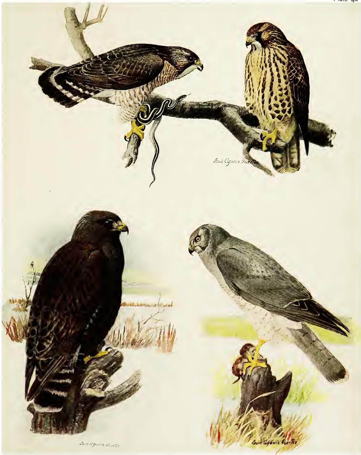
ROUGH-LEGGED HAWK Archibuteo lagopus sancti-johannis (Gmelin) Black phase.