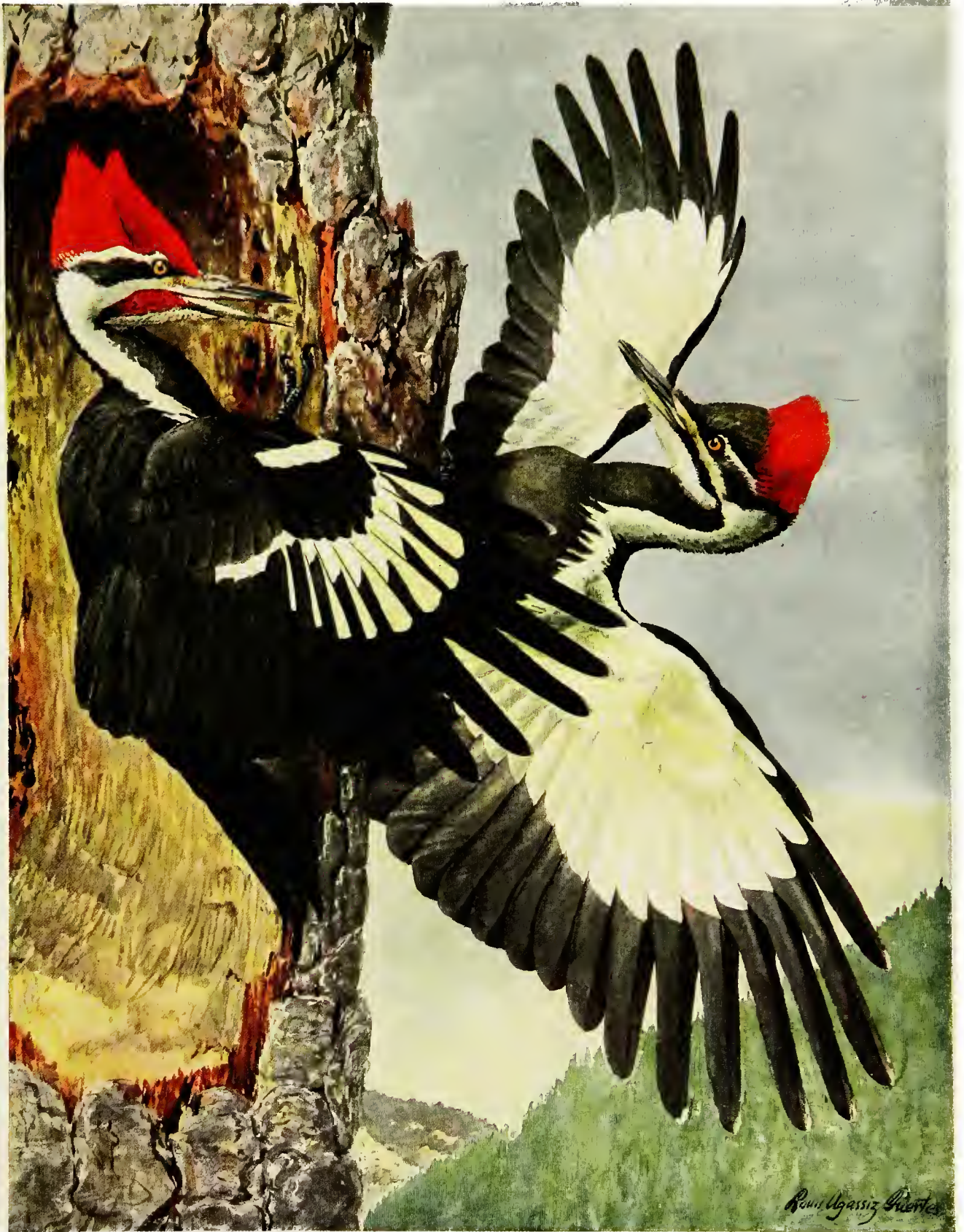
NORTHERN PILEATED WOODPECKER Phloeotomus pileatus abieticola (Bangs) MALE FEMALE About \frac{1}{2} nat. size