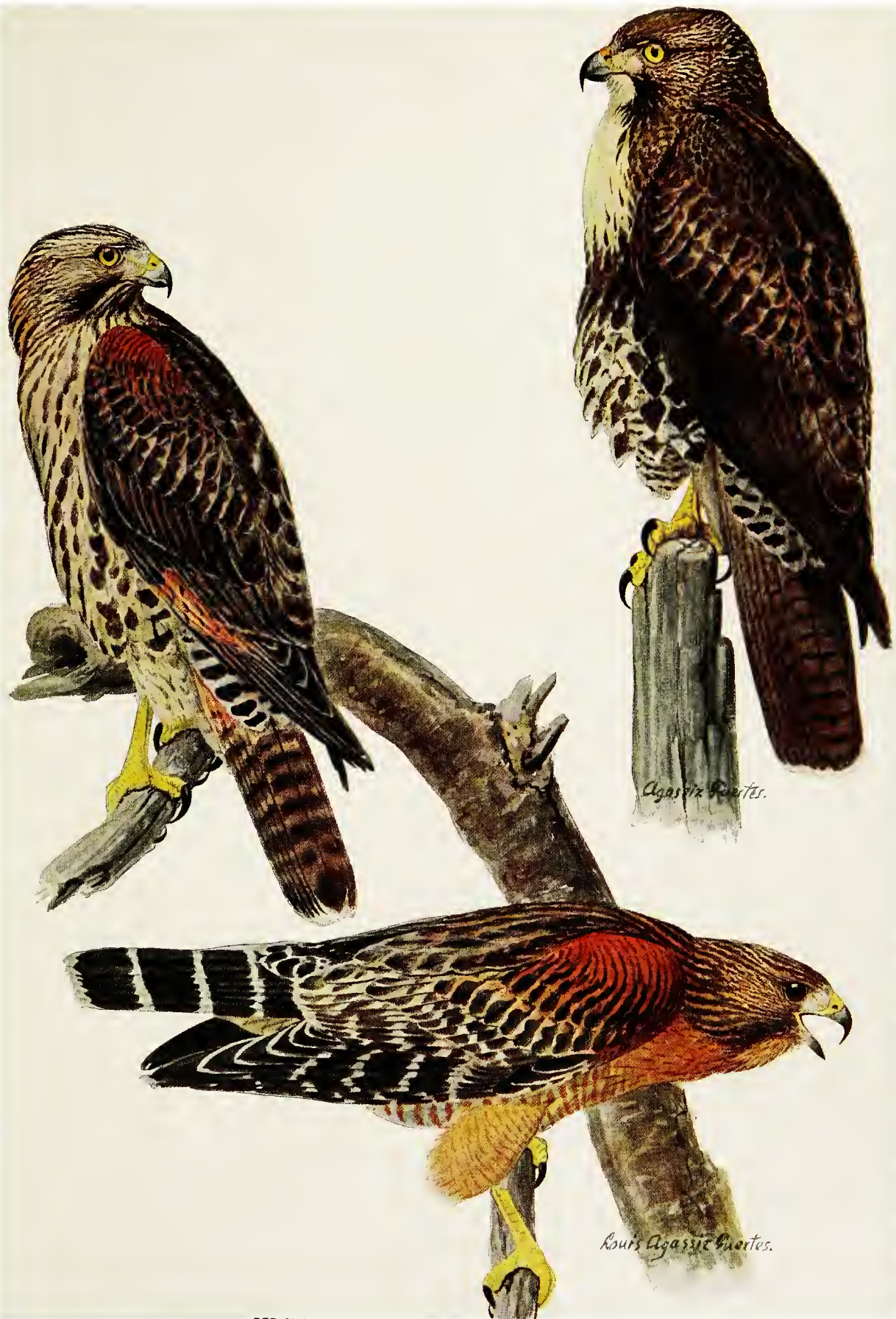
RED-SHOULDERED HAWK Buteo lineatus lineatus (Gmelin) IMMATURE ADULT All \frac{1}{3} nat. size