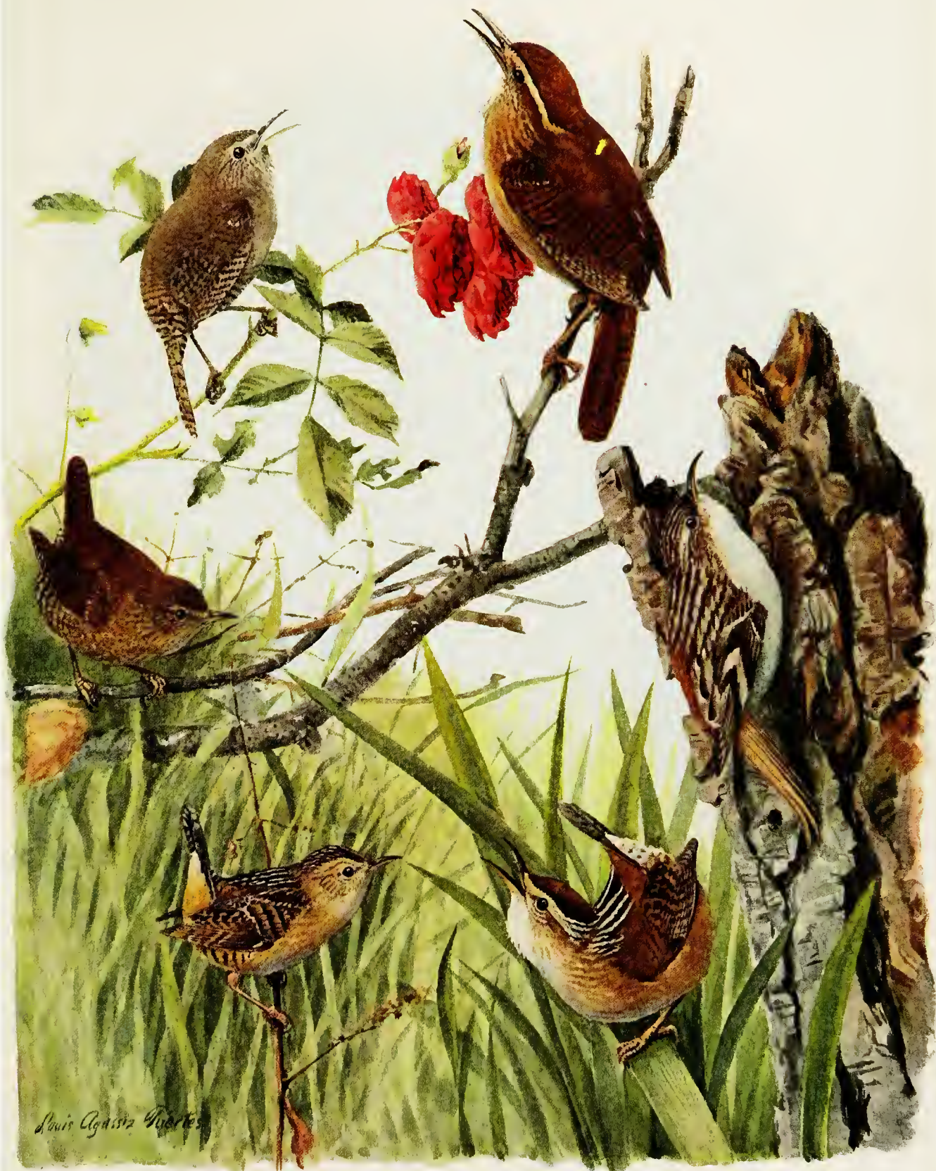
HOUSE WREN Troglodytes aedon aedon Vieillot