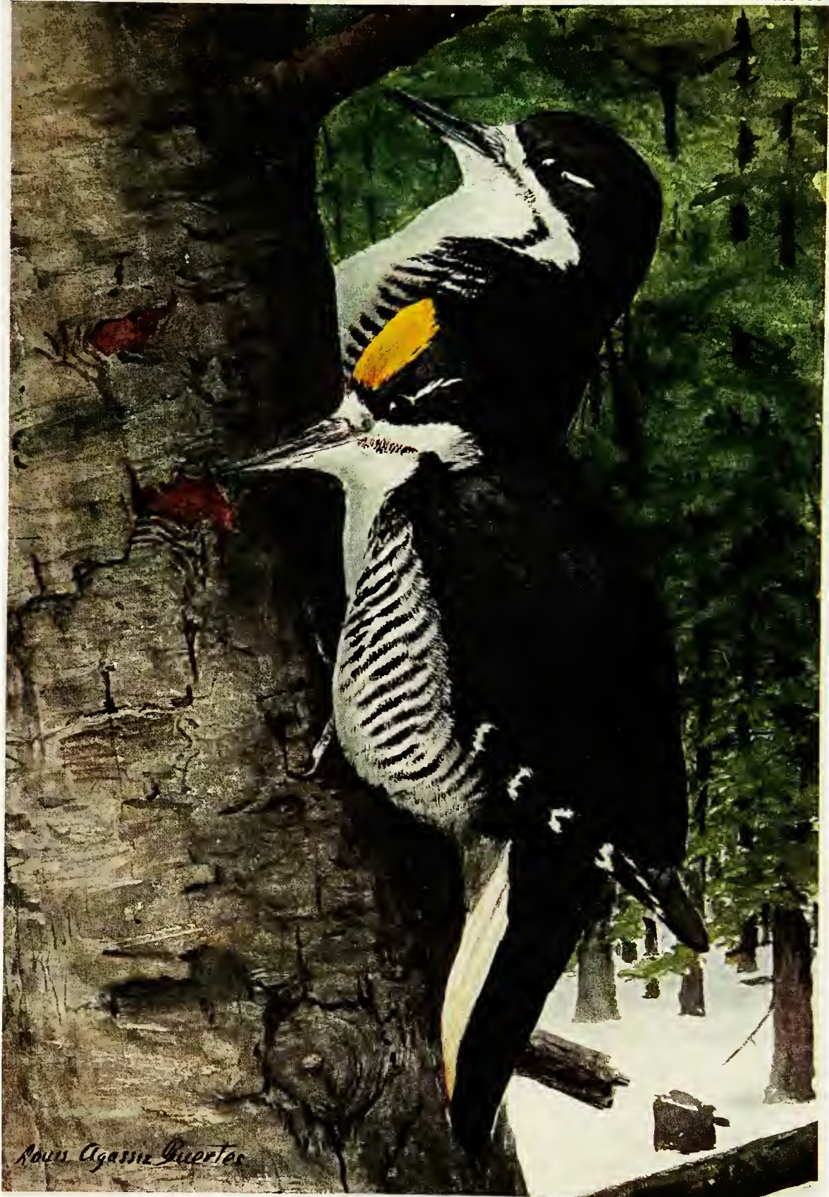
ARCTIC THREE-TOED WOODPECKER Picoides arcticus (Swainson) FEMALE MALE ‡ nat. size