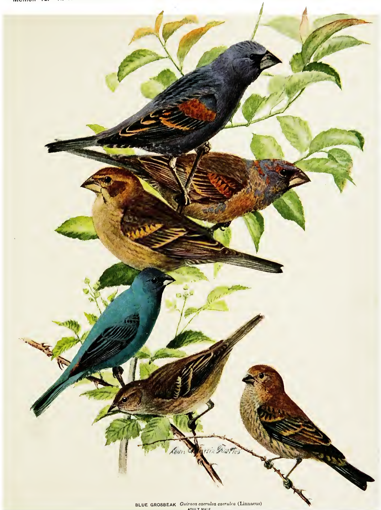
BLUE GROSBEEK Quiraca caerulea caerulea (Linnaeus) ADULT MALE