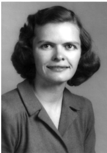
Fig. D.4: Julia Robinson

Robinson was depressed for a long time, but eventually decided to continue studying mathematics. She returned to Berkeley and completed her PhD in 1948 under the supervision of Alfred Tarski. The first-order theory of the real numbers had been shown to be decidable by Tarski, and from Gödel's work it followed that the first-order theory of the natural numbers is undecidable. It was a major open problem whether the first-order theory of the rationals is decidable or not. In her thesis (1949), Robinson proved that it was not.