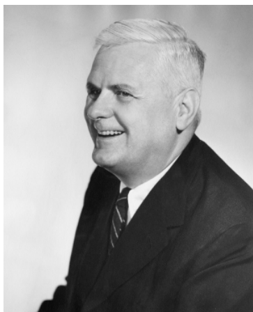
Fig. D.1: Alonzo Church

Church's academic achievements were great. Together with his students Stephen Kleene and Barkley Rosser, he developed