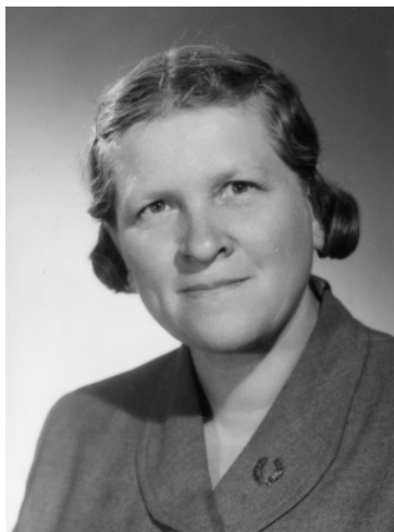
Fig. D.3: Rózsa Péter

Despite the importance and influence of her work, Péter did not obtain a full-time teaching position until 1945. During the Nazi occupation of Hungary during World War II, Péter was not allowed to teach due to anti-Semitic laws. In 1944 the government created a Jewish ghetto in Budapest; the ghetto was cut off from the rest of the city and attended by armed guards. Péter was