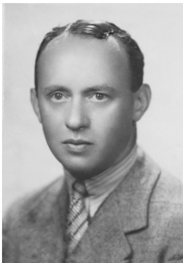
Fig. D.5: Alfred Tarski

Before emigrating to the United States in 1939, Tarski completed some of his most important work while working as a secondary school teacher in Warsaw. His work on logical consequence and logical truth were written during this time. In 1939, Tarski was visiting the United States for a lecture tour. During his visit, Germany invaded Poland, and because of his Jewish heritage, Tarski could not return. His wife and children remained in Poland until the end of the war, but were then able to emigrate to the United States as well. Tarski taught at Harvard, the College of the City of New York, and the Institute for Advanced Study at Princeton, and finally the University of California, Berkeley.