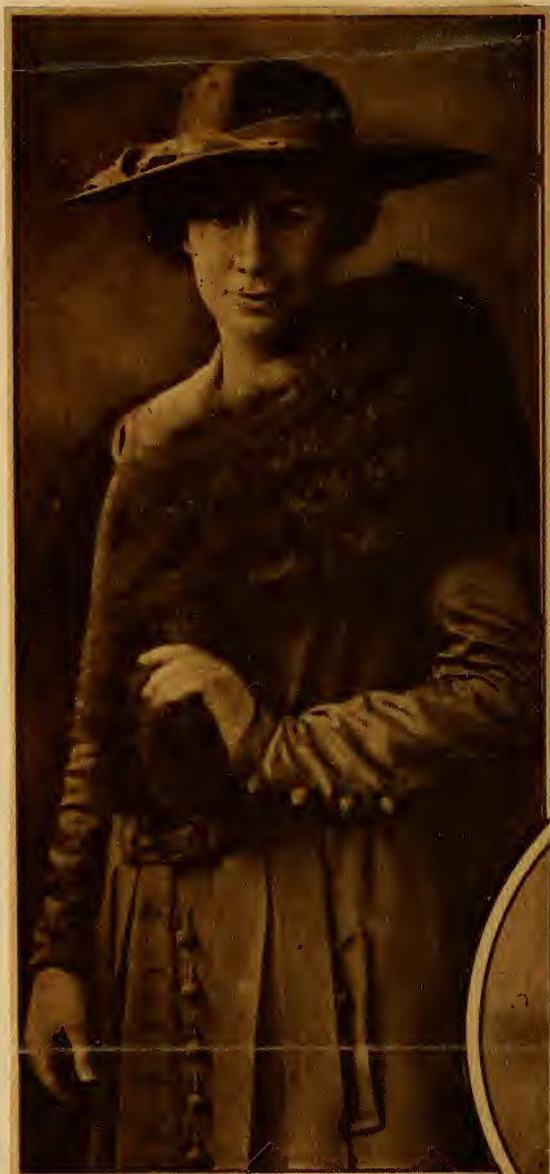
MISS SARAH TEASDALE, To Whom Was Awarded by Columbia University the Pulitzer Prize of $500 for the Best Book of Poetry by an American Published in 1917.