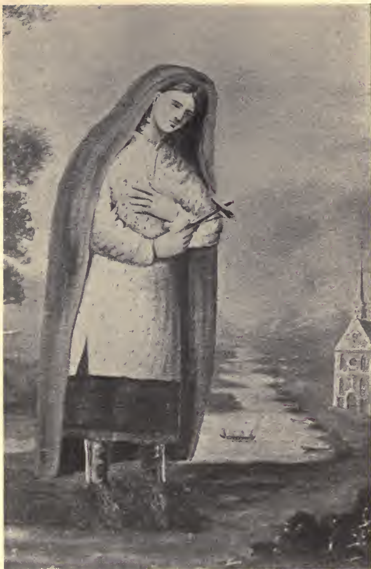
CATHERINE TEGAKWITA, THE LILY OF THE MOHAWKS.