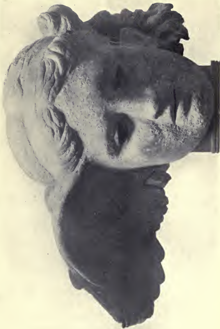
BRONZE HEAD FROM A FIGURE OF "THE SLEEP-GOD" School of Praxiteles, Fourth Century B.C. British Museum