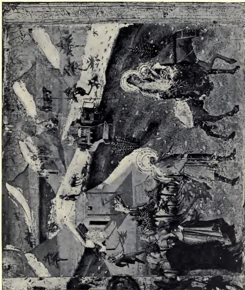
THE FLIGHT INTO EGYPT From the picture by Giovanni di Paolo, Siena