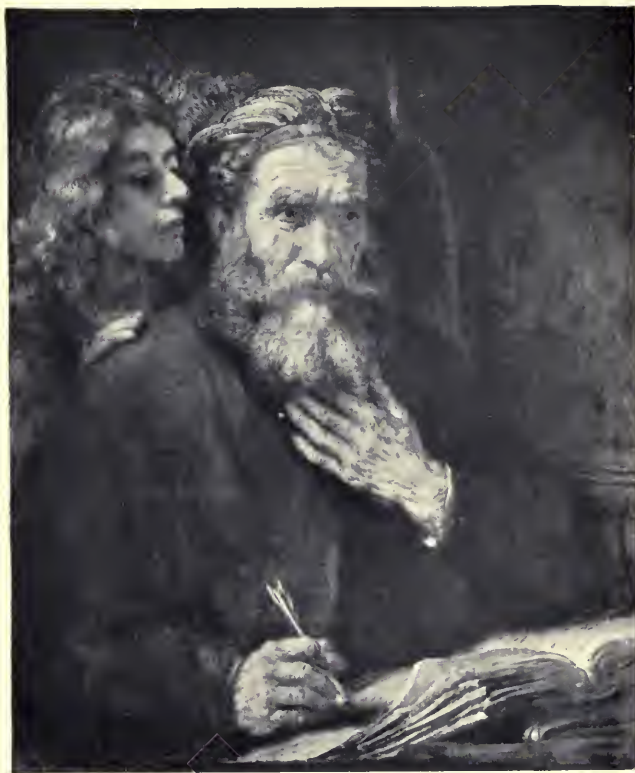
ST. MATTHEW INSPIRED BY AN ANGEL

From the picture by Rembrandt in the Louvre