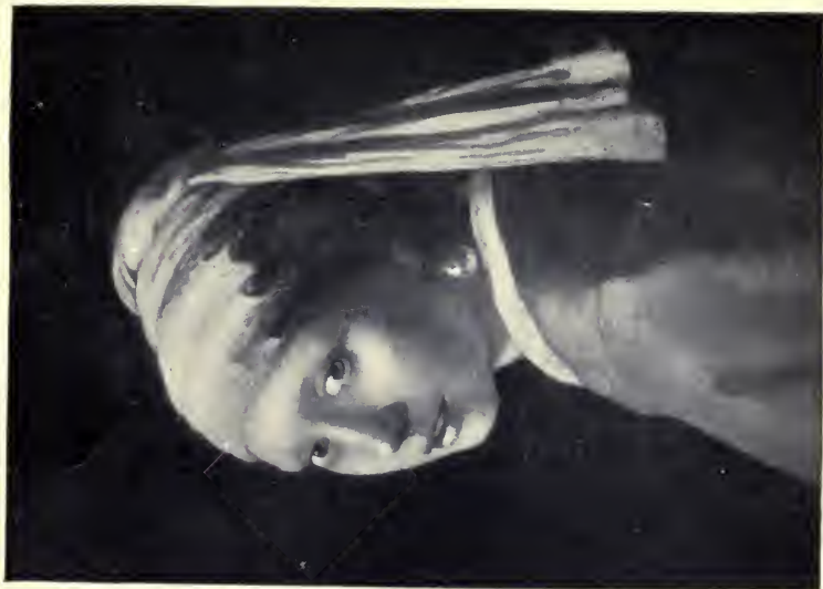
POTRAIT OF A YOUNG GIRL By Vermeer of Delft. Mauritshaus, The Hague