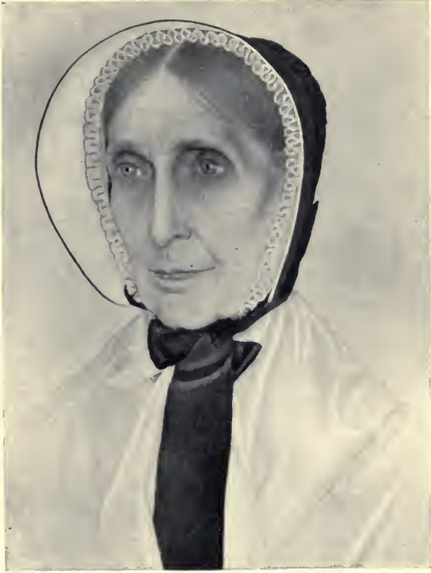
A QUAKER LADY