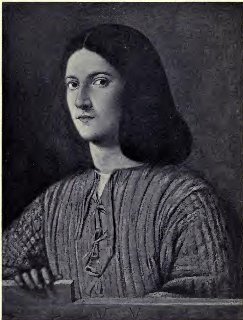
PORTRAIT OF A MAN