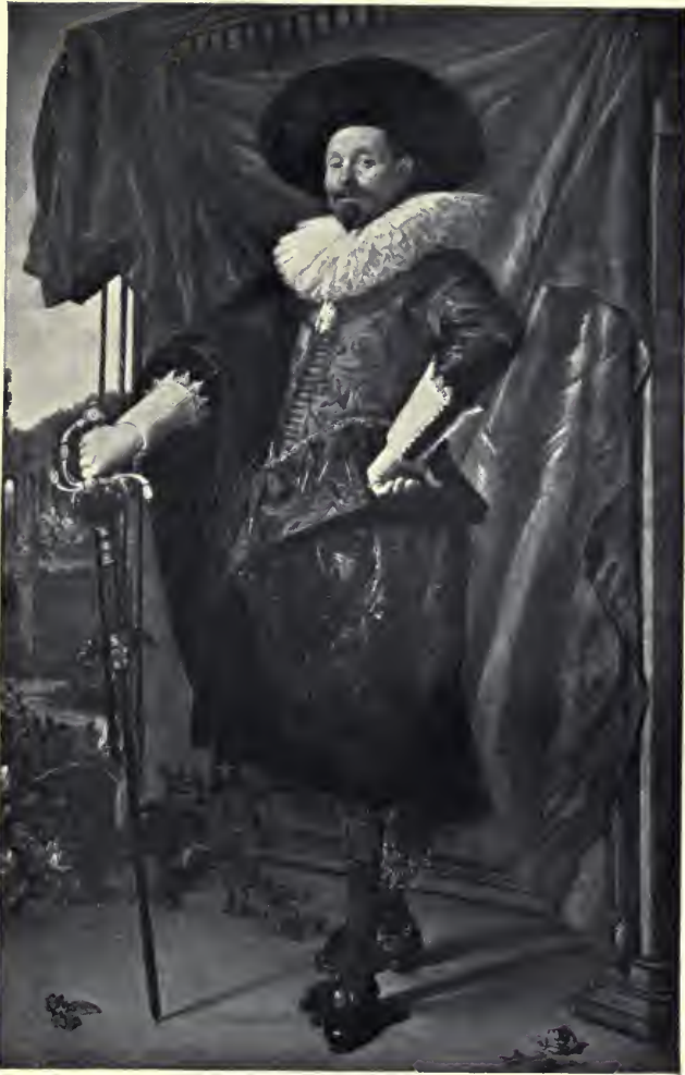
WILLEM VAN HEYTHUYSEN