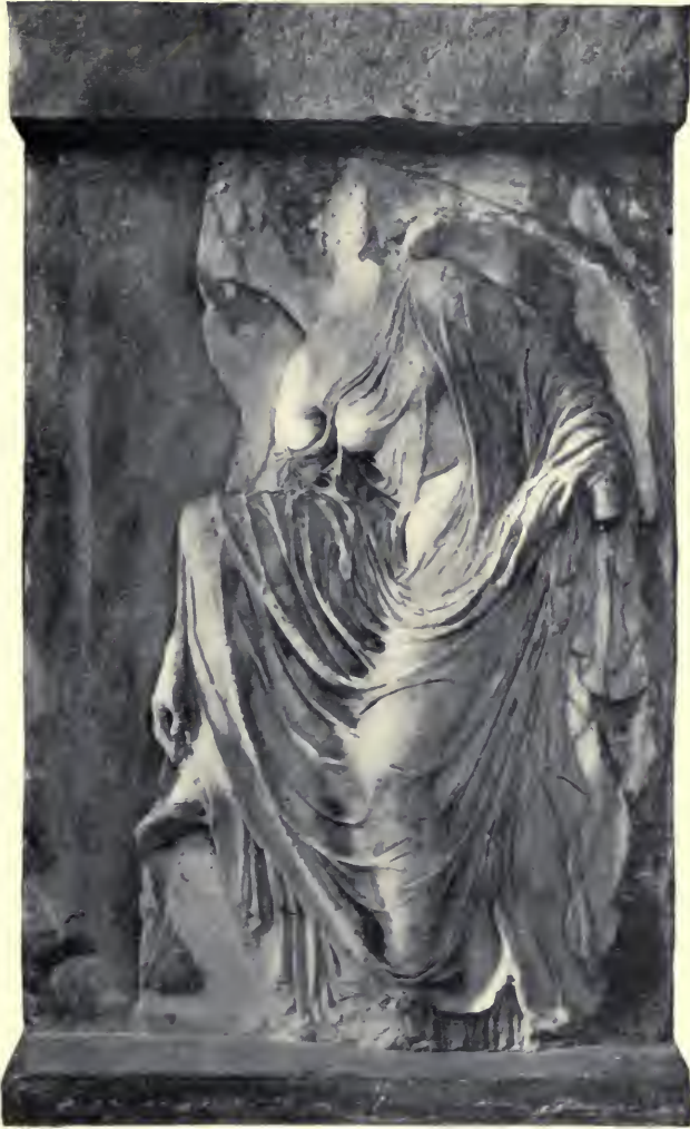
VICTORY TYING HER SANDAL

From the balustrade of the Temple of the Wingless Victory, Athens