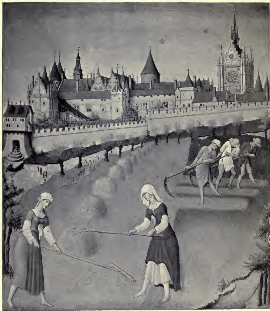
JUNE (LE PALAIS ET LA SAINTE CHAPELLE)