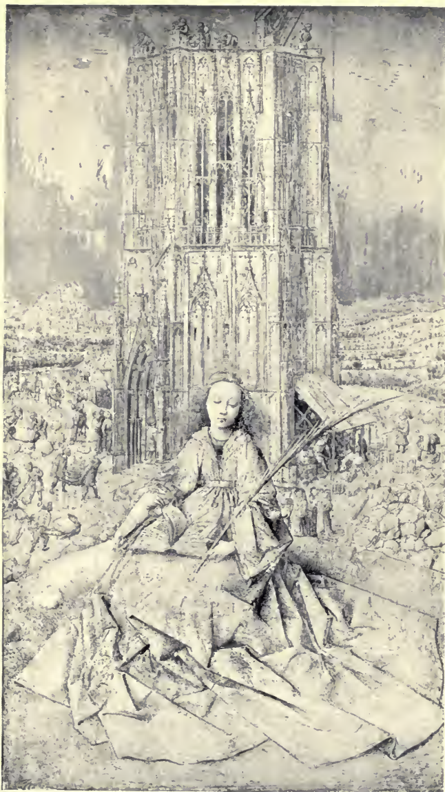
ST. BARBARA BEFORE A GOTHIC CATHEDRAL

From the water-colour by Jan Van Eyck, Antwerp