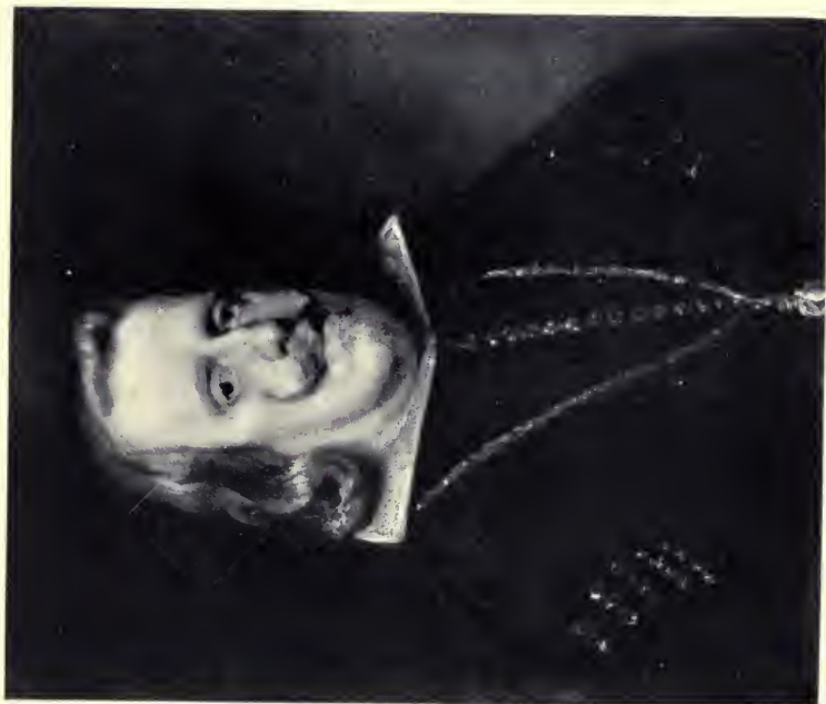
PHILIP IV. By Velasquez. National Gallery, London