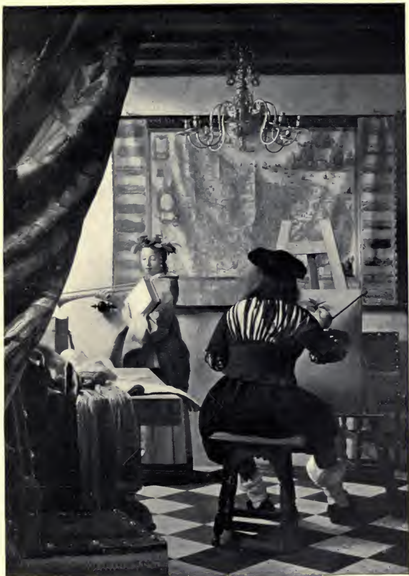
VERMEER OF DELFT IN HIS STUDIO

Painted by himself, Czernin Gallery, Vienna