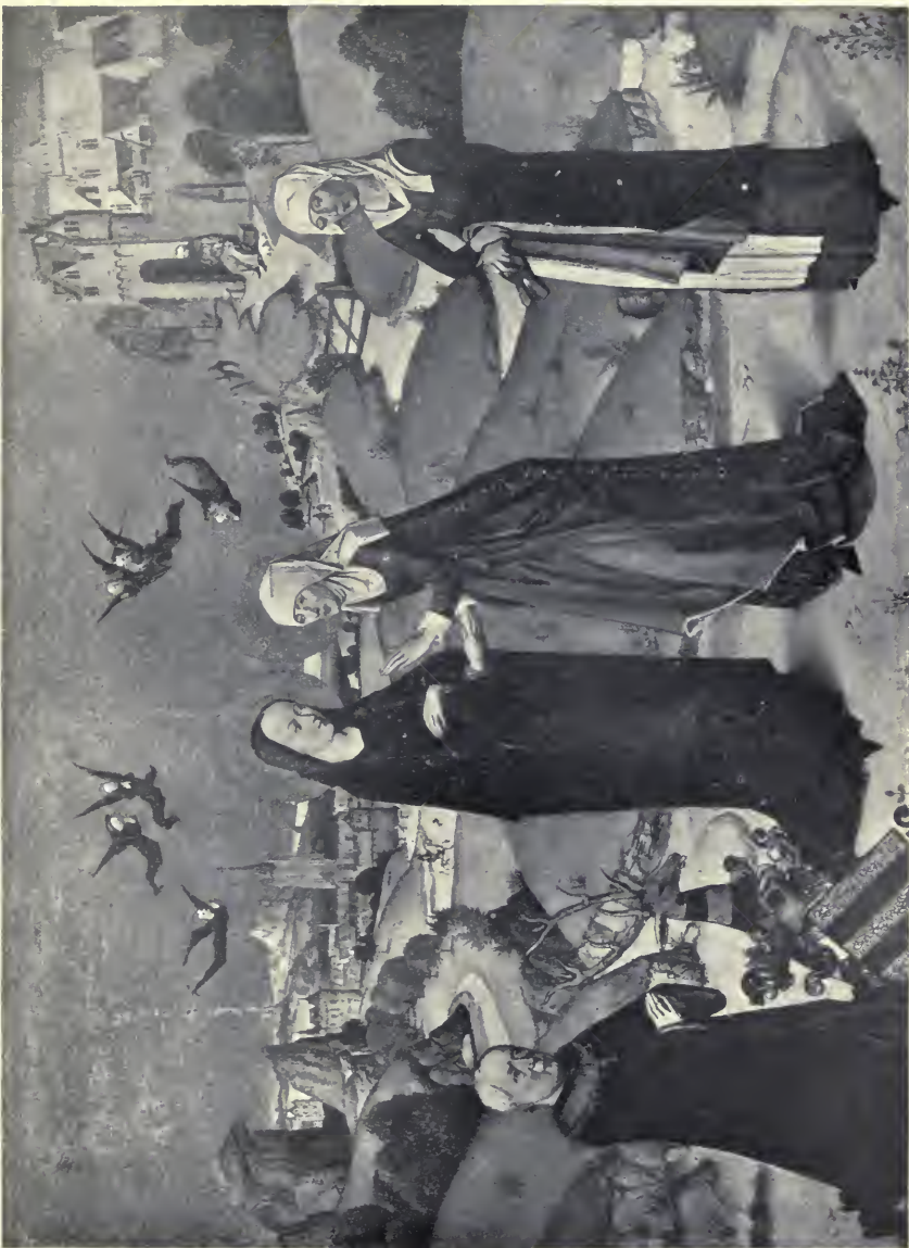
THE VISITATION By the Master of "The Life of Mary," Pinakothek, Munich