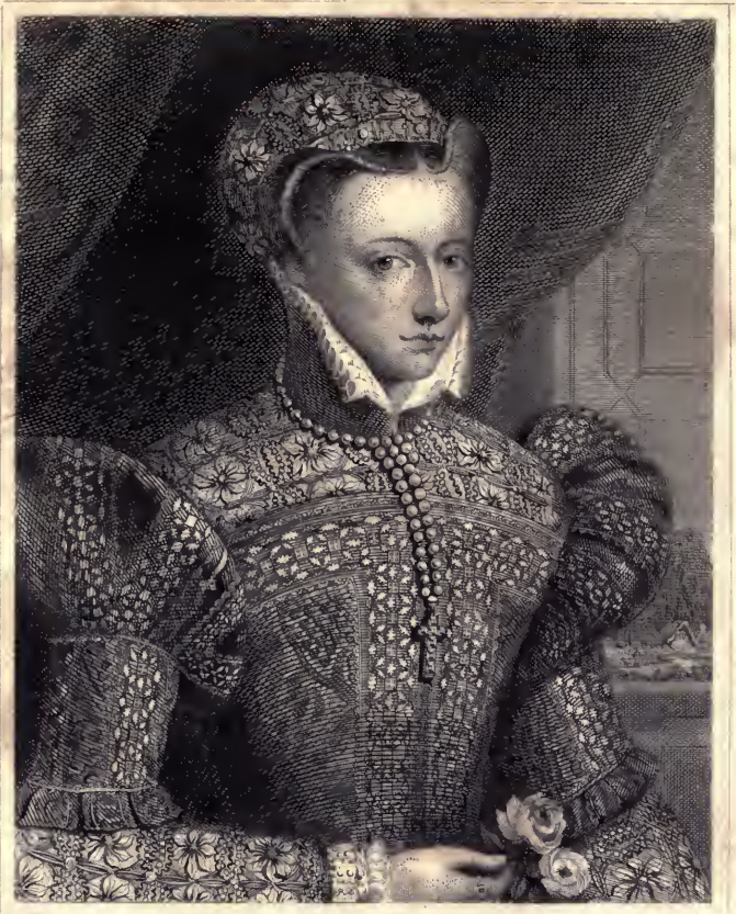
F. Zucchi del.