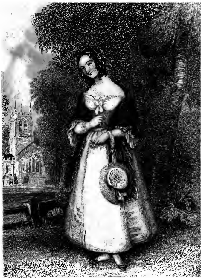
The School of Music.