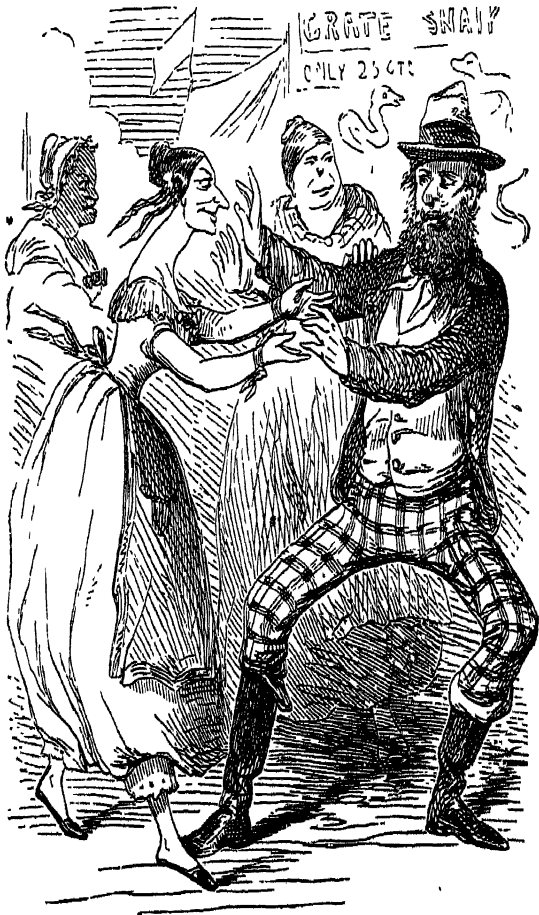
"OH STAY, SIR, STAY!" SED A TALL GAWNT FEMAIL. [See Page 101.]