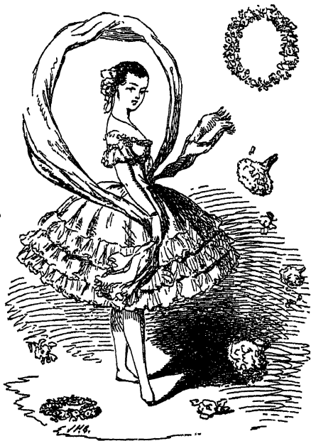
ONE OF THE BROADWAY "SEVEN SISTERS." [See Page 242.]