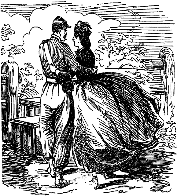
"HOME GUARD DRILL." [See Page 241.]