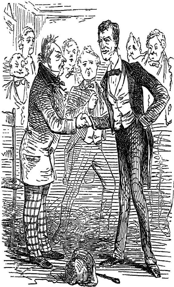
AN INTERVIEW WITH PRESIDENT LINCOLN. [See Page 186.]