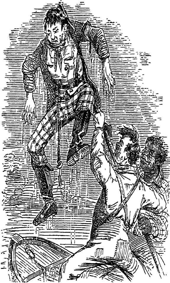
ARTEMUS' RESCUE FROM THE KANAWL. [See Page 128.]