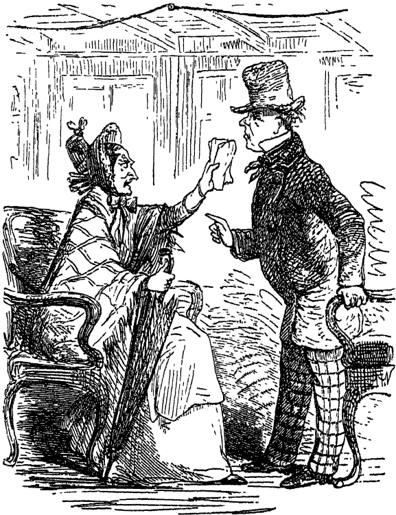
"DON'T SPEAR ME AGEN, IF YOU PLEASE." [See Page 50.]