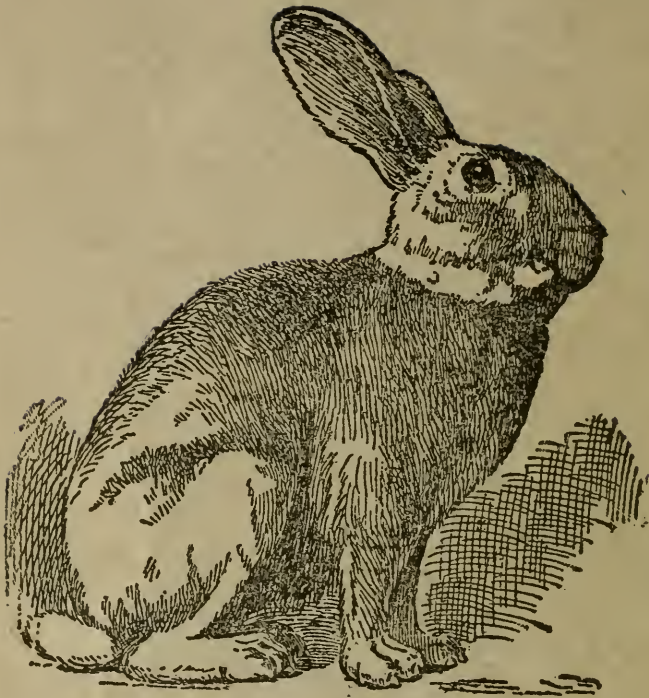
KING TODDIE AT EIGHT MONTHS.