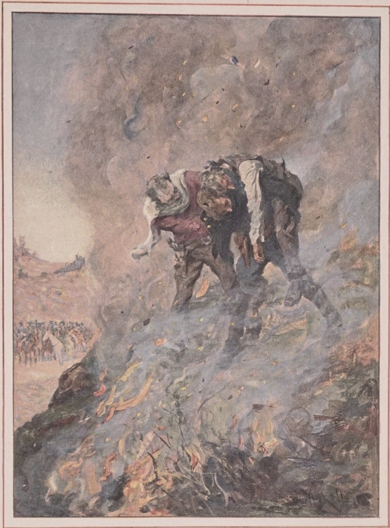
TOGETHER THEY BORE HIM, NOW UNCONSCIOUS, SLOWLY DOWN BELOW THE FIRST FIRE-LINE.