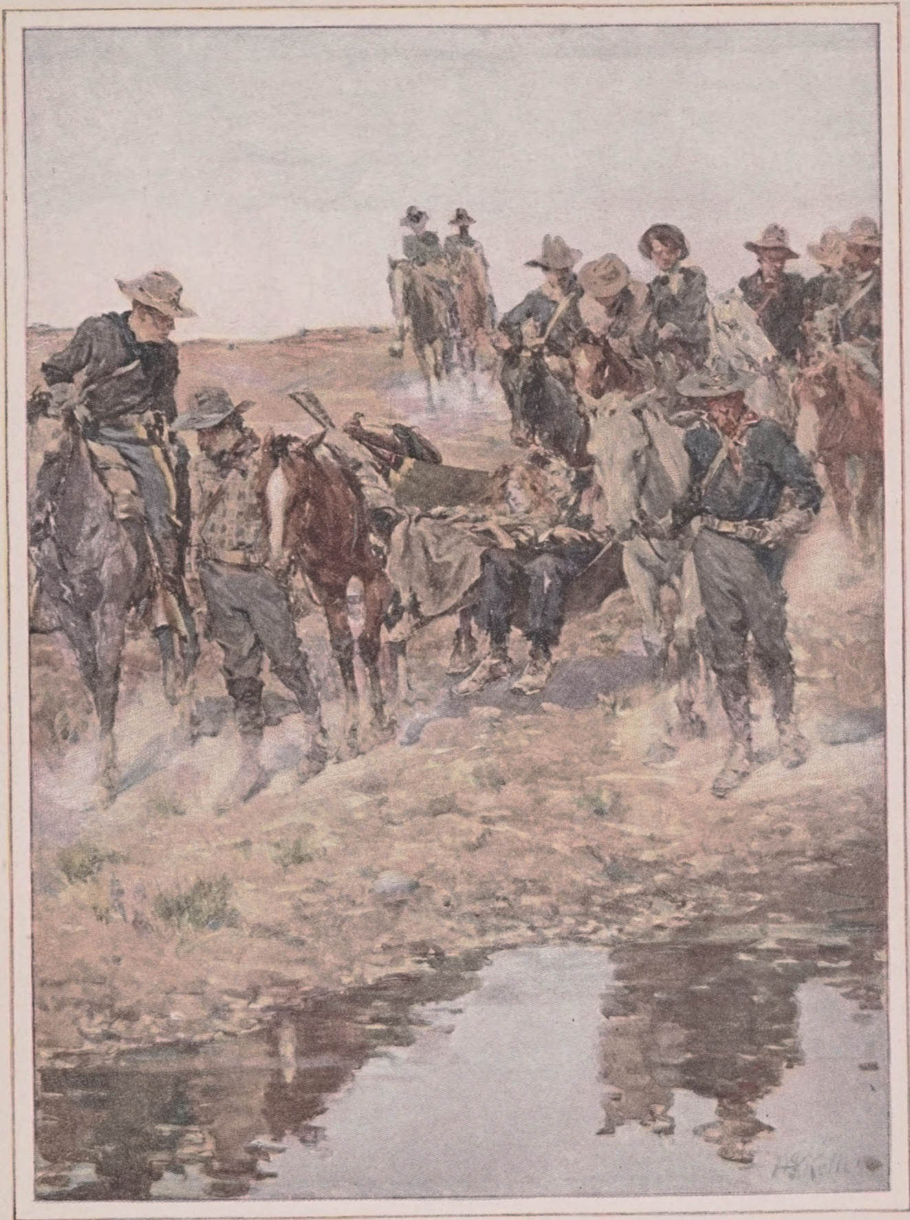
THEY ADVANCED SLOWLY, THE SUPPORTING BLANKETS SWAYING GENTLY TO THE MEASURED TREAD.