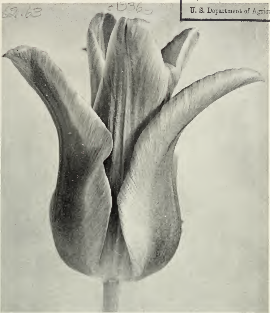
LILY-FLOWERING TULIP SIRENE

LIBRARY OCT 27 1938 U. S. Department of Agriculture