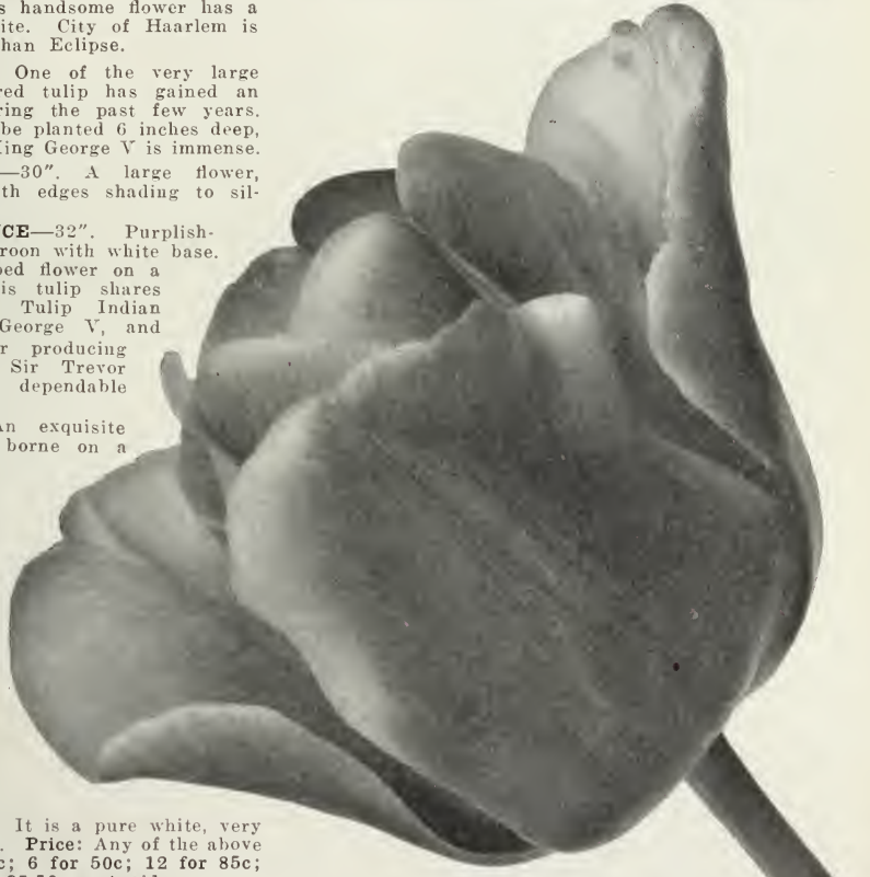
Darwin Tulip—City of Haarlem

Price: Above five varieties Breeder Tulips: 3 bulbs 25c; 6 for 45c; 12 for 75c; 25 for $1.35; 100 for $4.75, postpaid.