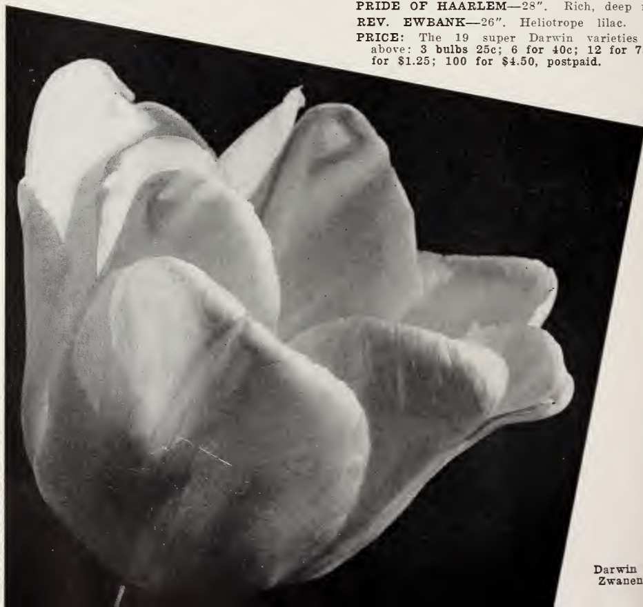
Darwin Tulip Zwanenburg

AFTERGLOW —30". Rosy orange, salmon edges. ANTON MAUVE —30". An enormous cupshaped flower, clear violet turning to silvery lilac at the edges. BARONNE DE LA TONNAYE —28". Rose shaded bluish. BARTIGON —26". Fiery red, good forcer. CENTENAIRE —28". Deep rose flushed claret. CLARA BUTT —26". Soft salmon rose. FARNCOMBE SANDERS —28". Beautiful clear scarlet. FAUST —28". Purple maroon nearly black, enormous flower. GIANT —30". Deep reddish-purple shaded violet. The base is white with blue markings. A very large flower, good color, texture, form, strong tall stem. KING HAROLD —28". Deep crimson maroon. LA FINANCE —30". Rosy mauve, edges light pink. MELICETTE —28". A rare shade of lavender. The inside of the flower is violet and the base blue. MRS. KRELAGE —28". Rose pink tinted lilac. MRS. POTTER PALMER —28". Glowing purple. NAUTICUS —30". Rich, deep, cerise rose. Extra. PEKING —28". A giant deep golden yellow. PRINCESS ELIZABETH —28". Soft lilac rose. PRIDE OF HAARLEM —28". Rich, deep rose. REV. EW BANK —26". Heliotrope lilac. PRICE: The 19 super Darwin varieties listed above: 3 bulbs 25c; 6 for 40c; 12 for 75c; 25 for $1.25; 100 for $4.50, postpaid.