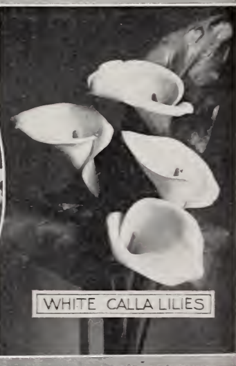
WHITE CALLA LILIES