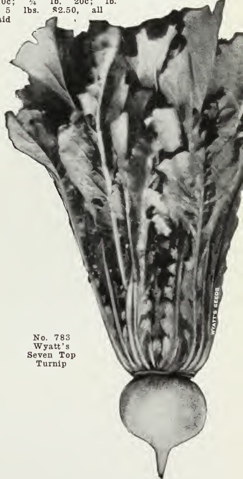
No. 783 Wyatt's Seven Top Turnip

Prices all above varieties of Turnips—5c pkt.; oz. 10c; \frac{1}{4} lb. 20c; lb. 65c; 5 lbs. $2.50, all postpaid