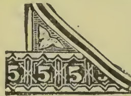
COUNTERFEIT (BOYD PLATE)—DOUBLE SIZE.

The adjoining cut is published by special permission of Chas. J. Folger, Secretary of the Treasury, given under date of December 14, 1882.