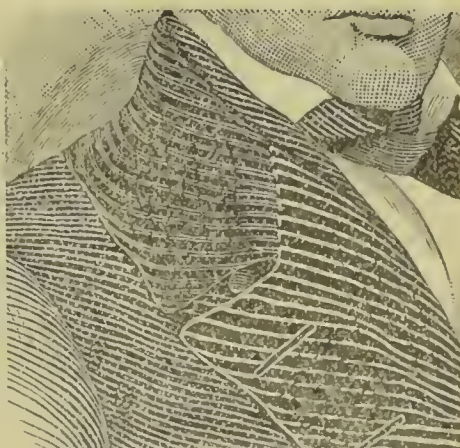
COUNTERFEIT PLATE—DOUBLE SIZE.

The cut to the right is published by special permission of Chas. J. Folger, Secretary of the Treasury, given under date of July 14, 1883.