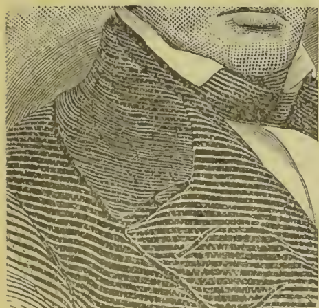
GENUINE PLATE—DOUBLE SIZE.

$10 C. Series of 1875. Act of March 3, 1863. An extensively-circulated counterfeit. In the engraving of vignette head of Webster the face has a surly expression. On the genuine the lines of shading across the breast of Webster's coat are uniform in drawing, equally spaced and regular. In the counterfeit the lines of shading on the body of the coat are much finer, and those on the lapel much coarser than the genuine. Thus the counterfeit also differs from the genuine in showing both coarse and fine lines of shading on the breast of Webster's coat, as may best be seen around the upper button hole and on the adjoining part of the coat, as illustrated in the cuts here presented.