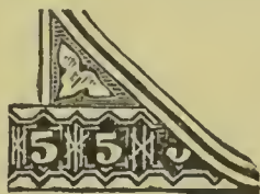
GENUINE PLATE—DOUBLE SIZE.

The adjoining cut is published by special permission of Chas. J. Folger, Secretary of the Treasury, given under date of December 14, 1882.