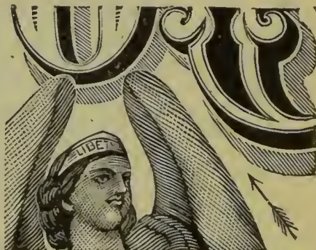
COUNTERFEIT (SMITH PLATE)—DOUBLE SIZE.

The cut to the right is published by special permission of Chas. J. Folger, Secretary of the Treasury, given under date of April 10, 1883.