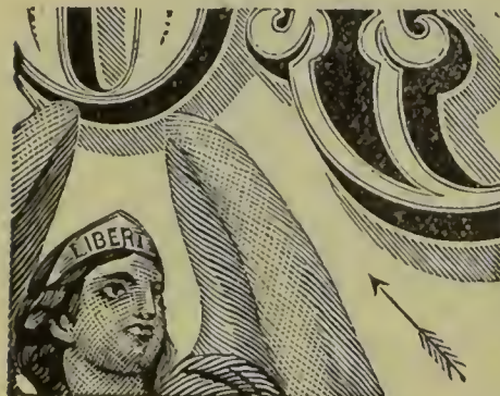
GENUINE PLATE—DOUBLE SIZE.

On the genuine bills the sailor, standing in the bow of the boat, has a fair face with a partly opened mouth; but on all these Smith Plate counterfeit bills the same man has a very widely opened mouth, and eyes of large black dots resembling the eye-holes of a skeleton head.