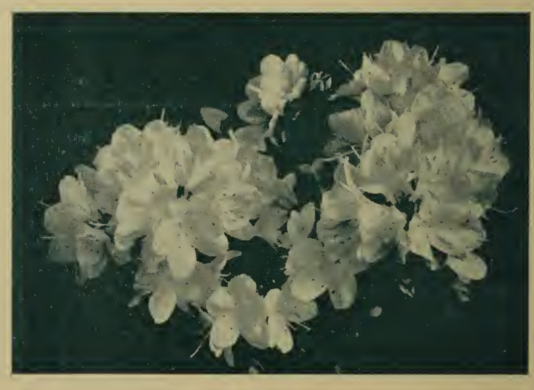
SALMON QUEEN-6-8 inch Size