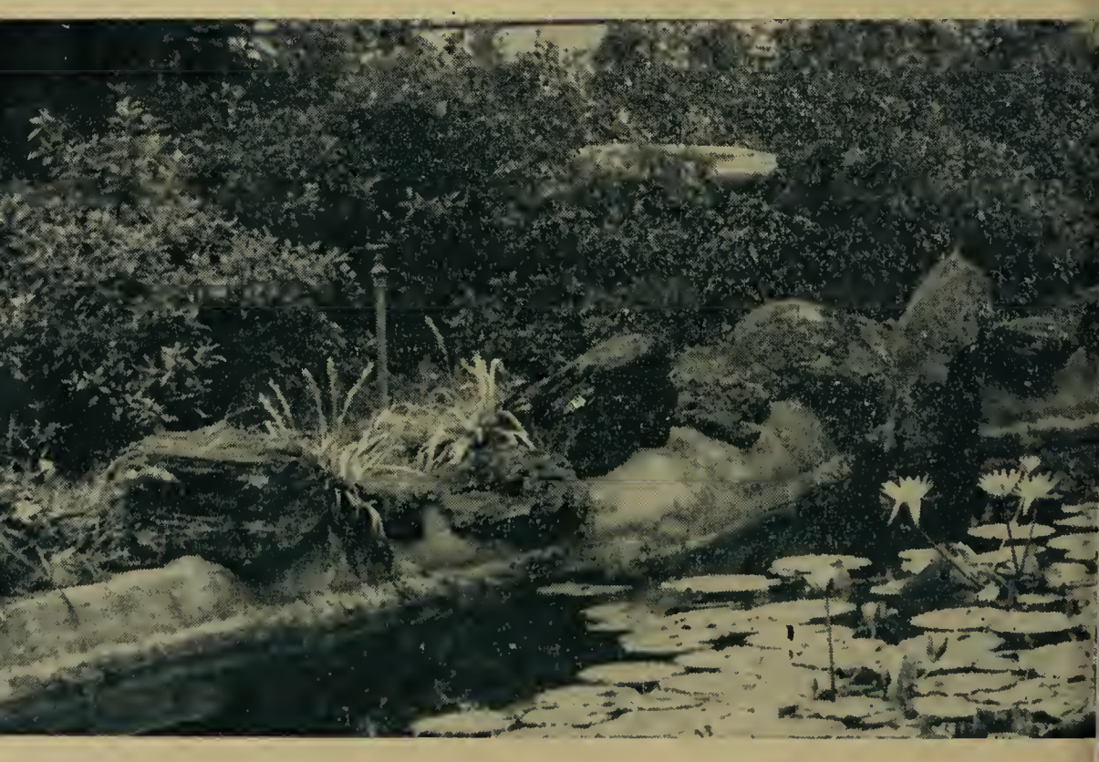
POOL AT ENTRANCE TO NURSERY