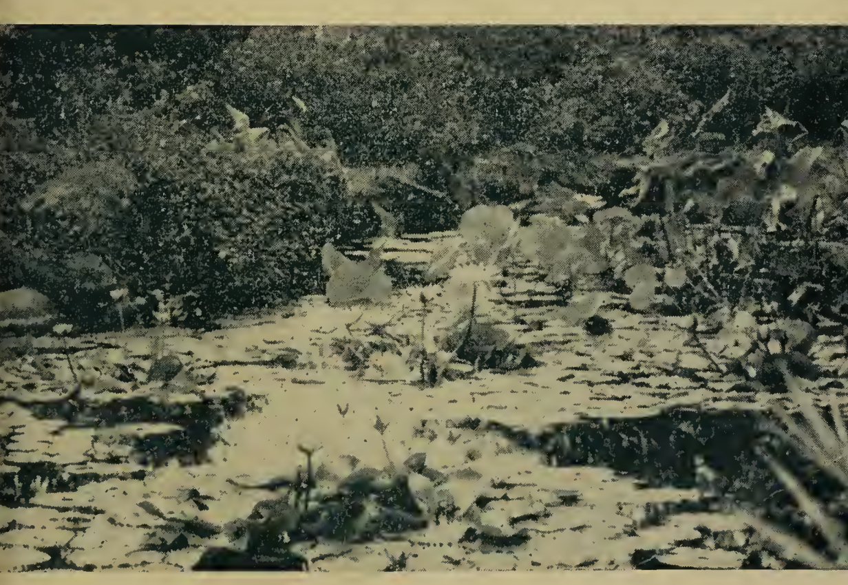
POOL AT ENTRANCE TO NURSERY