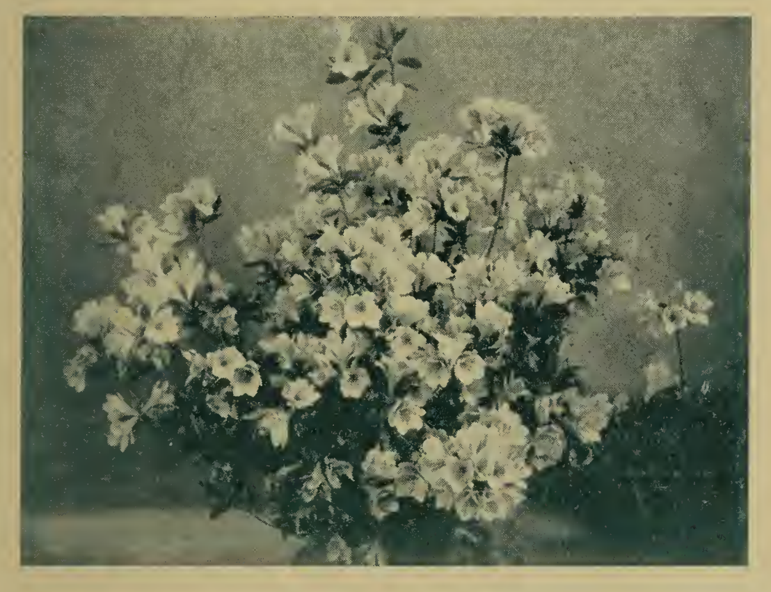
CORAL BELL-10-12 inch Size

The demand for Kurume Azalea as pot plants from Eastern and Northern Florists has been growing by leaps and bounds. When plants are received from us, all you have to do is to pot them in light peaty soil, keep in moderately warm houses, and spray with strong force of water daily to keep down red spiders and they will come into full bloom in