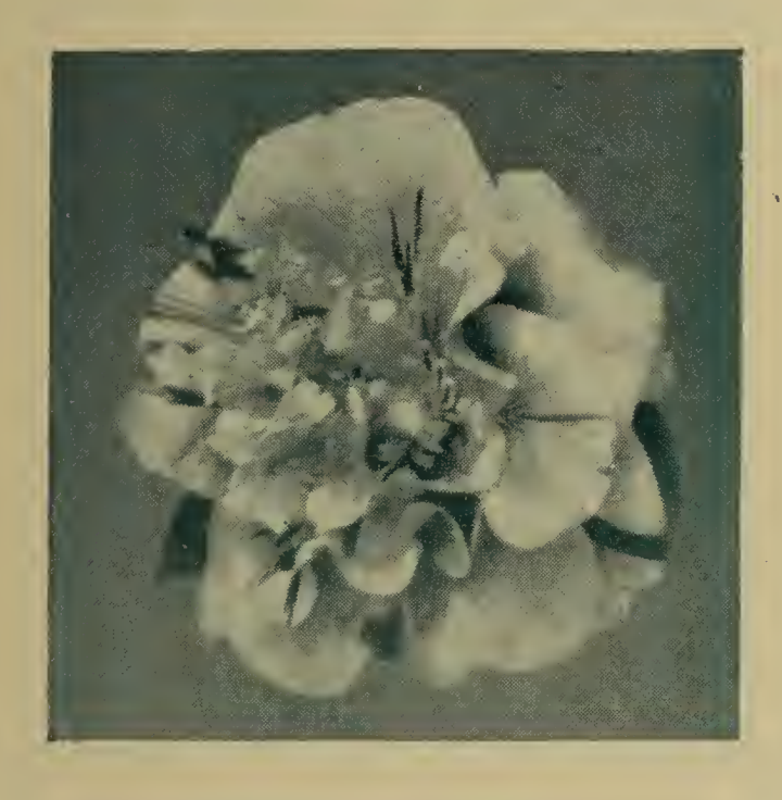
HERME Loose Peony

HERME—Very large loose peony form of elegant shape. Pink and red variegated with white margin. Has faint scent. One of very best. See illustration.