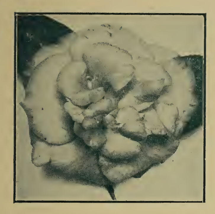
GLOIRE de NANTES Center Petals Twisted

This class includes some of very good kinds, often as good as our A Class but because of a little more plentiful supply, we are listing these excellent varieties at much lower prices.