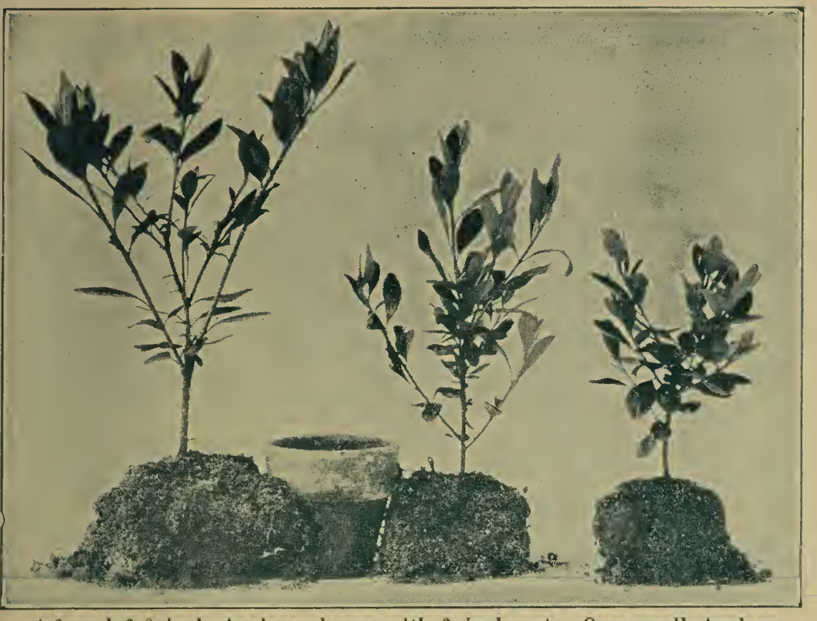
4-6 and 6-8 inch Azaleas shown with 3 inch pot. Our small Azaleas of this Spring offering are better than those illustrated here.

have golden opportunity to give most lasting satisfaction to their customers and incidentally enrich themselves by planting extensive collection of this showy plant in their nurseries, because azaleas will sell themselves when your customers see them in full bloom. We are listing most of important varieties, eliminating weaker growers or inferior flowers when same color can be had in better varieties.