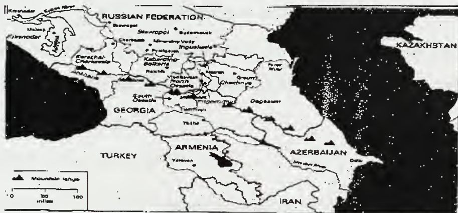
Figure 1. Map of Russia.

Chapter V offers a recommendation, based largely on the work of the Warfighting Lab, for the establishment of a legitimate MOUT training facility, and a month-long training exercise, similar to a Combined Arms Exercise (CAX) at 29 Palms, Ca., or to Mountain Warfare Training Center (MWTC) Bridgeport, Ca., that will address deficiencies in the current MOUT training.