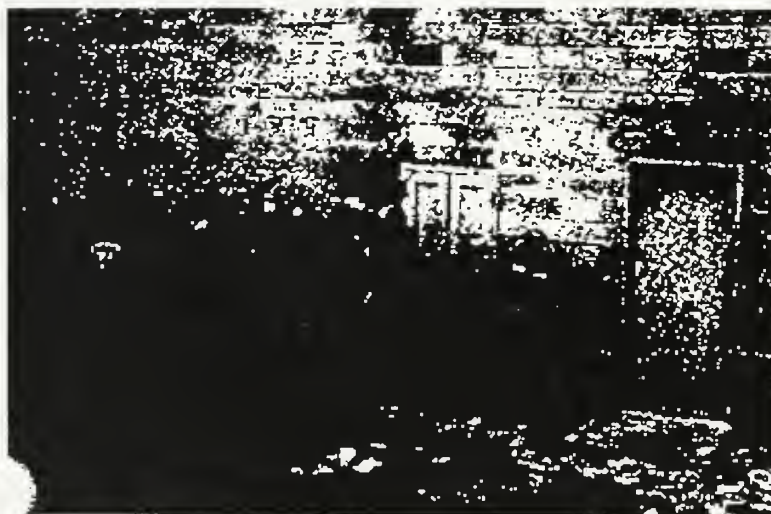
Marines at MOUT Instructors Course are taught the stack technique for entering a building.