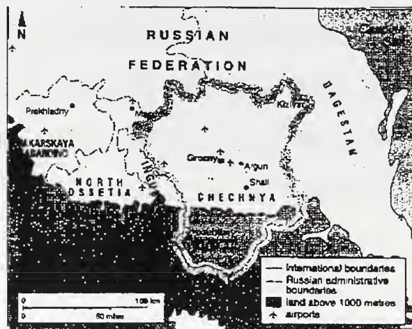
Figure 2. Map of Chechnya.