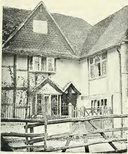
OLD HOUSE, COSCOTE