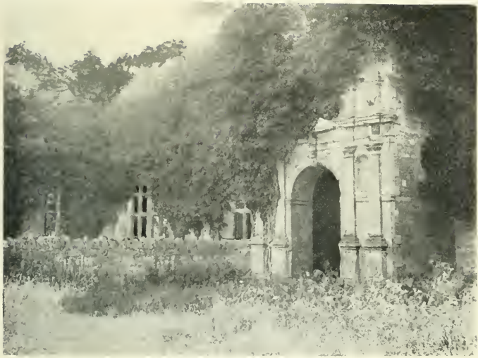
ABBAY RUINS, ELSTOW