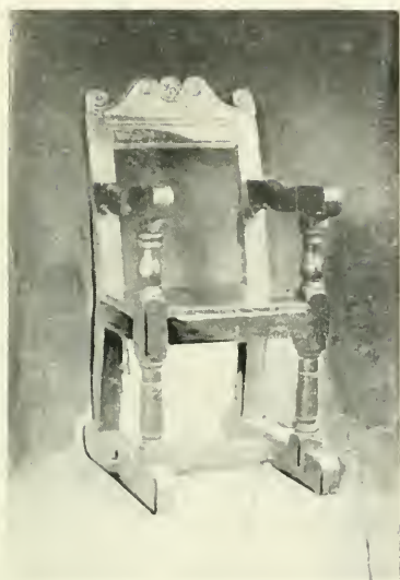
DUCKING CHAIR, WOOTTON BASSETT