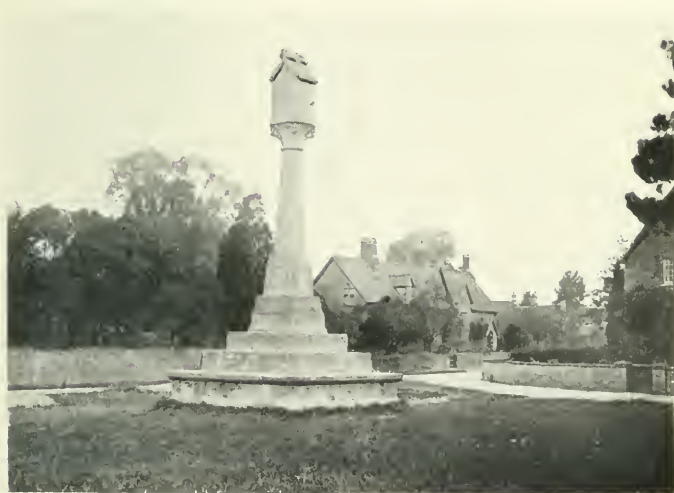
CROSS, DOWN AMPNEY