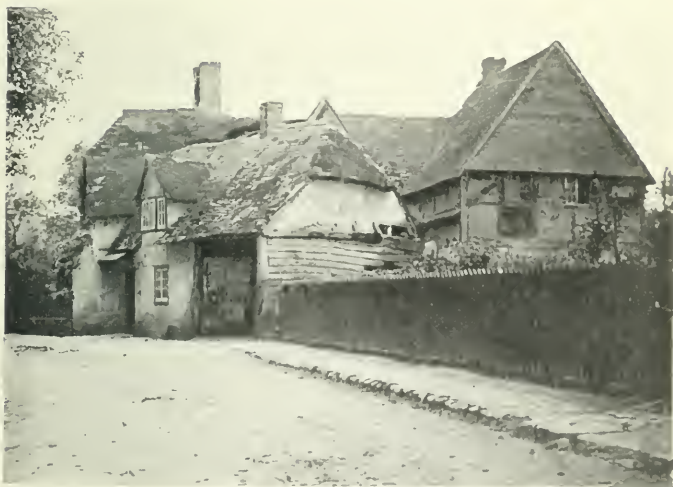
OLD HOUSE, EAST HAGBOURNE