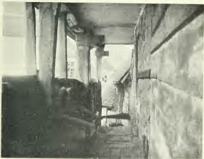
"THE GEORGE," DORCHESTER