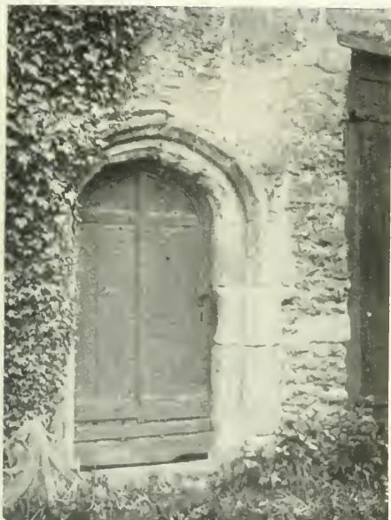
MANOR FARM, SANDFORD