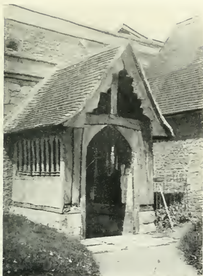
PORCH, LONG WITTENHAM