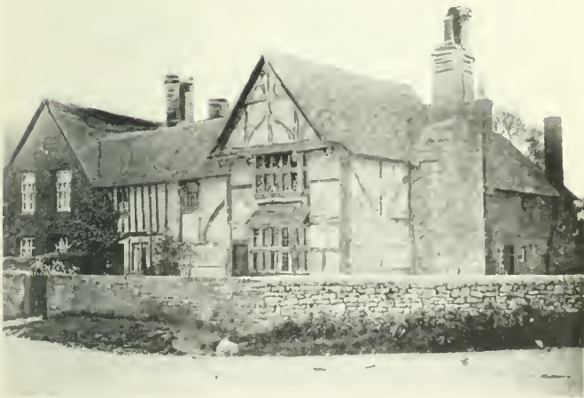
OLD HOUSE, STEVENTON