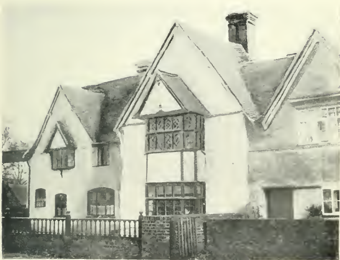
OLD HOUSE, STEVENTON