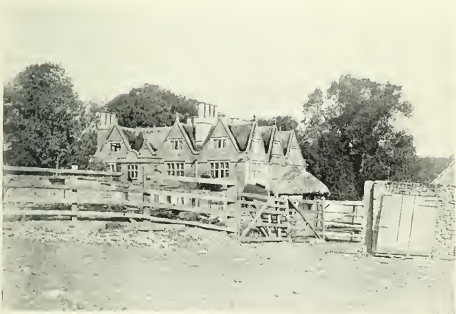
MANOR HOUSE, UPPER SLAUGHTER