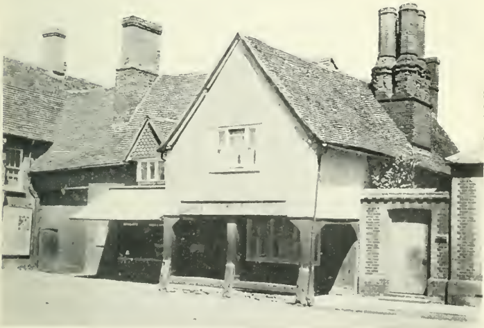
OLD HOUSE, SHEFFORD