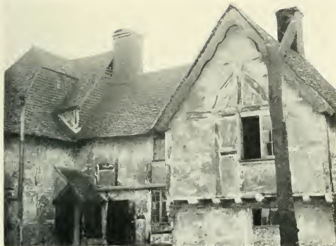
OLD HOUSE, STEVENTON