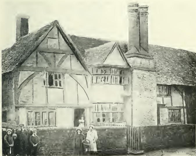
OLD HOUSE, STEVENTON