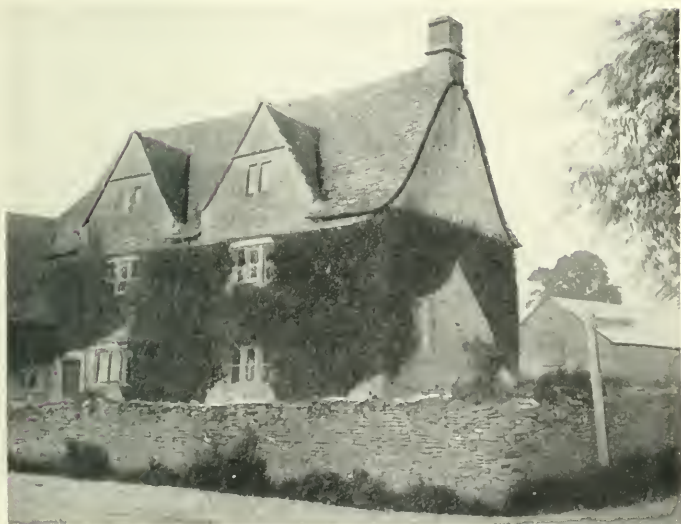
OLD HOUSE, MARSTON MEYSEY