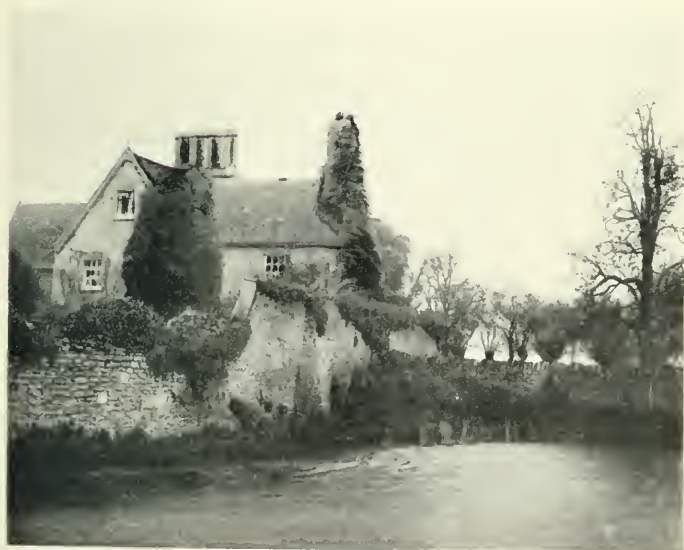
MANOR HOUSE, LYFORD