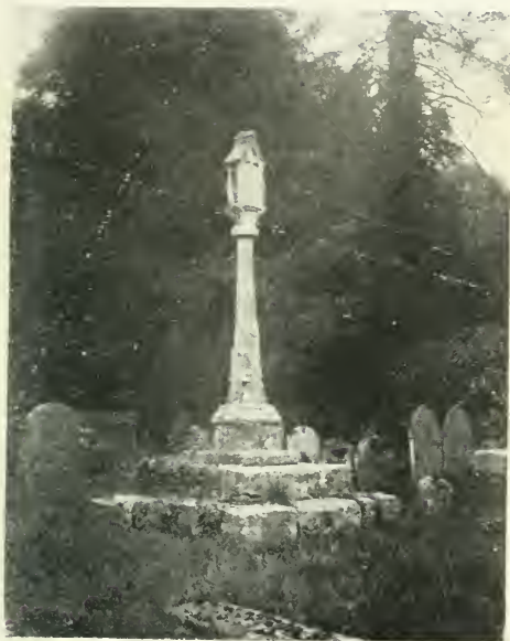
CROSS, AMPNEY CRUCIS