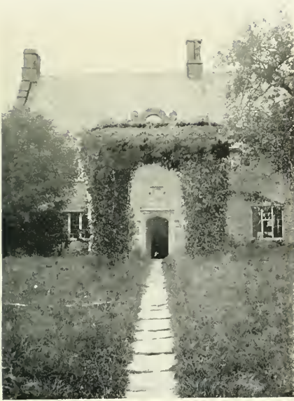
ABBAY LODGE, FARNINGHOE