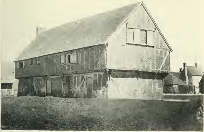
MOOT HALL, ELSTOW