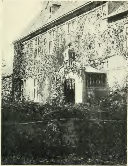
OLD HOUSE, BOURTON