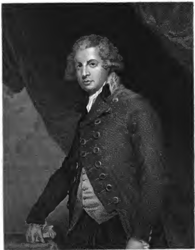
General [Name] [Name] [Name] [Name] [Name]