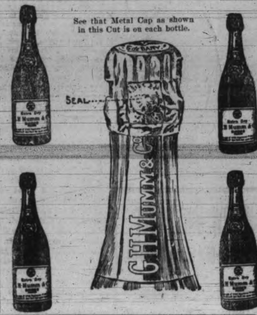
See that Metal Cap as shown in this Cut is on each bottle.