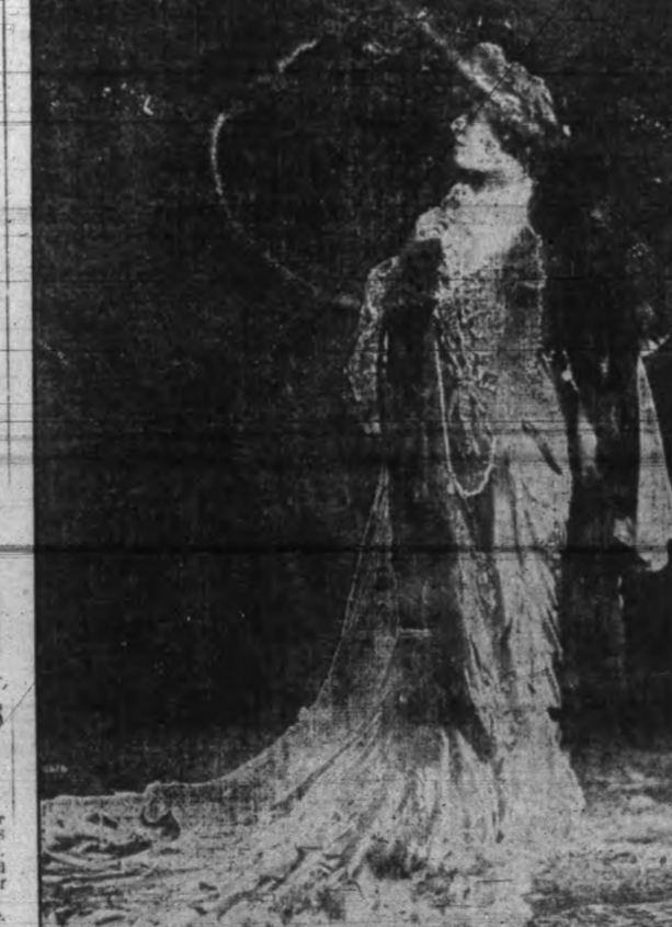
MRS. LESLIE CARTER, THE EMOTIONAL ACTRESS, WHO APPEARS AT THE VICTORIA THEATRE ON FRIDAY NIGHT