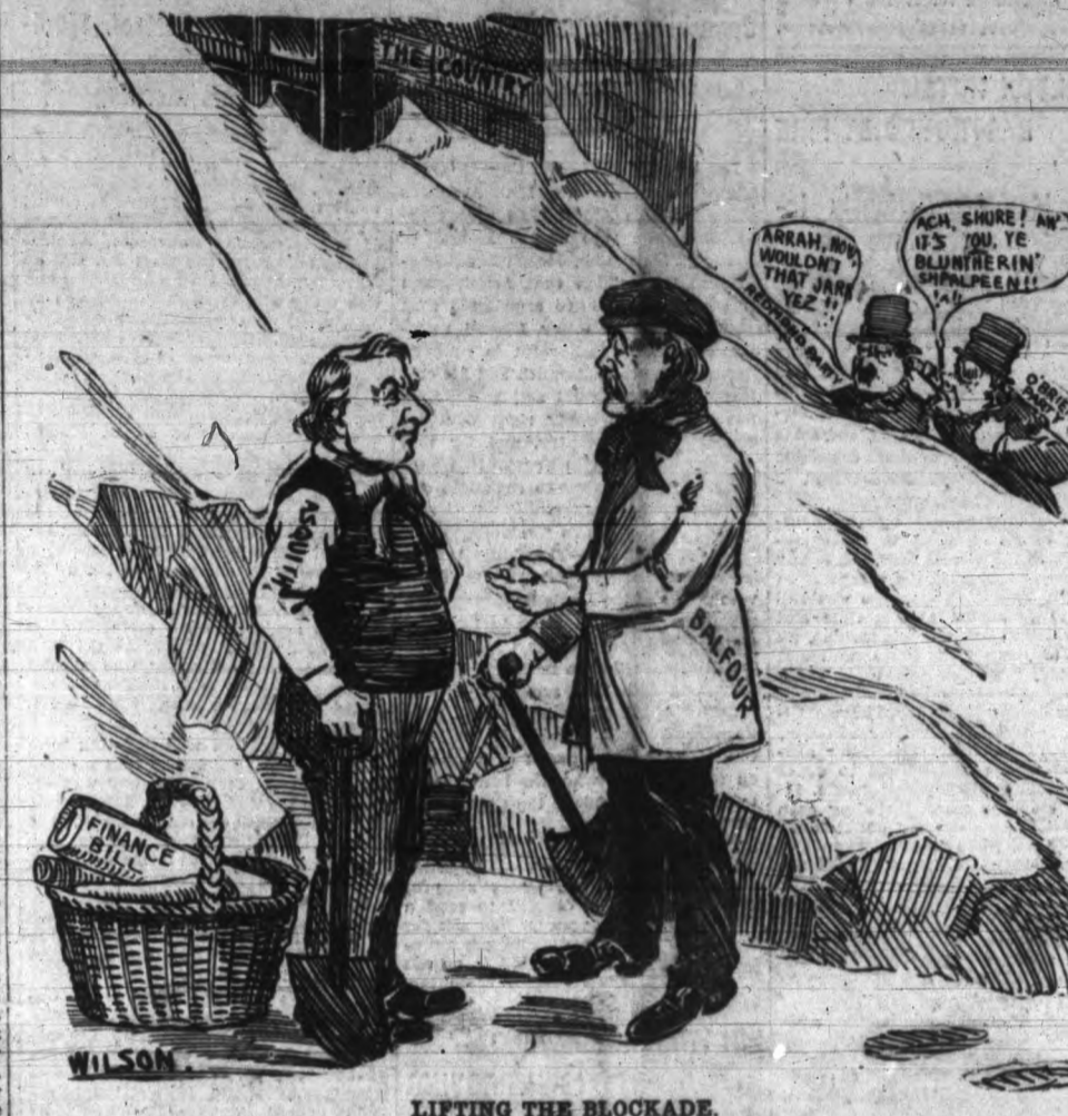
WILSON LIFTING THE BLOCKADE. ARTHUR—"Look here, old man, I think we can drop our differences long enough to get provisions into these people."