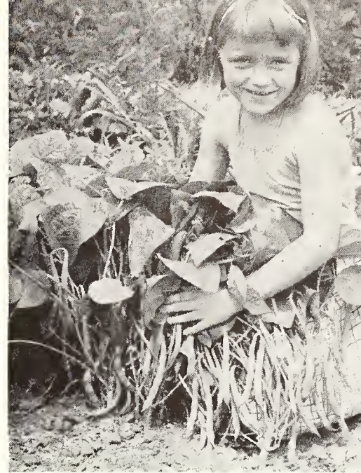
BUSH BEAN WADE