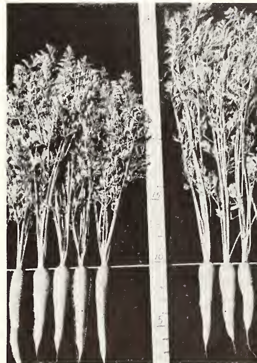
Left, CARROT IMPERIDA Right, CARROT IMPERATOR